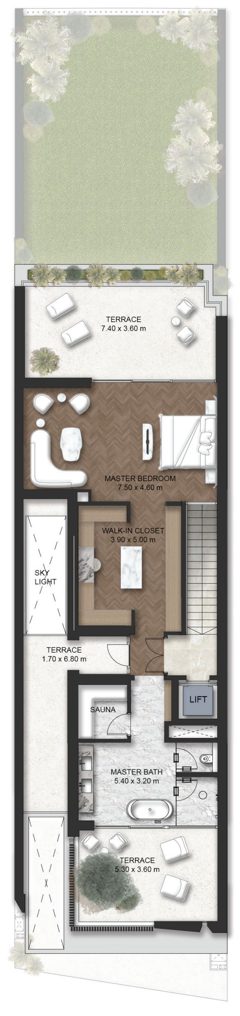
THE MEGA MASTER