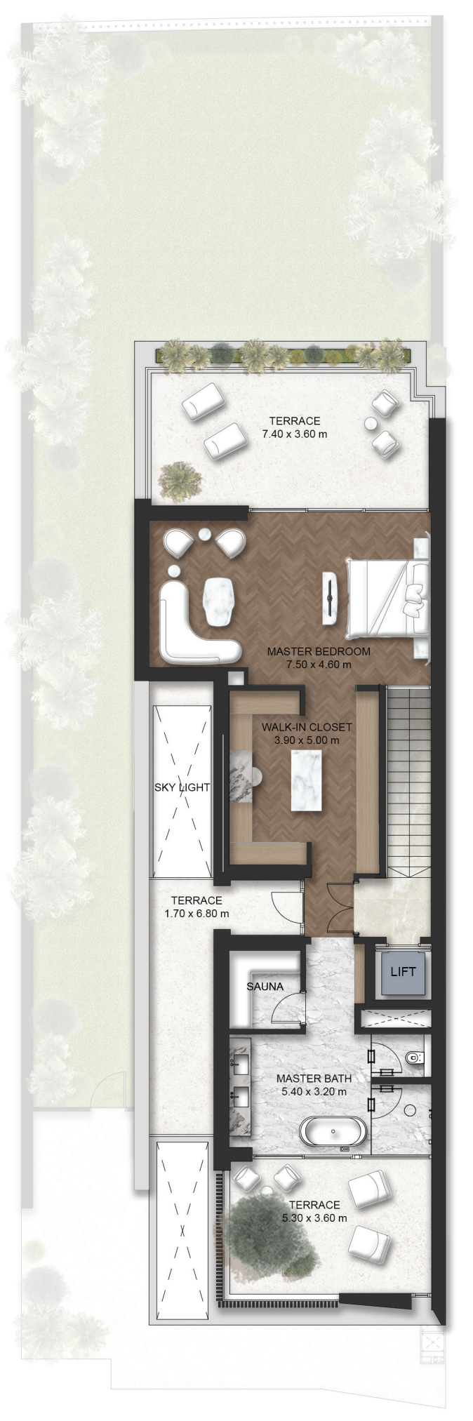
THE MEGA MASTER