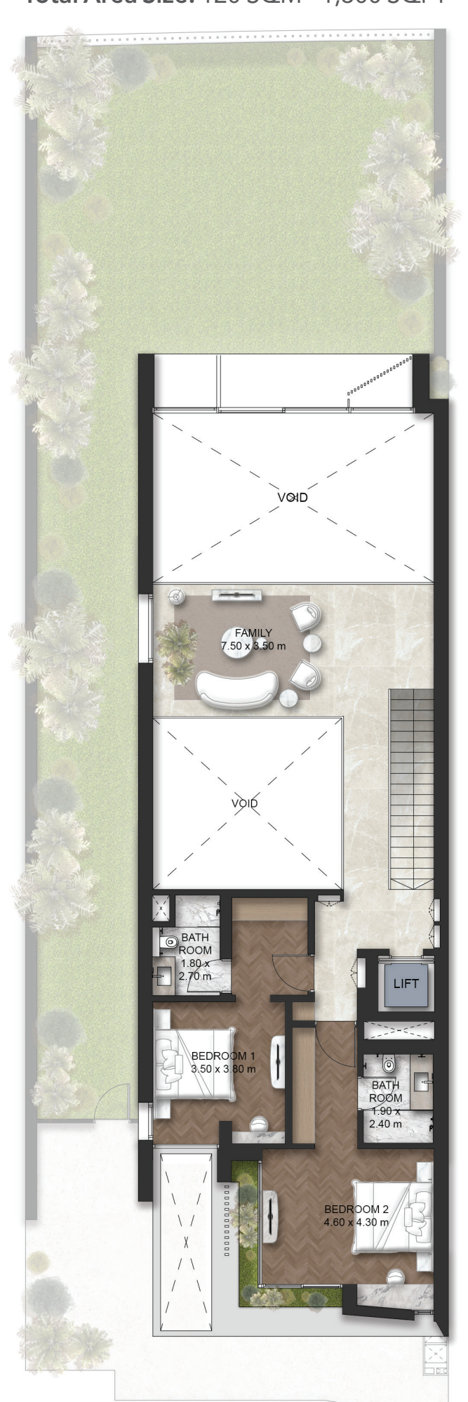
THE DOUBLE HEIGHT