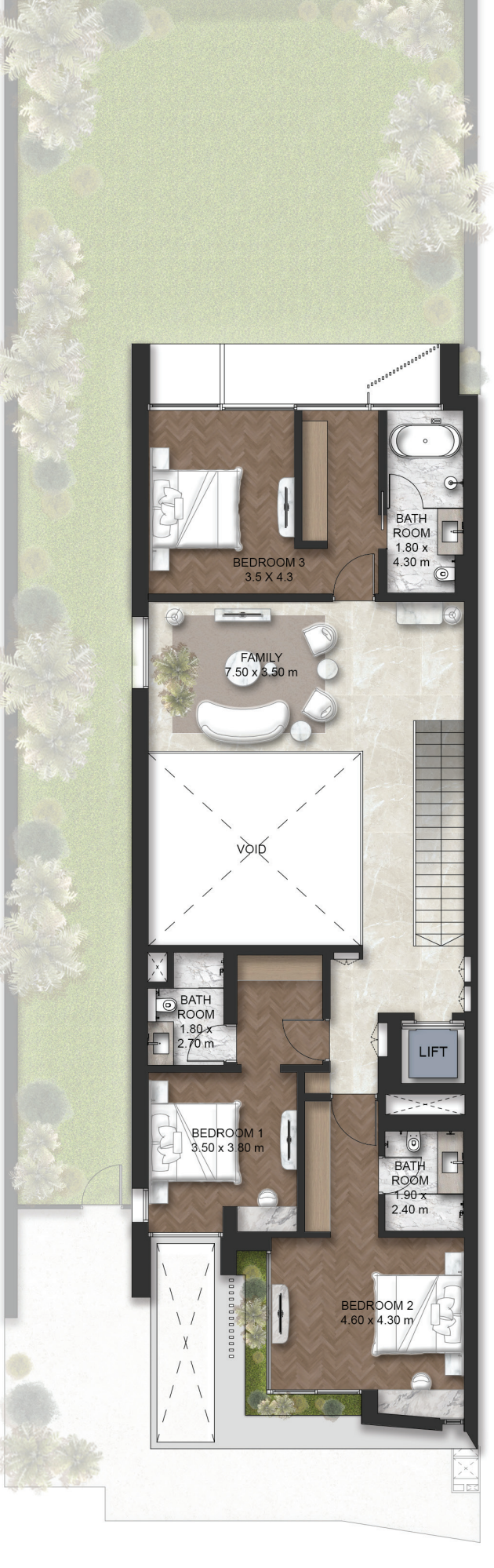
THE SECOND MASTER