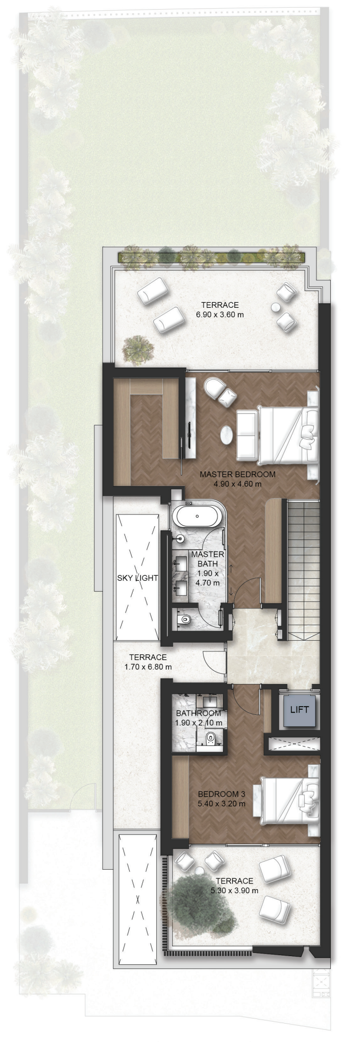
THE EXECUTIVE SUITE