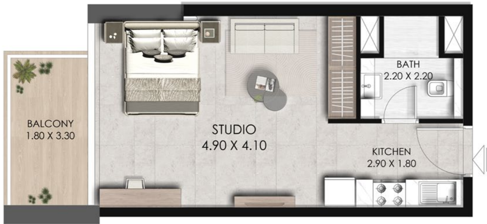
Studio Type 1