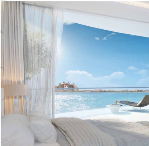
Large private terraces perfectly orientated with views of the Atlantis and the Dubai skyline.