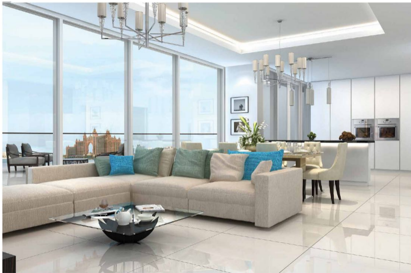
Seek living room interiors with clean lines, neutral tones and meticulous finishes.