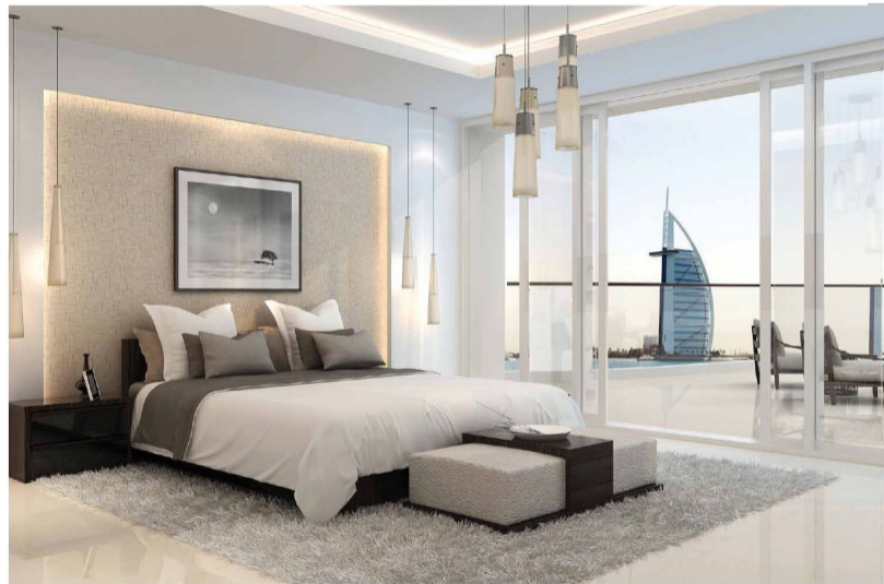
Spacious and well-designed bedrooms with floor-to-ceiling windows and large terrace provide sea view and privacy. All bedrooms are en suite.