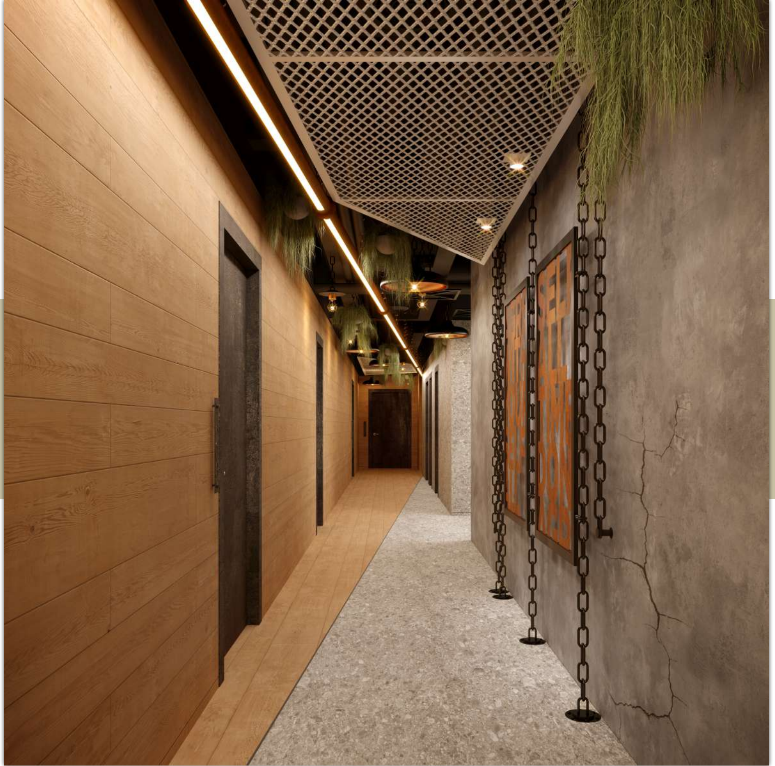
Vision of industrial style in mind