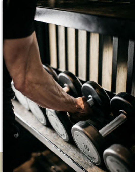
Our gymnasium is fully equipped to meet your every day.