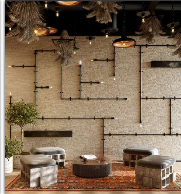
From the moment you step inside, you will feel the strong sense of homeliness and the relaxing natural colours.