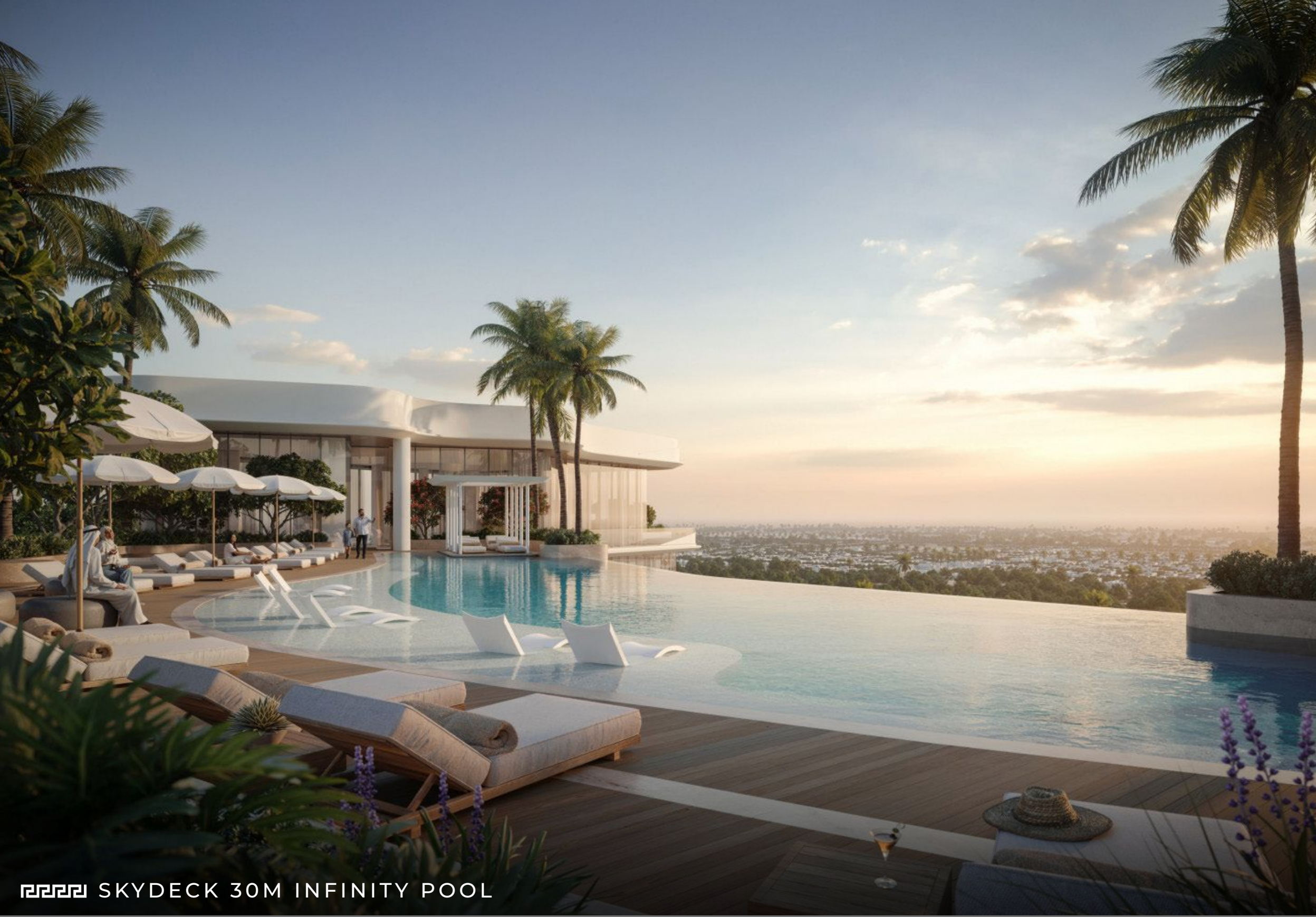
SKYDECK 30M INFINITY POOL