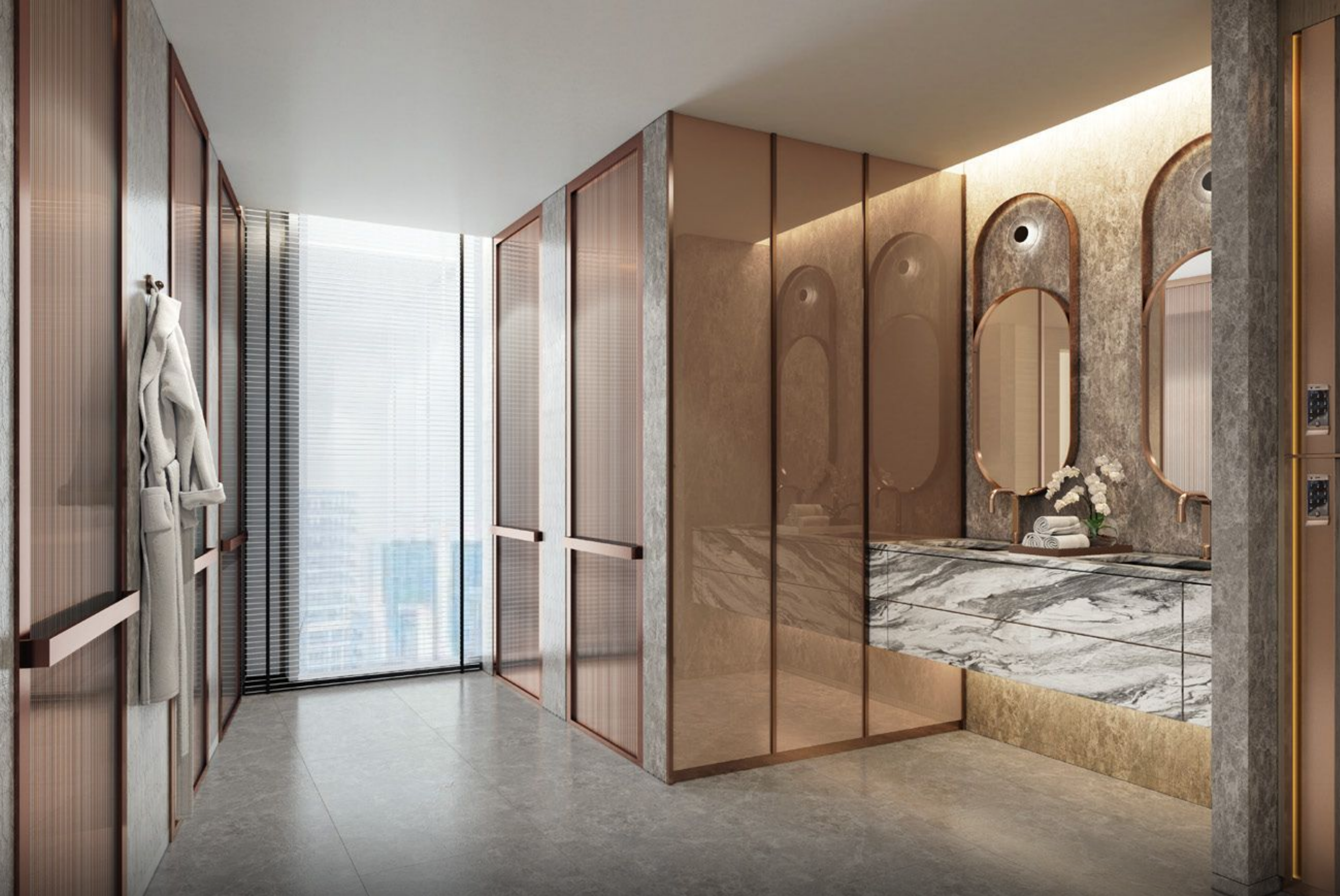
SAUNA, STEAM ROOM & COLD THERAPY ROOM