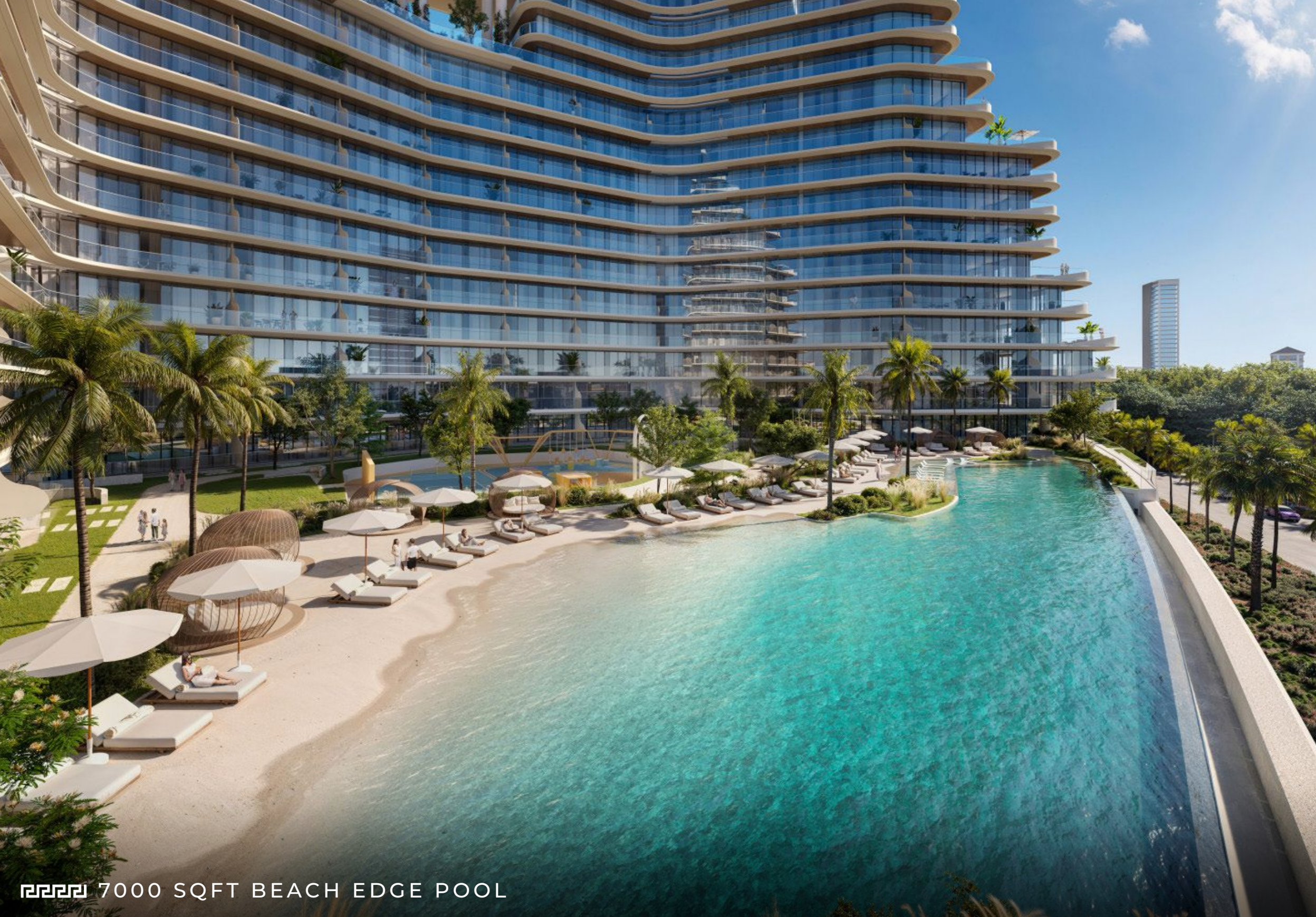
7000 SQFT BEACH EDGE POOL