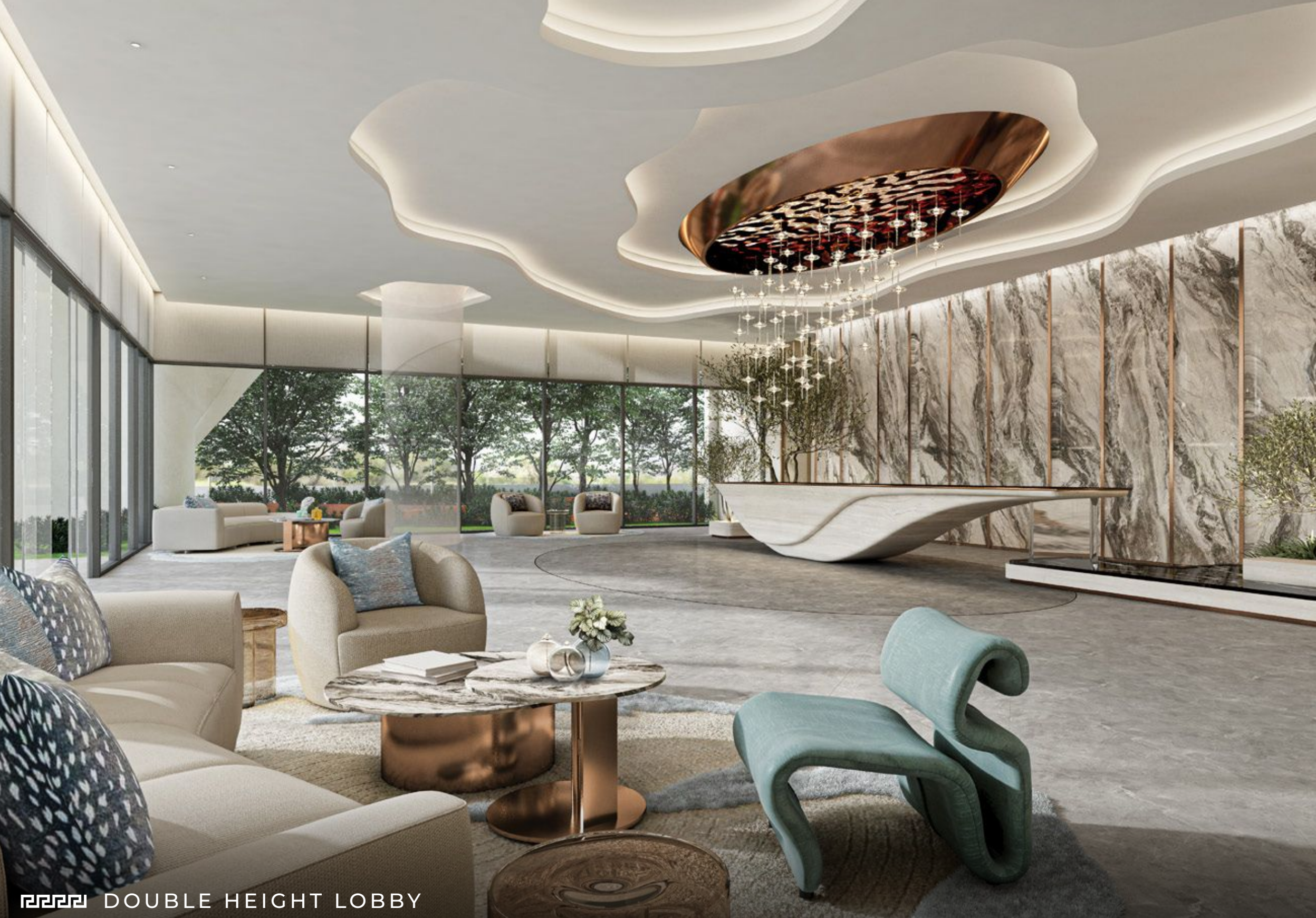
DOUBLE HEIGHT LOBBY