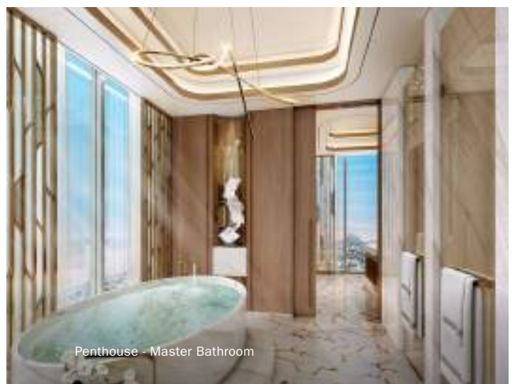
Penthouse - Master Bathroom

Images in this factsheet are for illustrative purposes only. The developer reserves the right to change or substitute all or parts of the materials, appliances, equipment, fixtures, and/or other details without prior notice.