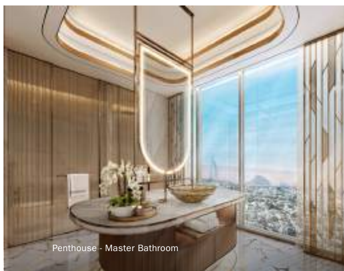
Penthouse - Master Bathroom