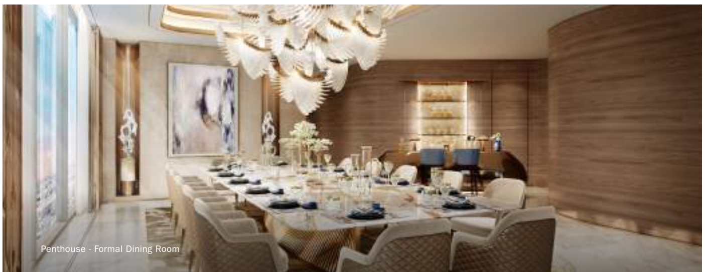
Penthouse - Formal Dining Room

Images in this factsheet are for illustrative purposes only. The developer reserves the right to change or substitute all or parts of the materials, appliances, equipment, fixtures, and/or other details without prior notice.