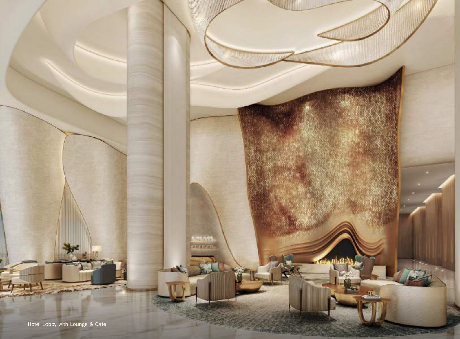
Hotel Lobby with Lounge & Cafe