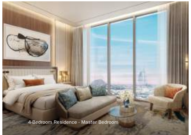
4-Bedroom Residence - Master Bedroom