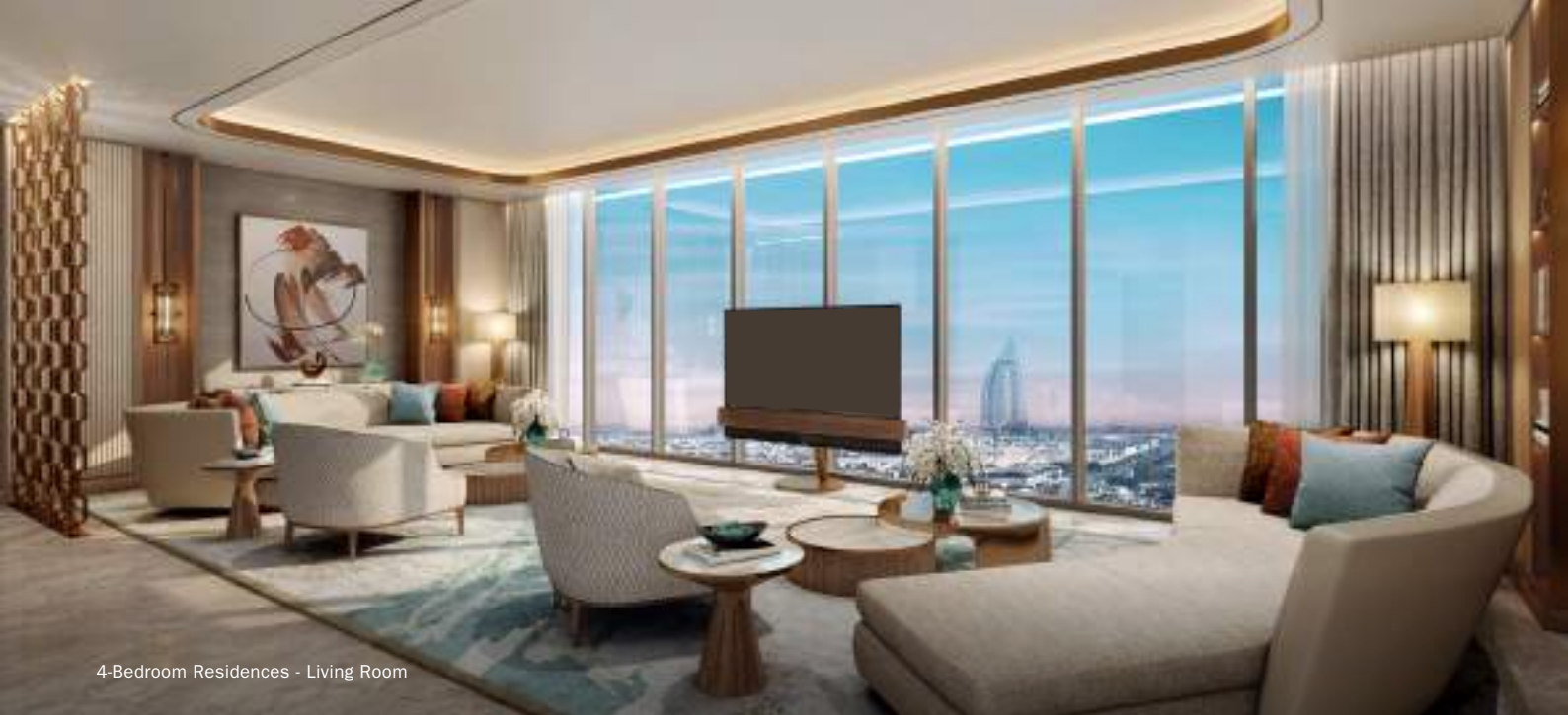
4-Bedroom Residences - Living Room