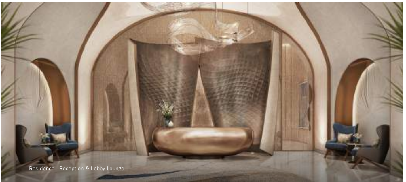
Residence - Reception & Lobby Lounge

The interiors of Fairmont Residences Dubai Skyline, designed by award-winning interior designer Kristina Zanic, embody the essence of Dubai - a luxurious blend of warmth, elegance, and glamour rooted in rich Middle Eastern heritage.