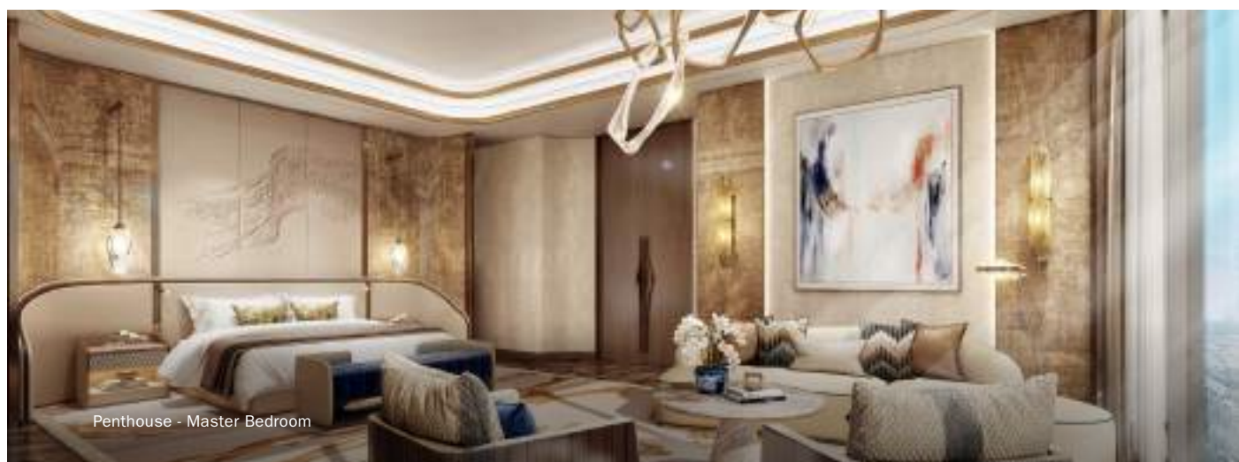
Penthouse - Master Bedroom

Rich marble textures and leather, complemented by walnut wood and bronze metal accents, with shades taken from different seasons of sunset, symbolise balance and freshness.