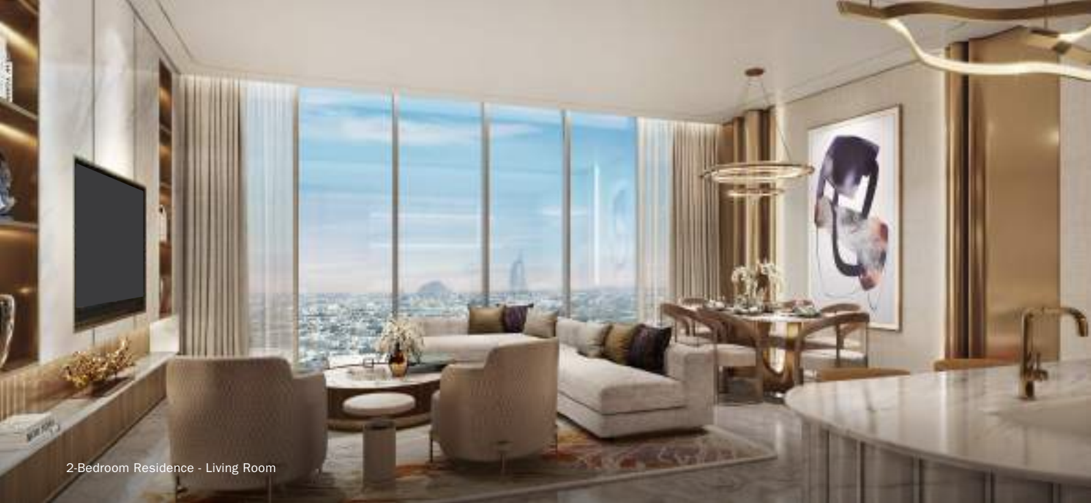
2-Bedroom Residence - Living Room