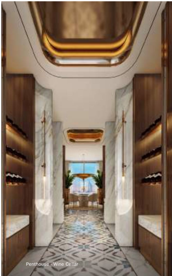
Penthouse - Wine Cellar

The fluent patterns, refined motifs and details are inspired by the incredible views from the residences.