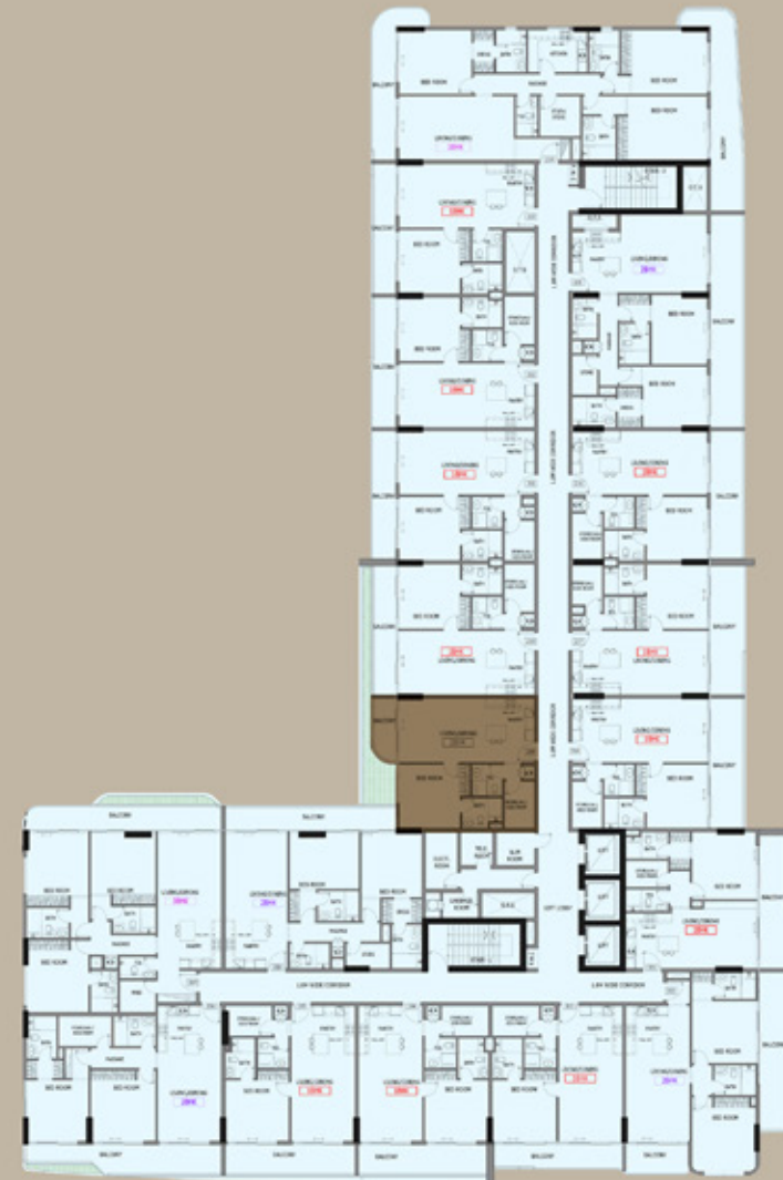
Key Plan | 2 ND Floor