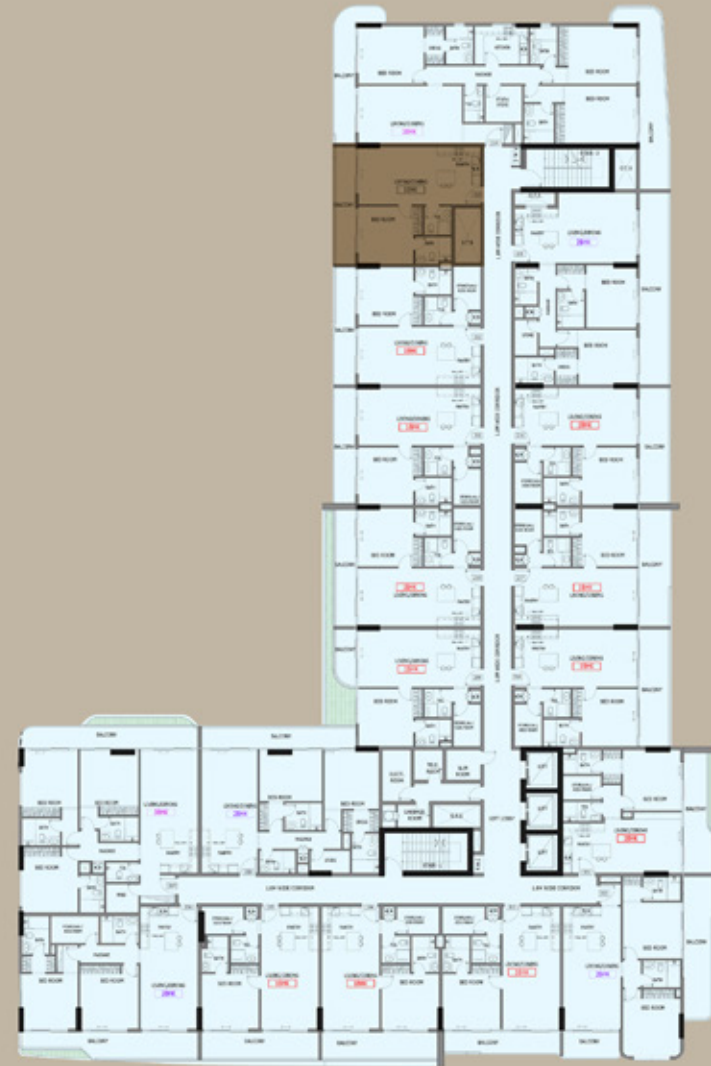
Key Plan | 2 ND Floor