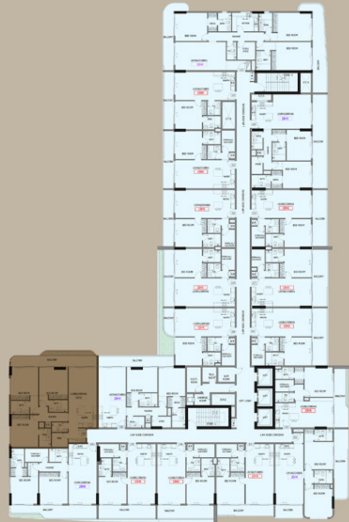
Key Plan | 2 ND Floor