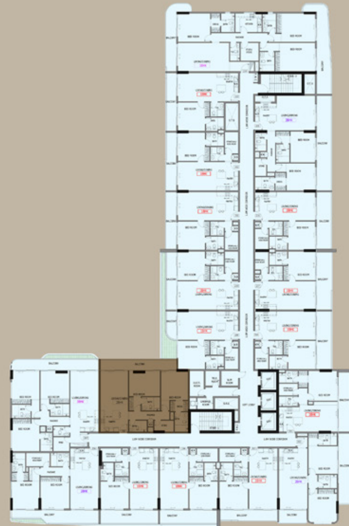
Key Plan | 2 ND Floor