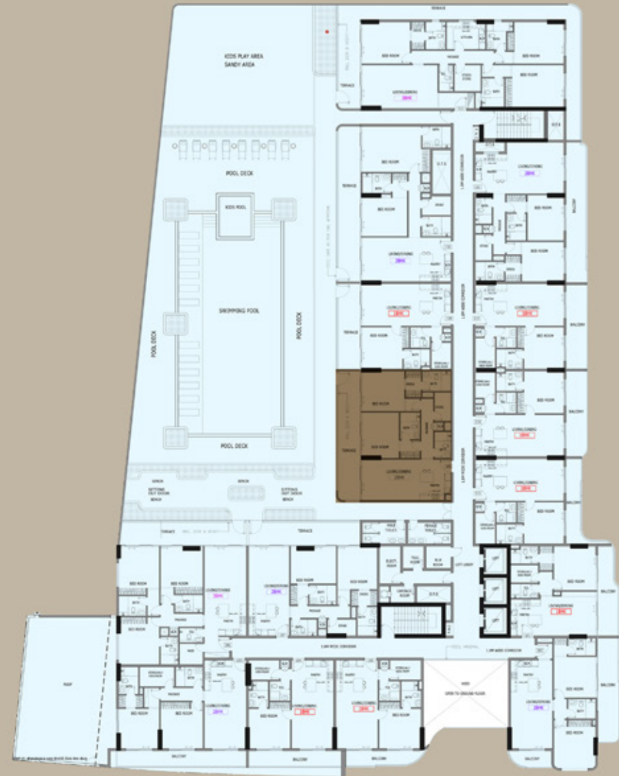
Key Plan | 1 ST Floor