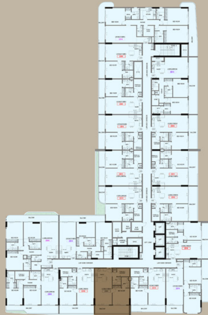
Key Plan | 2 ND Floor