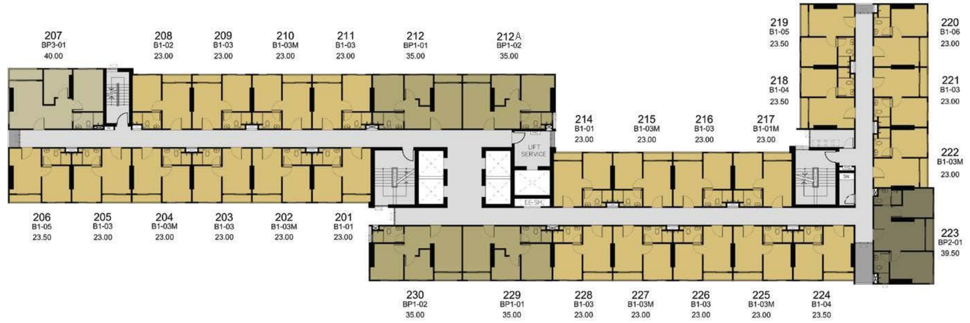
NOTTING HILL- Sukhumvit Praksa 2nd-29th Floor Plan