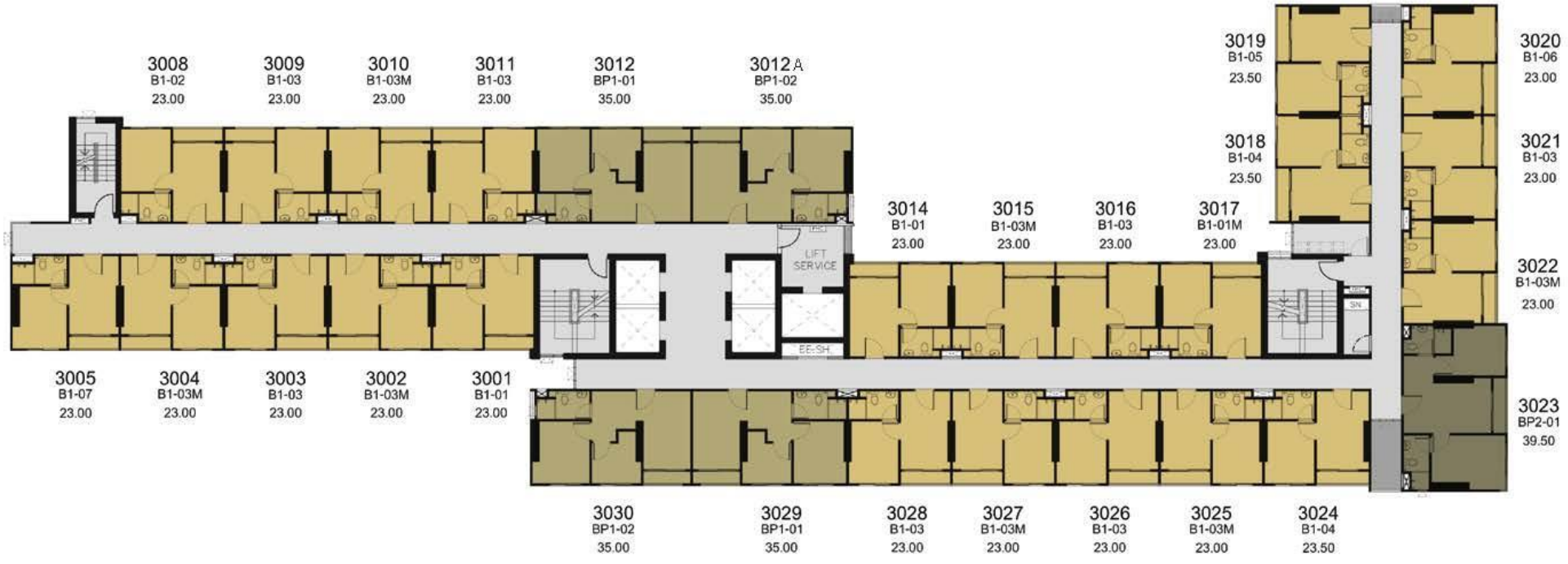
NOTTING HILL- Sukhumvit Praksa 30th-34th Floor Plan