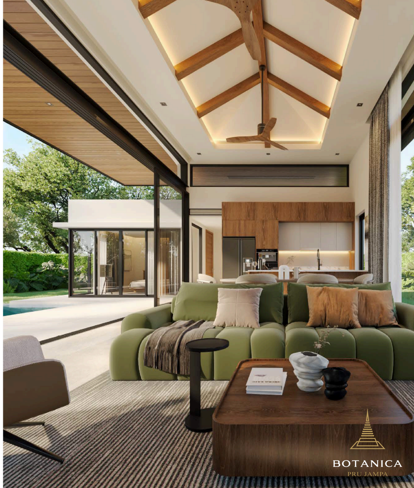
Mid-Century Modern Design