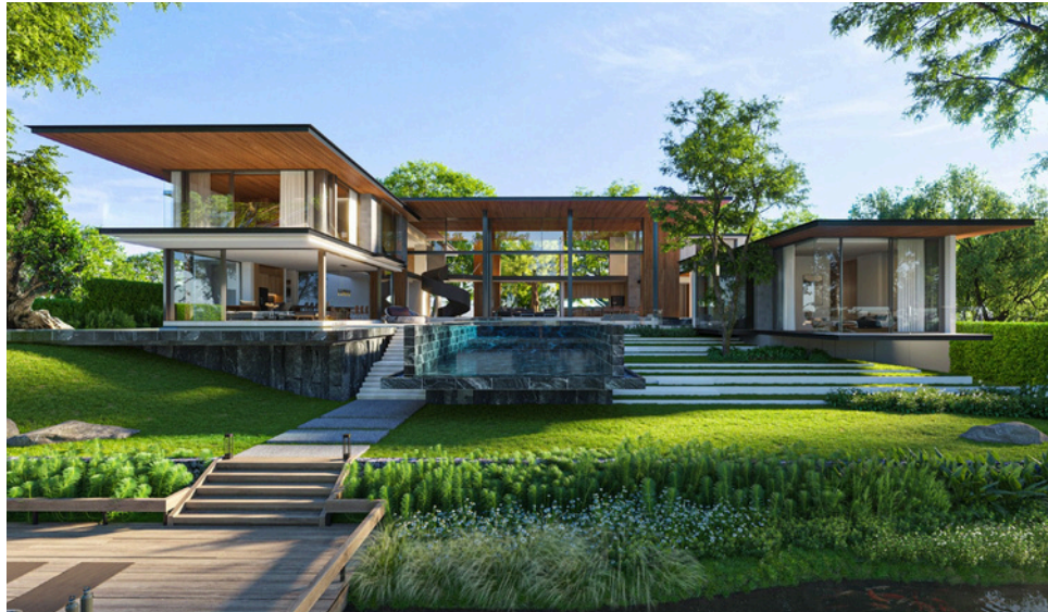
Grand Modern Luxury