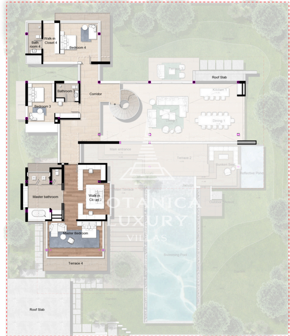
Upper Level Plan

DISCLAIMER: WHILST EVERY CARE HAS BEEN TAKEN IN PREPARING THE SALES INFORMATION AND ARTISTS' DIGITAL AND ARTISTIC IMPRESSIONS IN THIS BROCHURE, THE DEVELOPER DOES NOT GUARANTEE THEIR ACCURACY NOR INTENDS THEM TO FORM ANY PART OF AN OFFER OR CONTRACT. THE DEVELOPER ALSO RESERVES THE RIGHT TO MAKE CHANGES TO THE RESIDENCE DESIGNS PRESENTED HEREIN AT ANY TIME, AT ITS OWN DISCRETION AND WITHOUT PRIOR NOTICE TO PROSPECTIVE BUYERS.