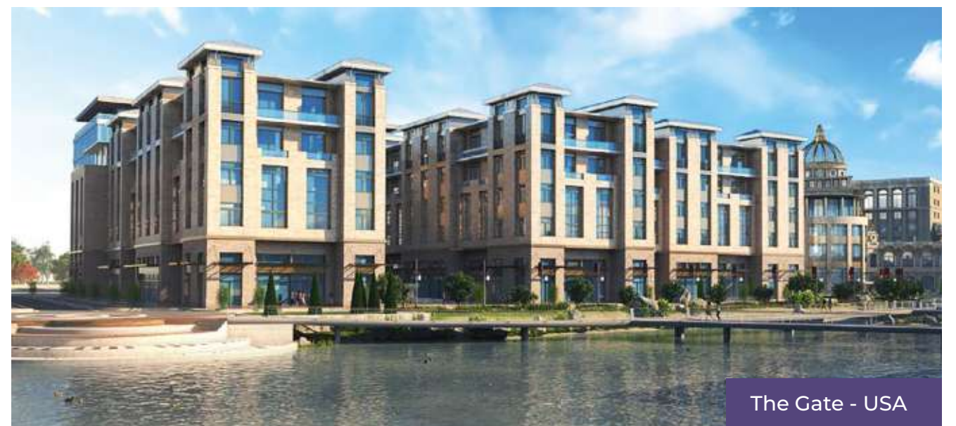
The Gate - USA

Today, an expanded and impressive portfolio of premium properties, which includes some of the most sought-after properties by meticulous clients worldwide, serve as a testament to IGO's well-deserved reputation as one of the top regional investment companies.