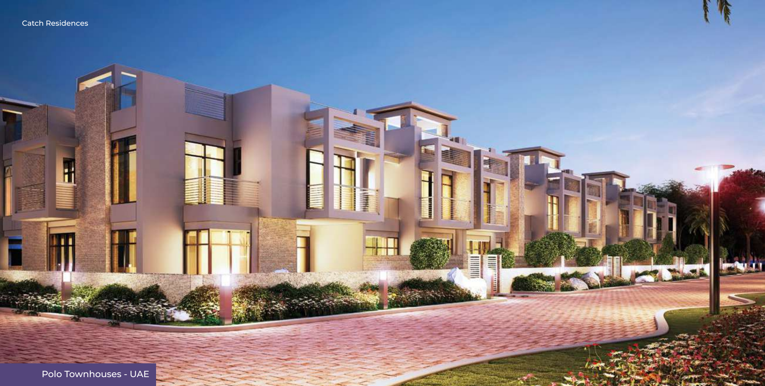
Polo Townhouses - UAE