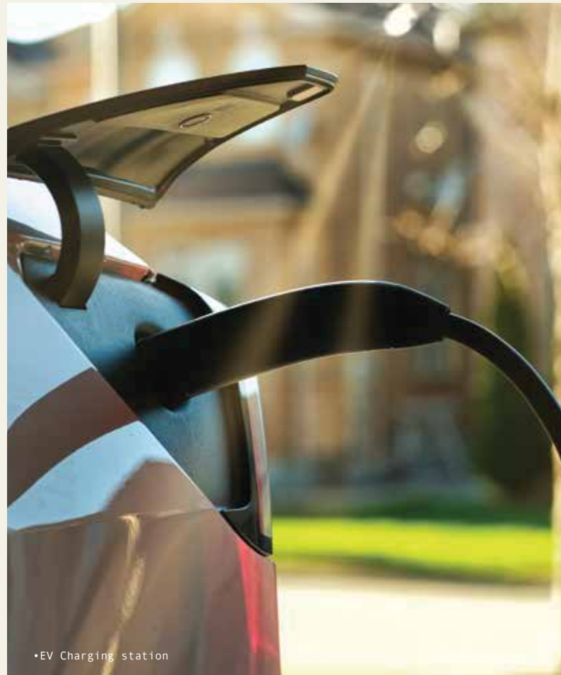
•EV Charging station

At Project Symbolic Alpha, we go the extra mile with electric vehicle charging stations. Encouraging ecoconscious living, conveniently located on-site for residents to charge their cars. Join us in reducing our carbon footprint and embracing a cleaner, greener future.