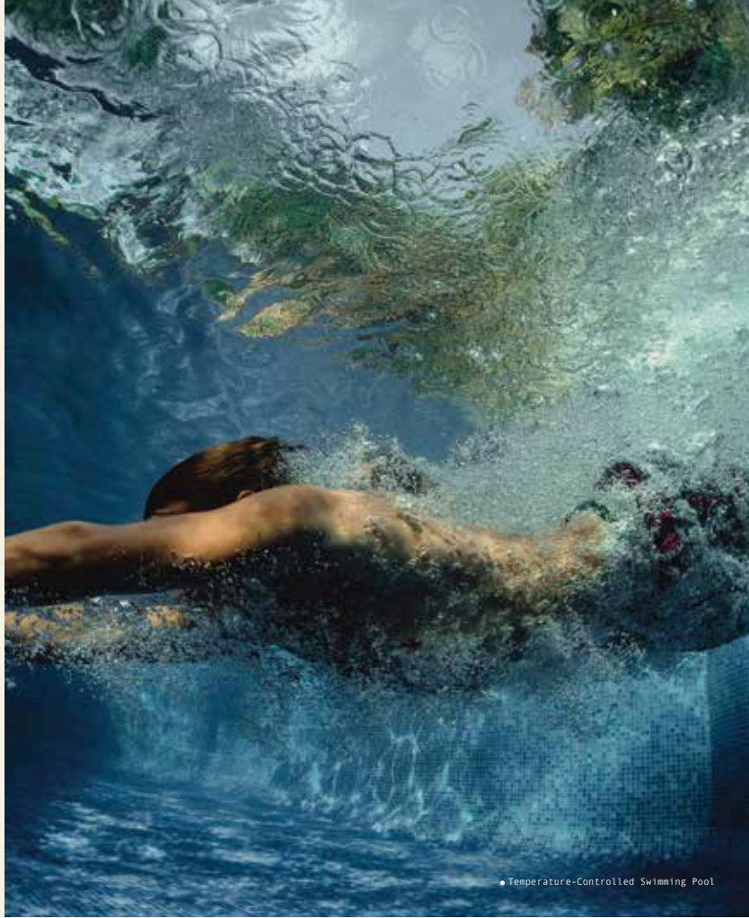
• Temperature-Controlled Swimming Pool

Imagine gliding through crystal-clear waters, caressed by the perfect temperature that remains blissfully constant, inviting you for a refreshing dip no matter the season. Feel the gentle embrace of the water as you embark on a leisurely swim or power through invigorating laps to keep your body and mind in perfect harmony.