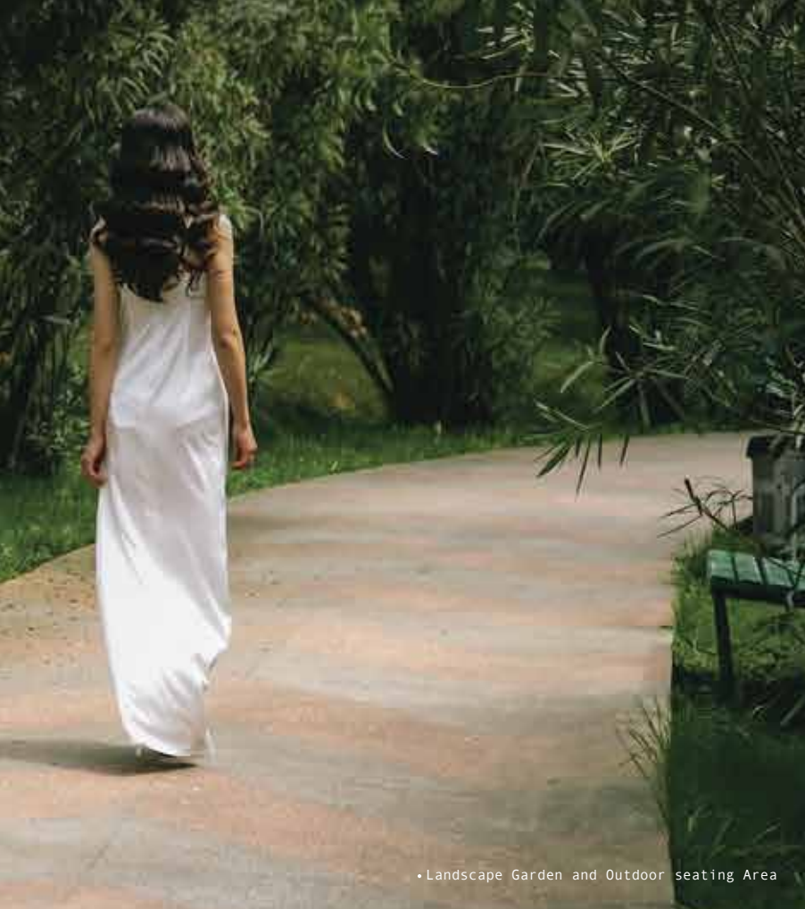
•Landscape Garden and Outdoor seating Area