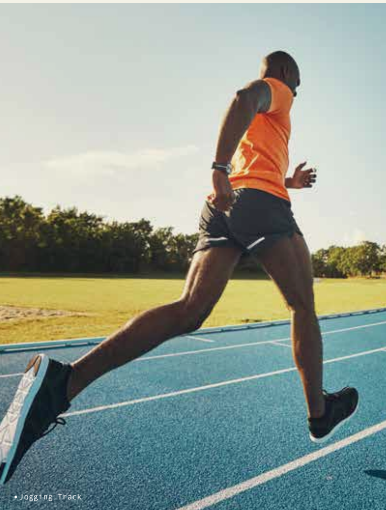
• Jogging Track