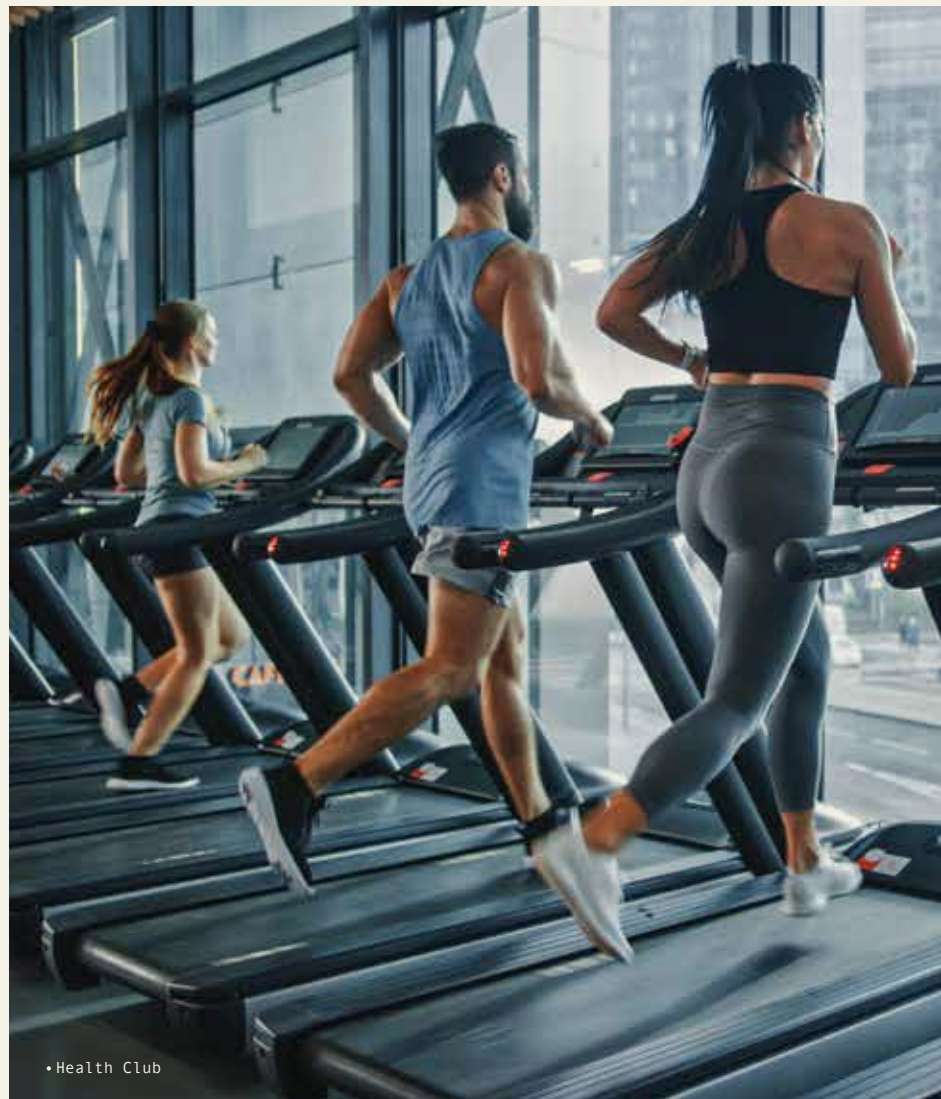
• Health Club

Elevate your fitness at our state-of-the-art Health Club designed for all residents. With a mixed gender gym, premium equipment, a serene sauna, and convenient lockers, it's the ideal place to stay healthy. Enjoy shared amenities like showers, and changing rooms, ensuring a comfortable and enjoyable workout experience for everyone.