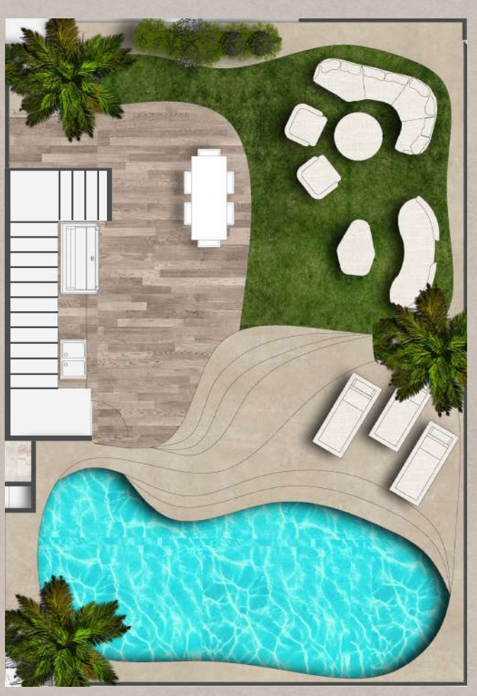
Pool View TO 1