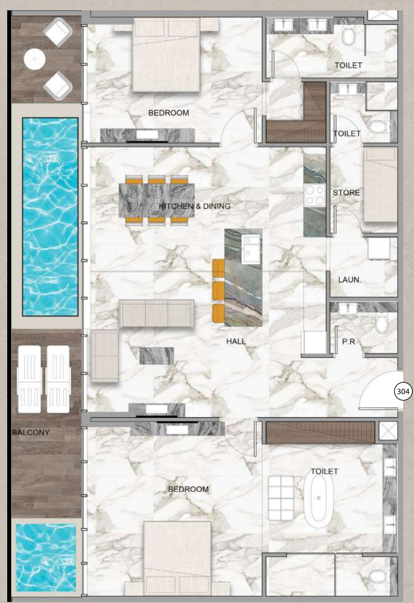
Two Bedroom Apartment Layout Type C Total Area: 1,755 Sqft