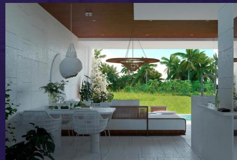
Green Flow Villa 21