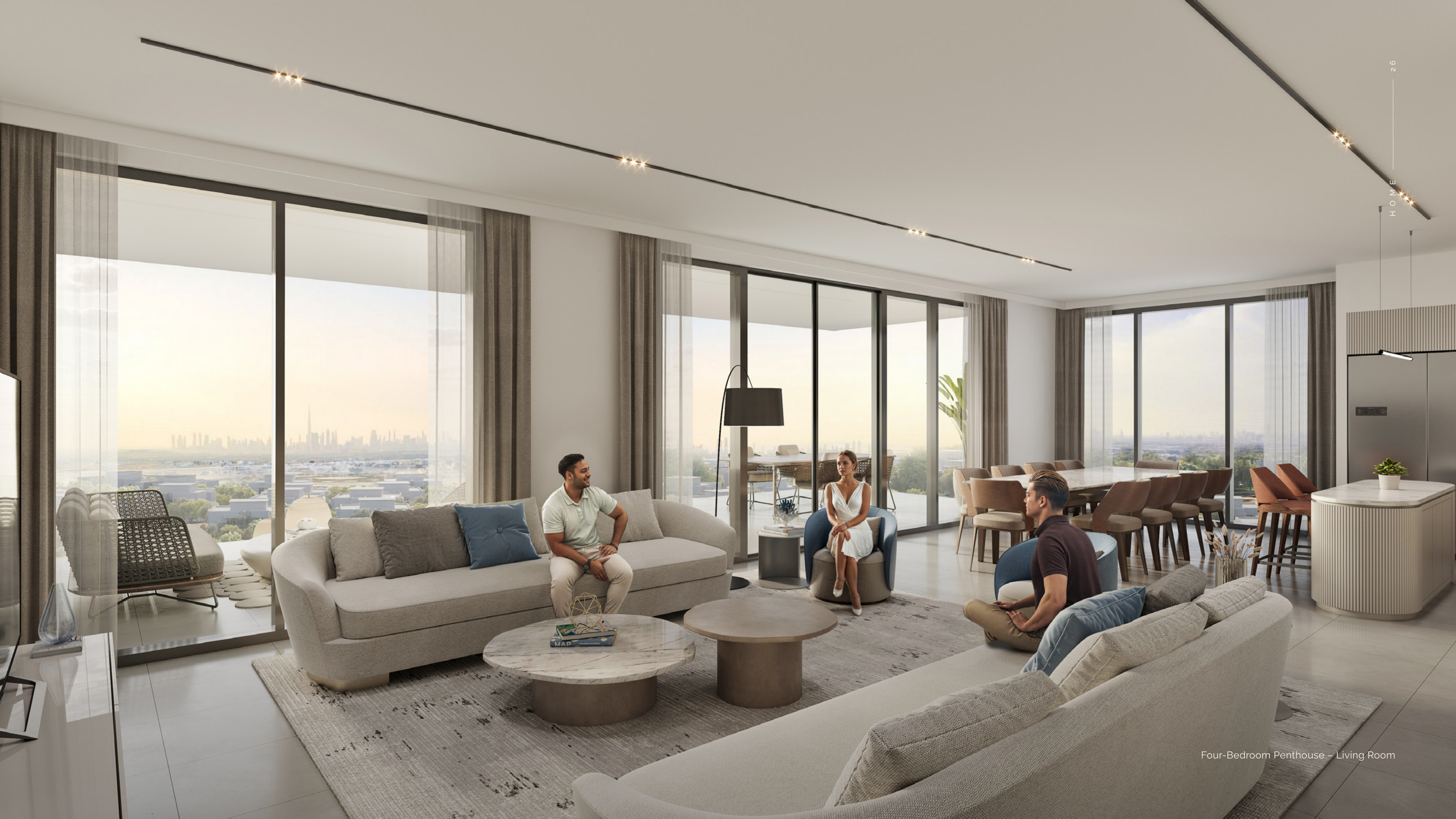
Four-Bedroom Penthouse – Living Room