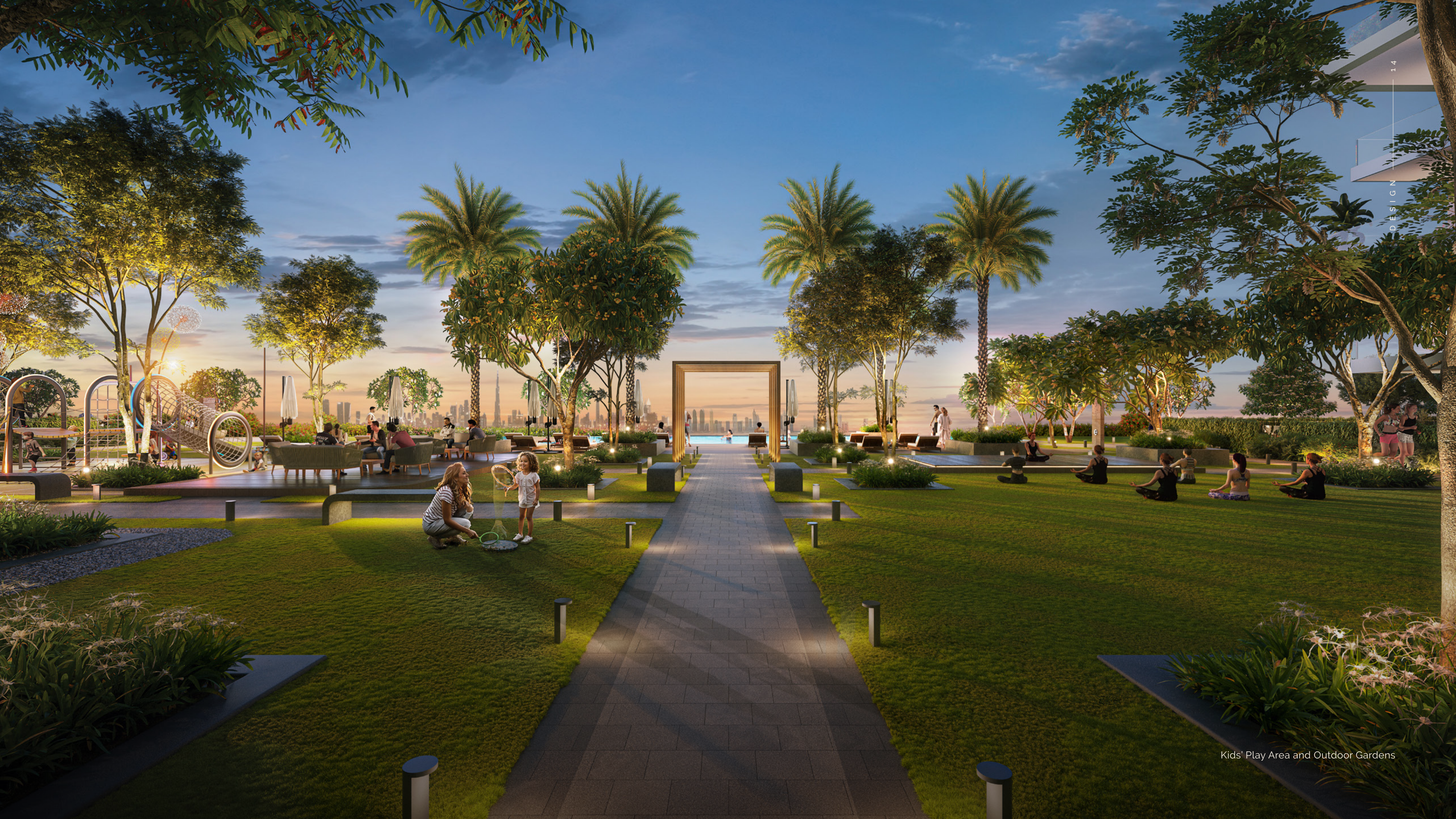
Kids' Play Area and Outdoor Gardens