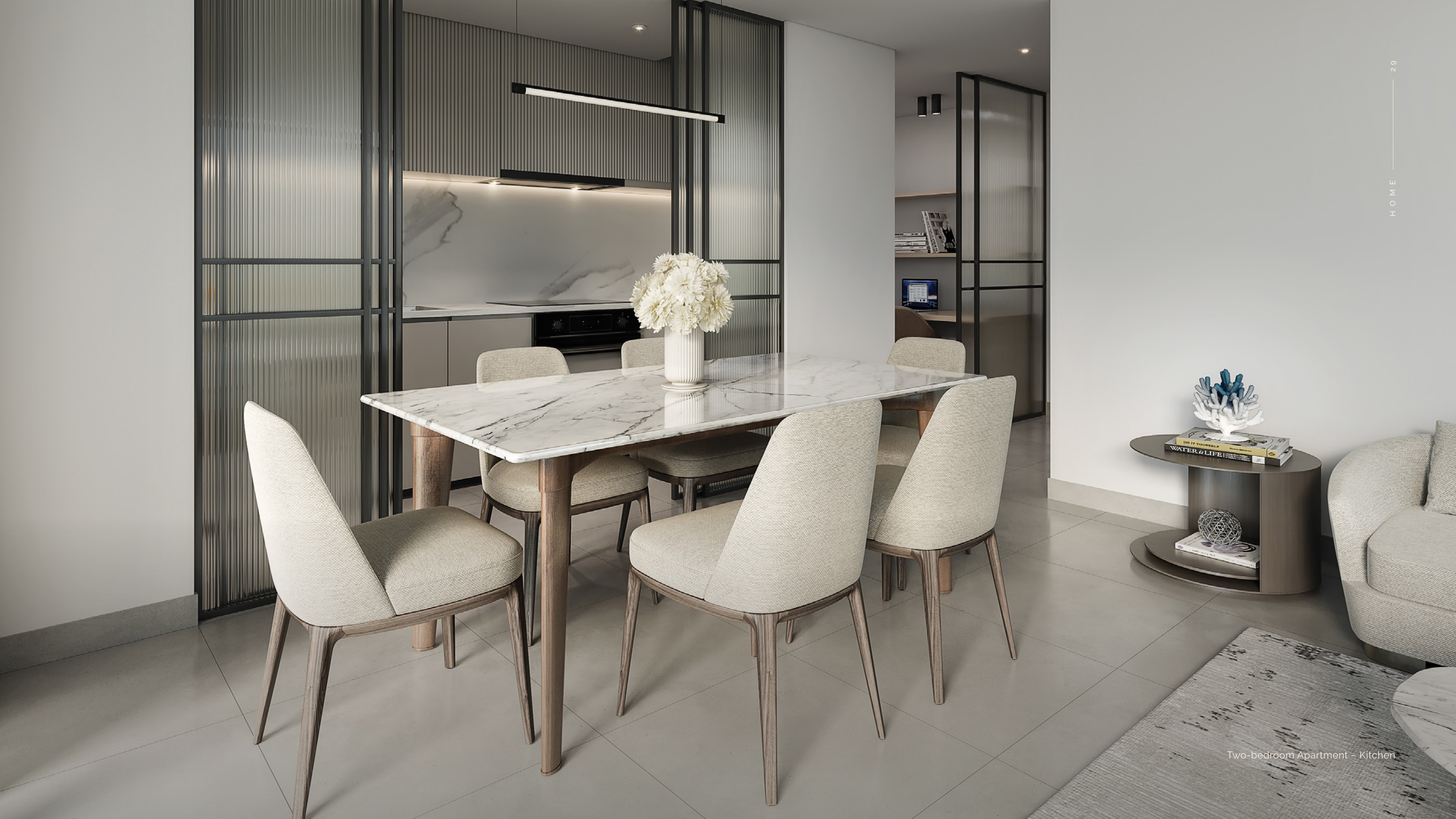
Two-bedroom Apartment - Kitchen