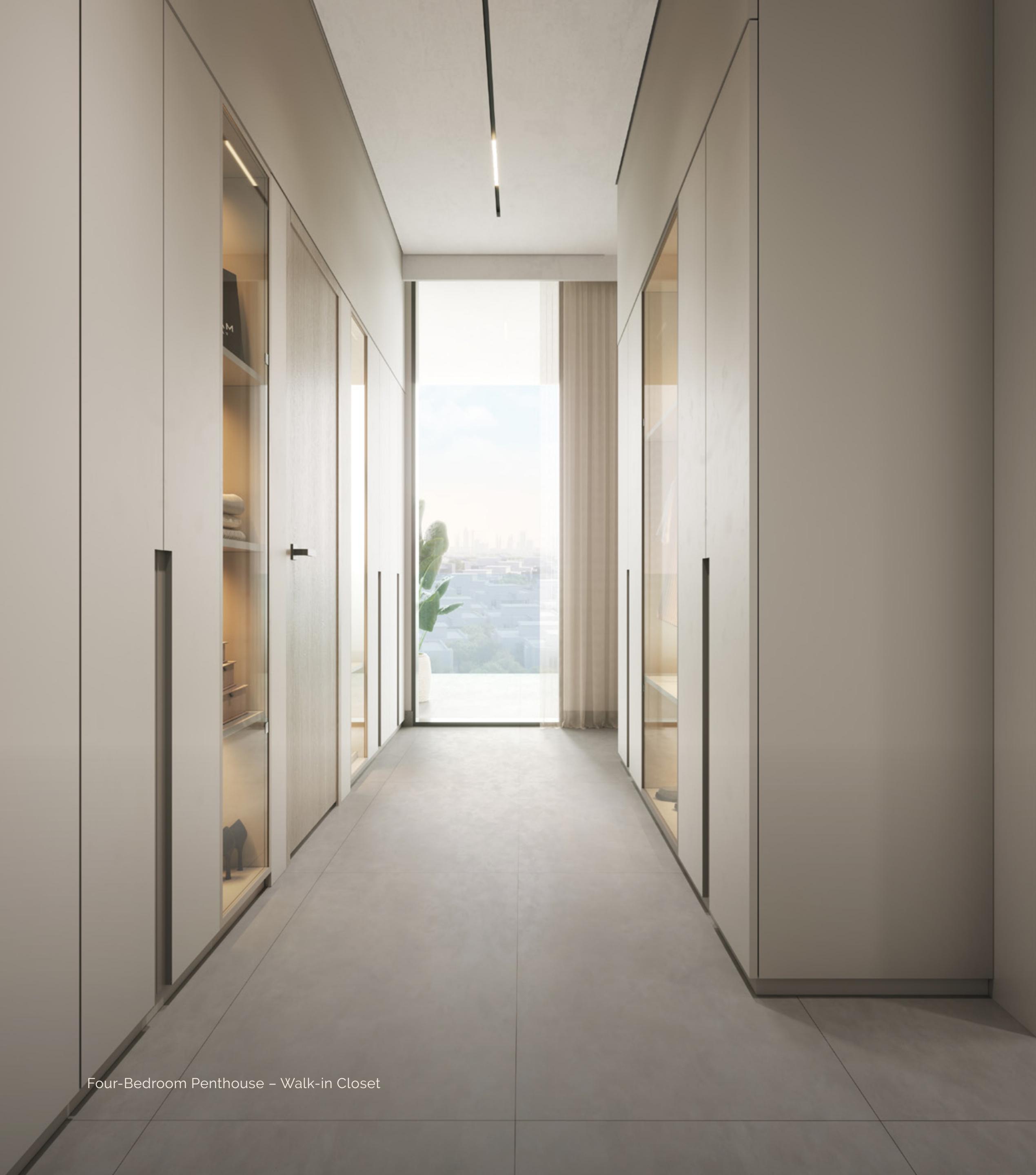
Four-Bedroom Penthouse – Walk-in Closet

STEP INTO A SPACE MADE FOR LIGHT. FLOOR TO CEILING, BRIGHT IN DESIGN.