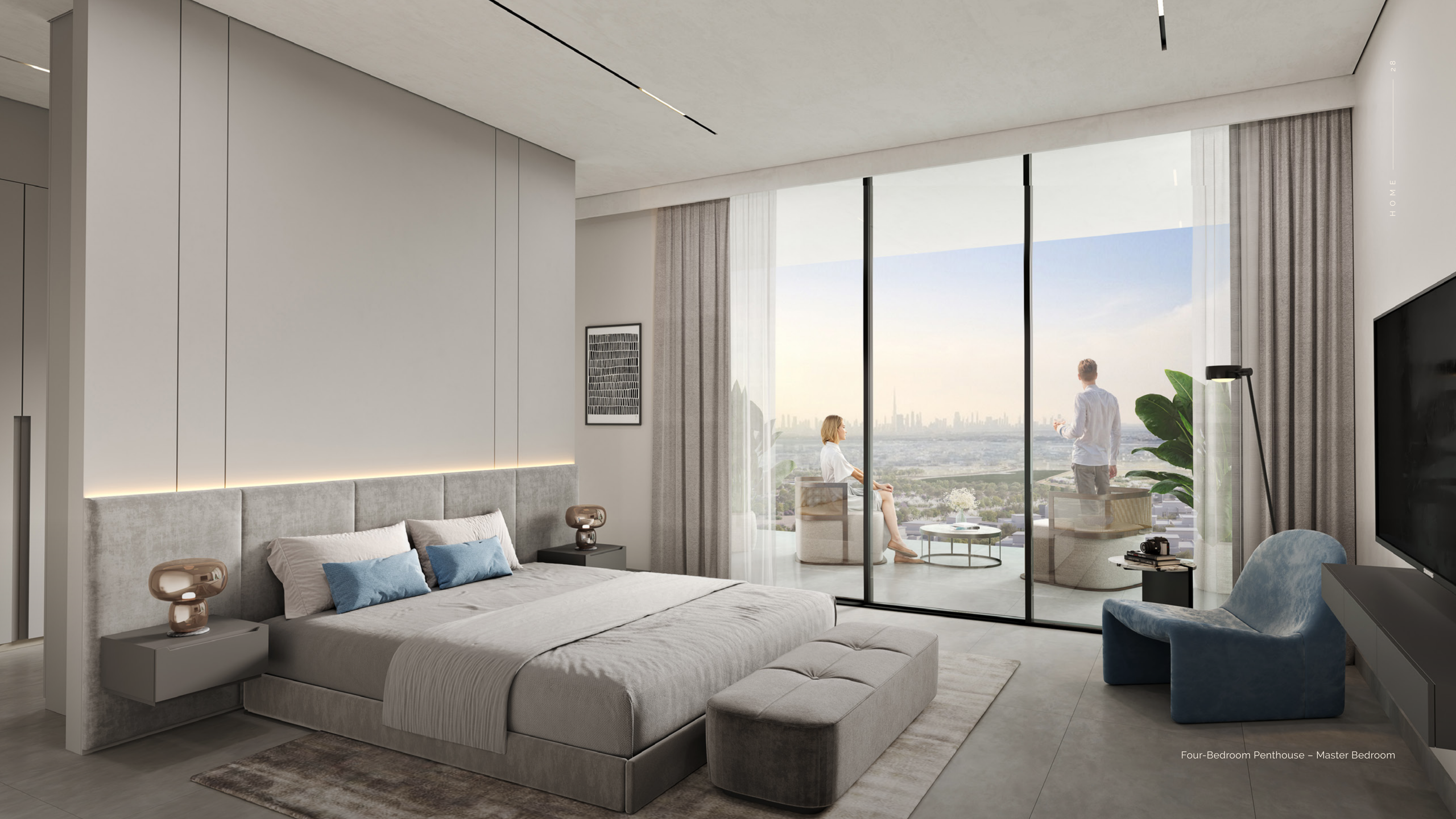
Four-Bedroom Penthouse – Master Bedroom