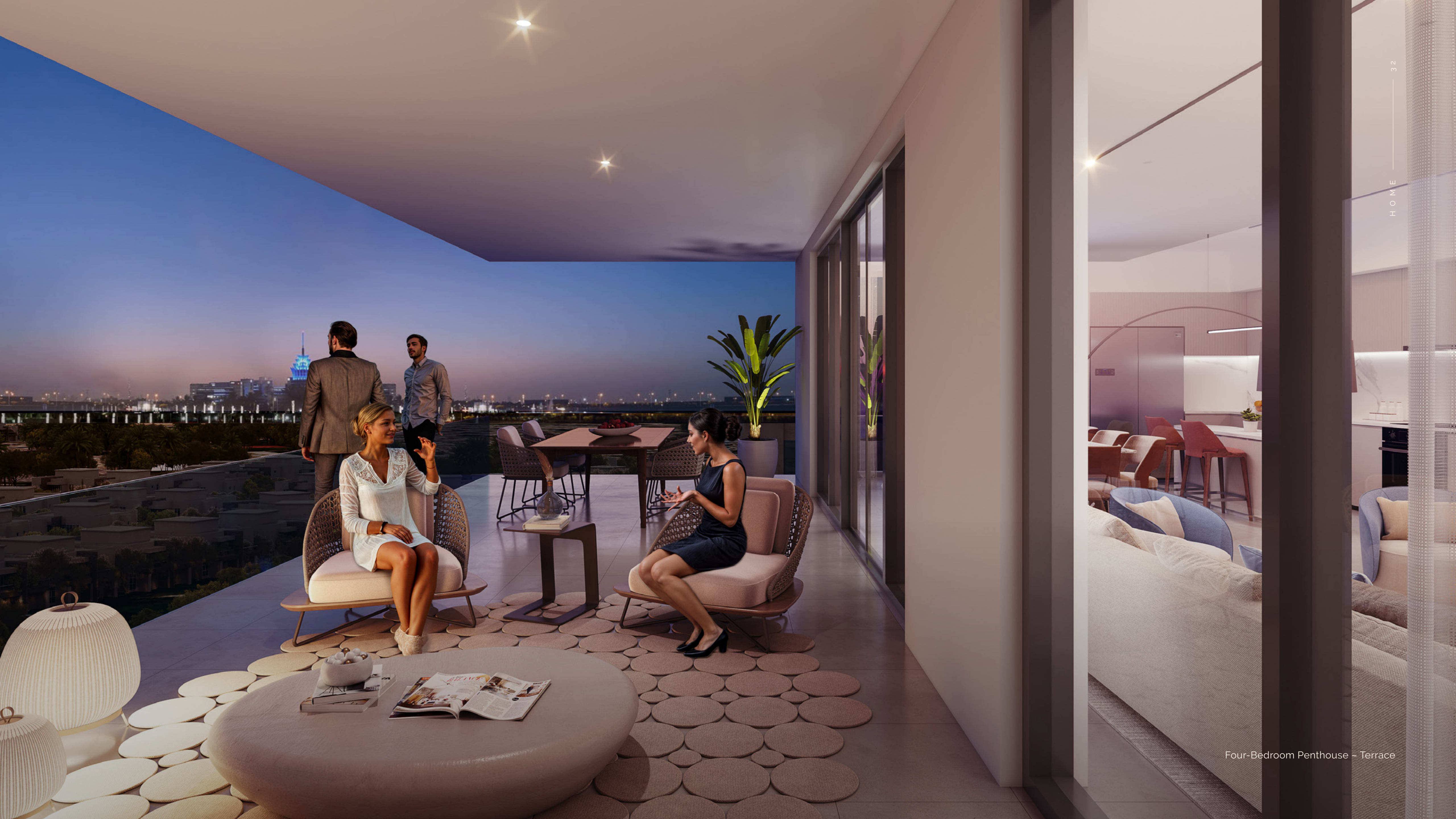
Four-Bedroom Penthouse – Terrace