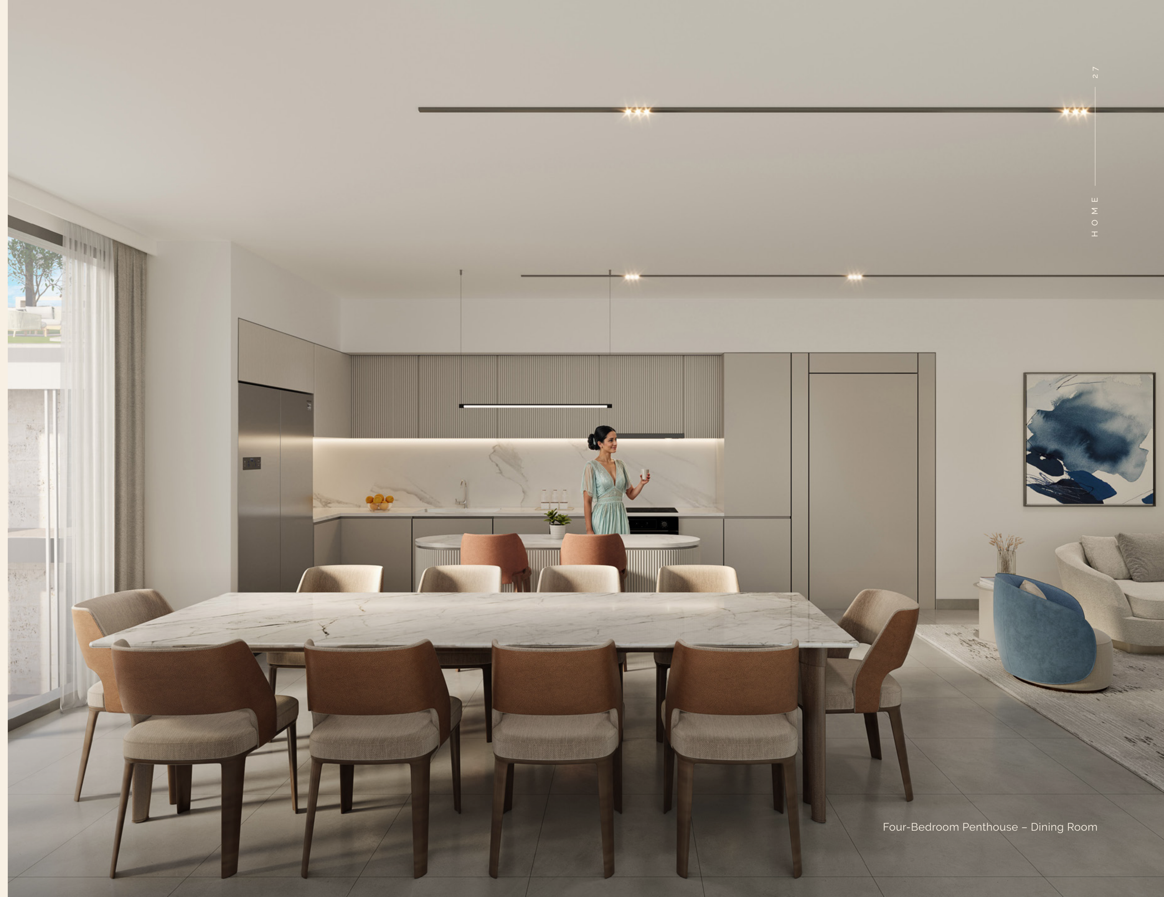
Four-Bedroom Penthouse – Dining Room

From junior suites (studios) to four-bedroom penthouses, every residence enjoys special views. Spacious balconies and generous terraces wrap themselves around you, inviting the outdoors in. Blending privacy with comfort. Living should be spacious, enlightening and beyond expectation.