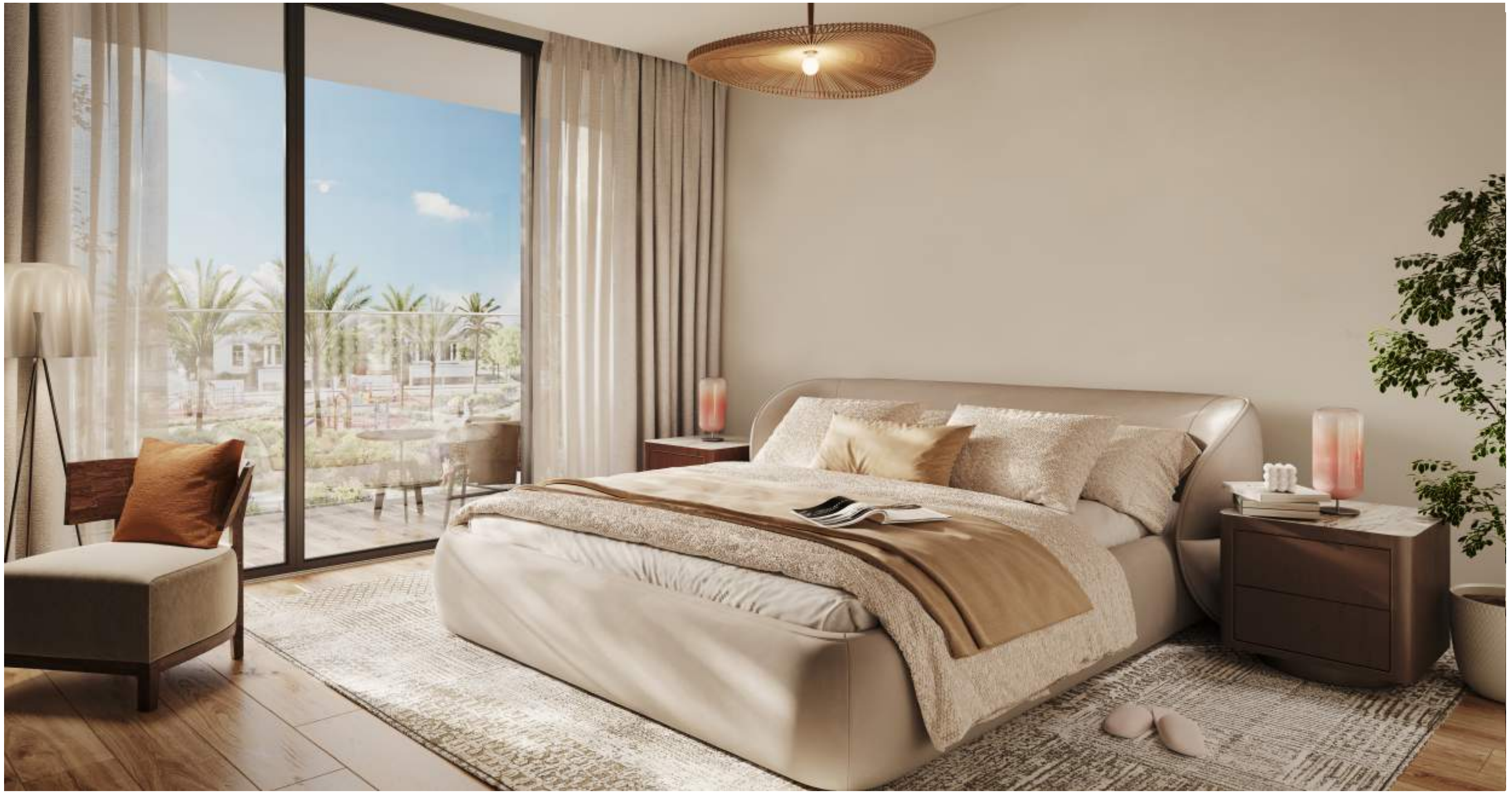
ARTIST RENDERING FOR ILLUSTRATIVE PURPOSES ONLY.