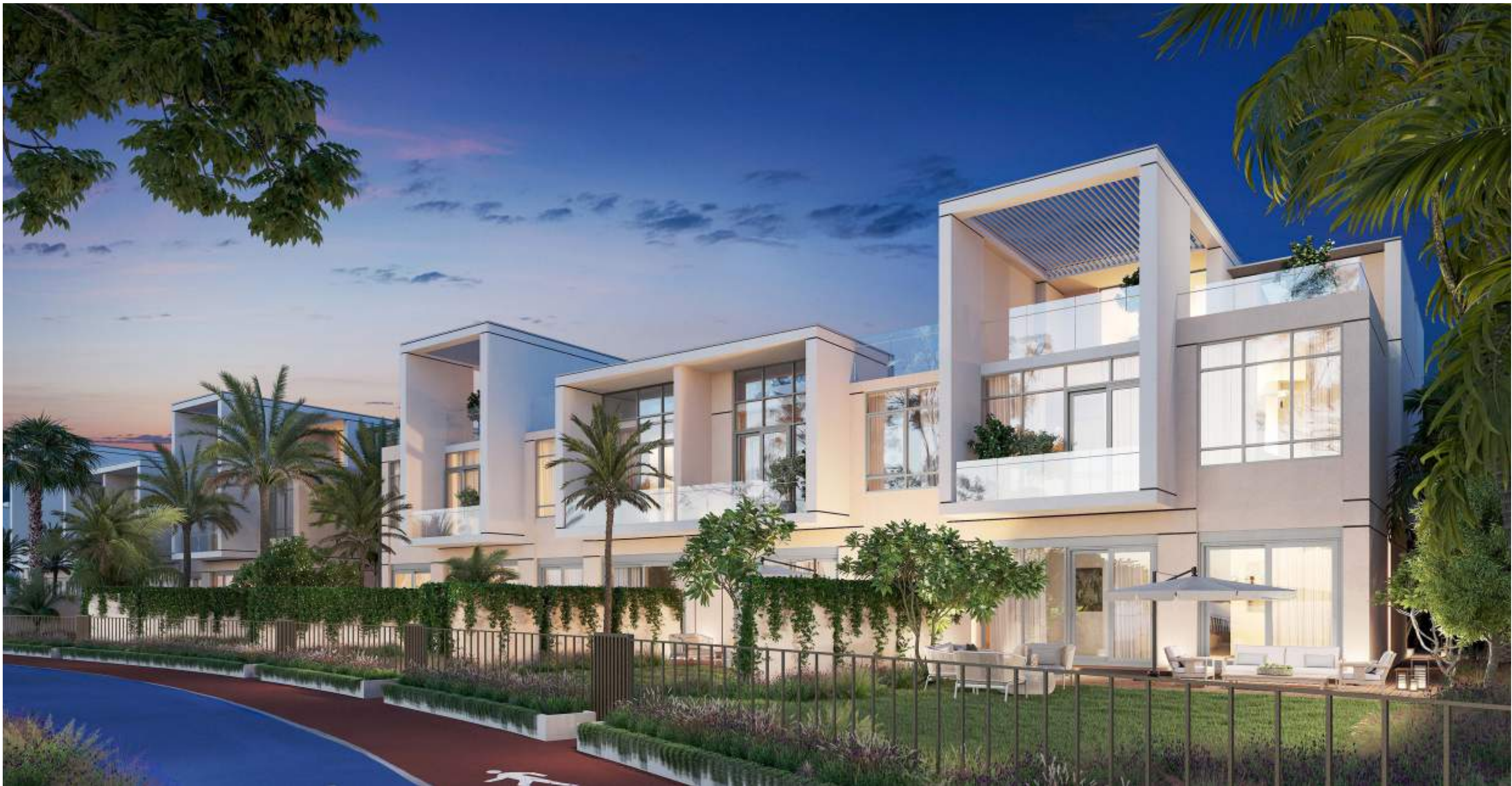
ARTIST RENDERING FOR ILLUSTRATIVE PURPOSES ONLY.