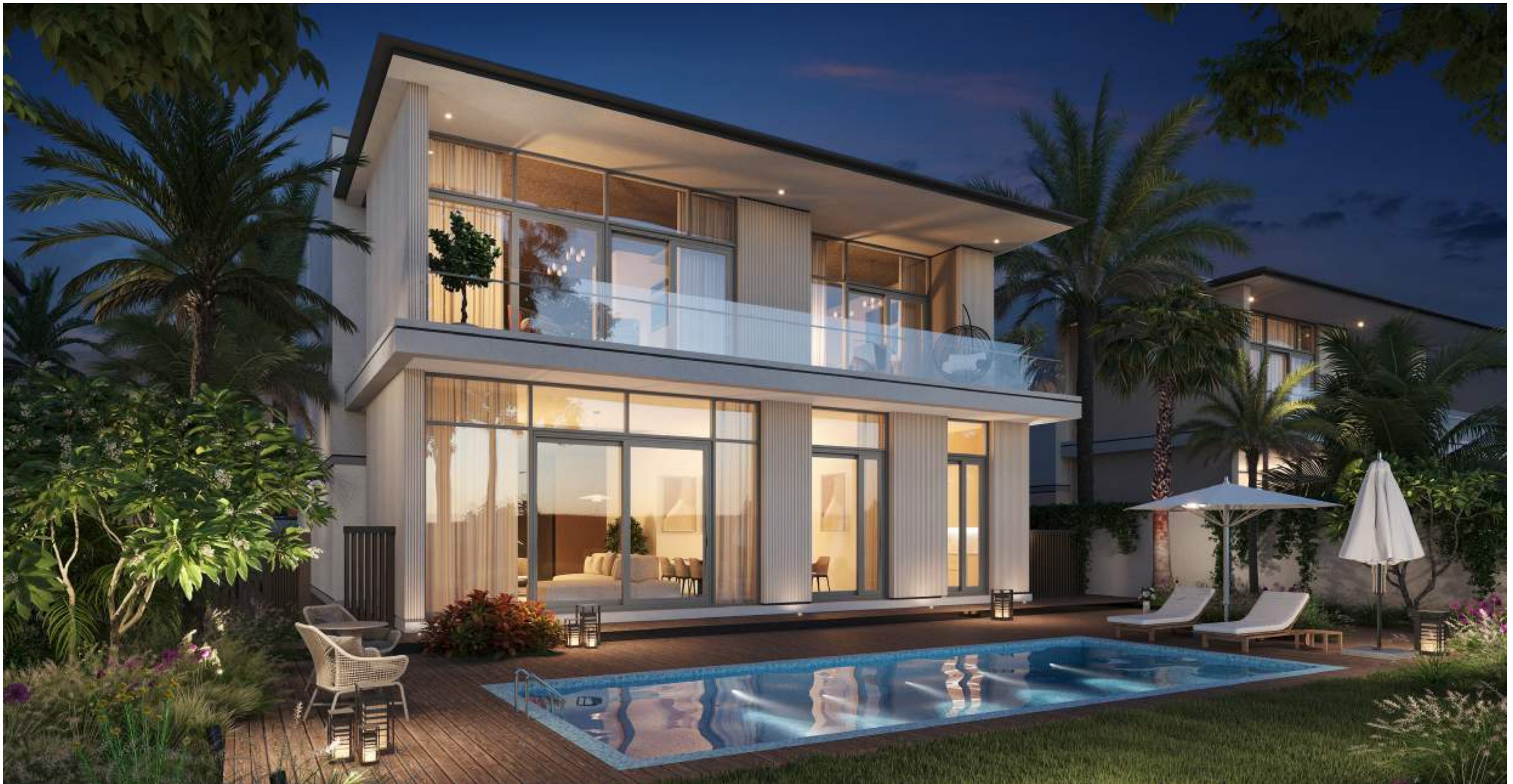
ARTIST RENDERING FOR ILLUSTRATIVE PURPOSES ONLY.