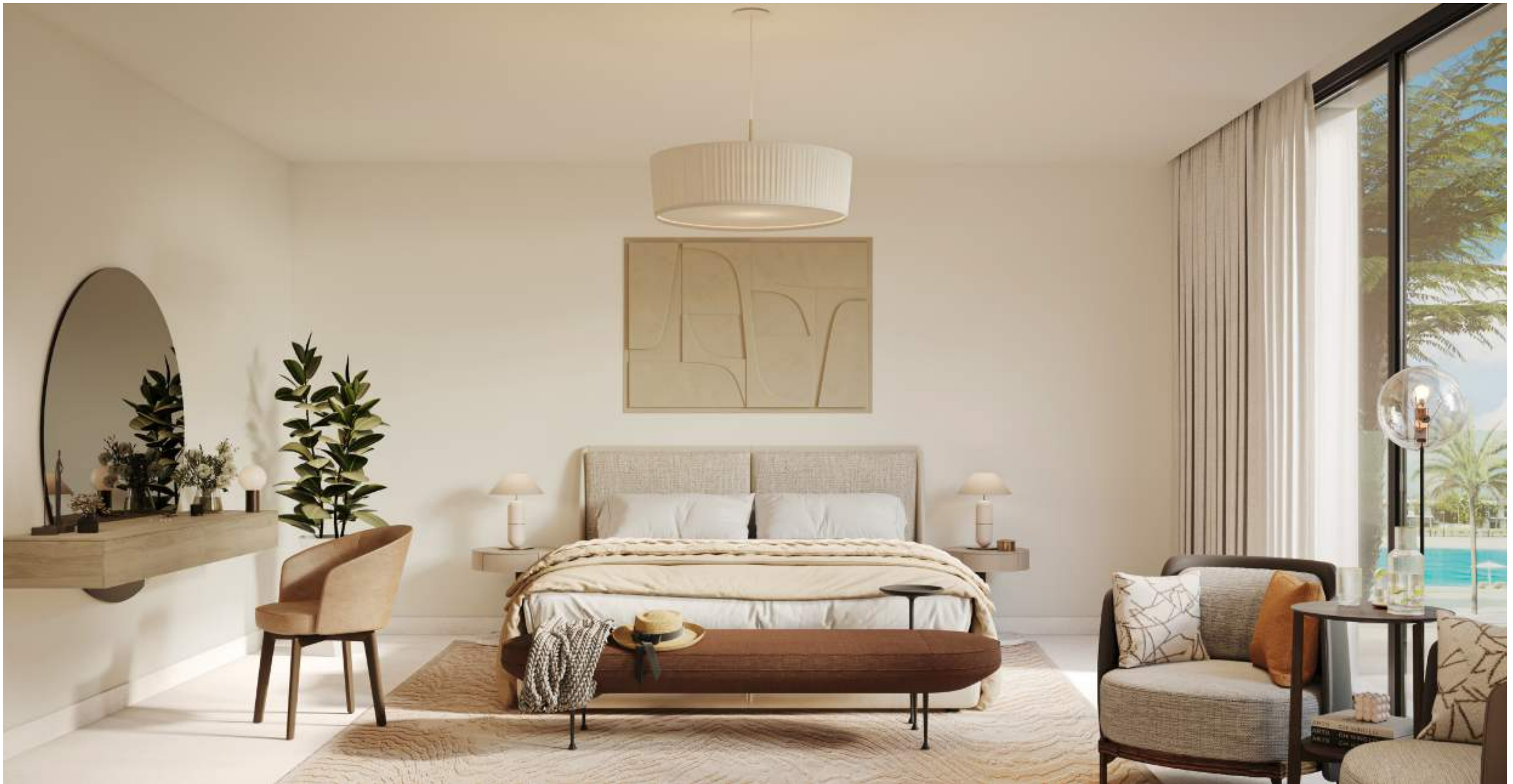
ARTIST RENDERING FOR ILLUSTRATIVE PURPOSES ONLY.