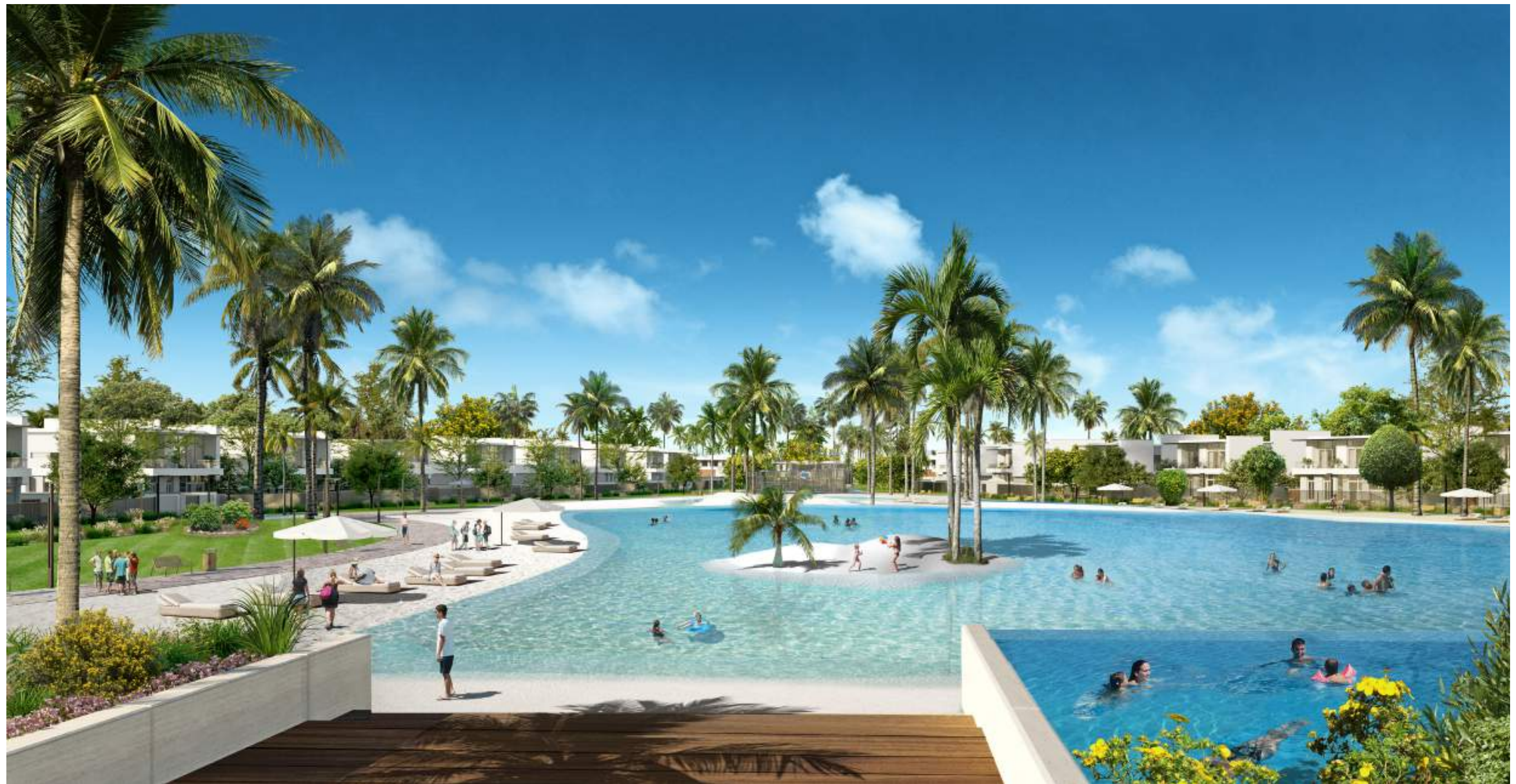
ARTIST RENDERING FOR ILLUSTRATIVE PURPOSES ONLY.