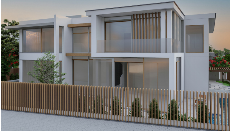
VILLA LOCATION WITHIN THE DEVELOPMENT