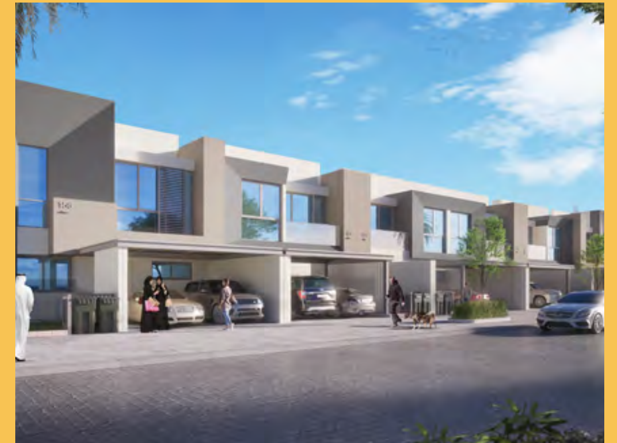
Gardenia Townhomes II