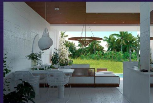
Green Flow Villa 21