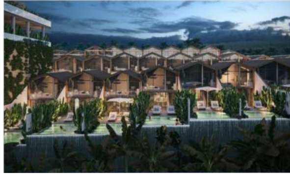
MELASTI DREAM RESIDENCE