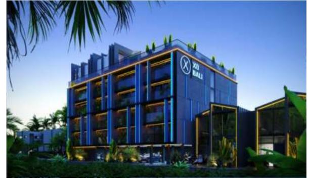
XO PROJECT CANGGU APARTMENTS