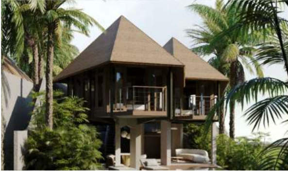
JUNGLE FLOWER VILLAS