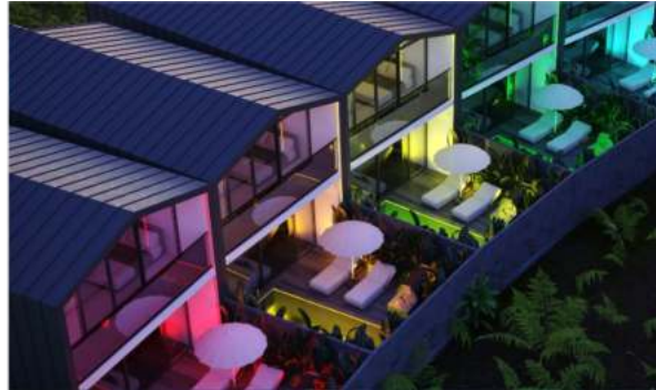
XO PROJECT CANGGU VILLAS