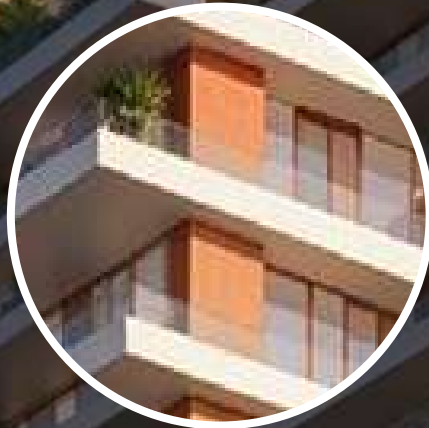
orange accent panels and natural elements