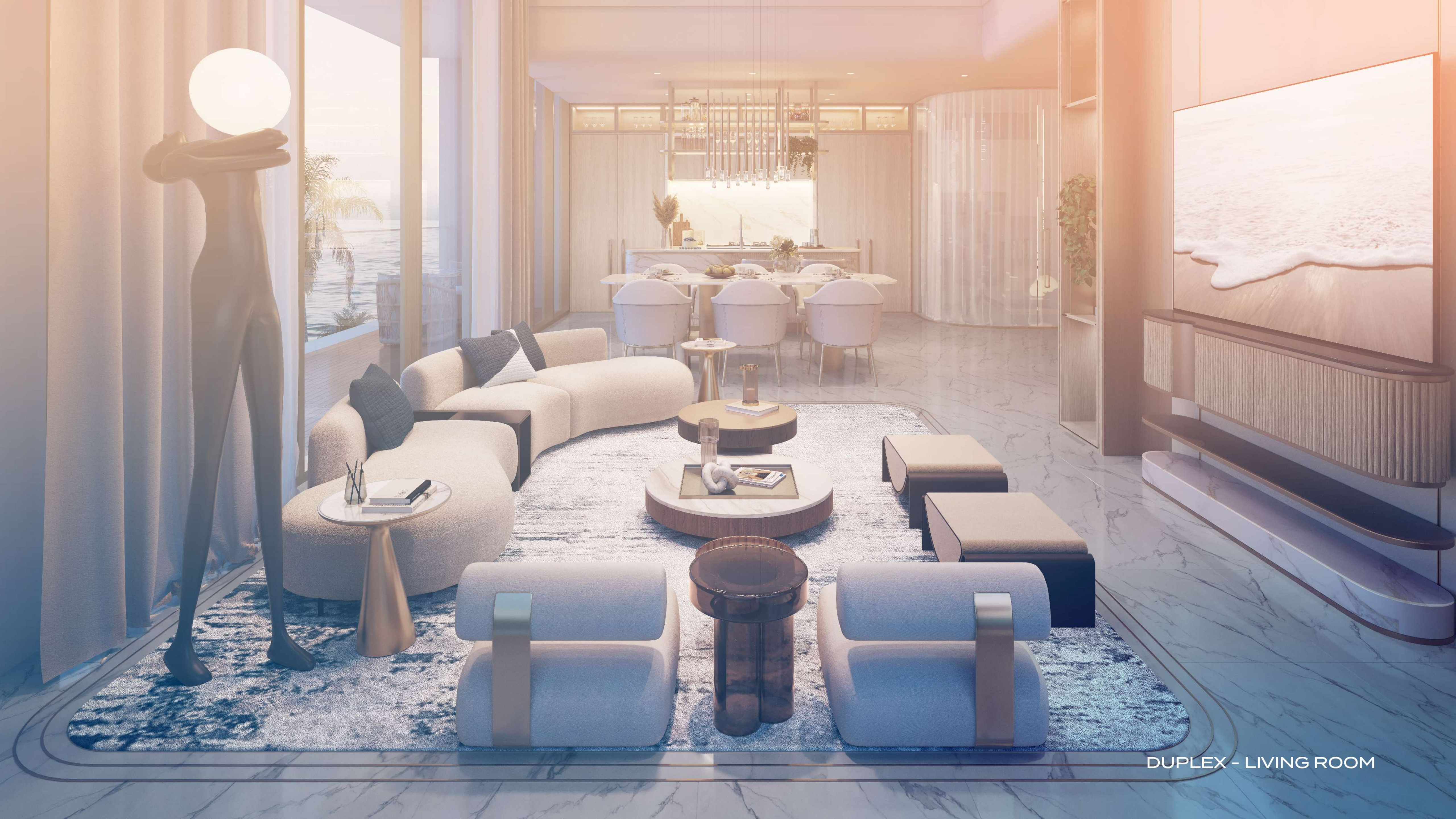
DUPLEX - LIVING ROOM