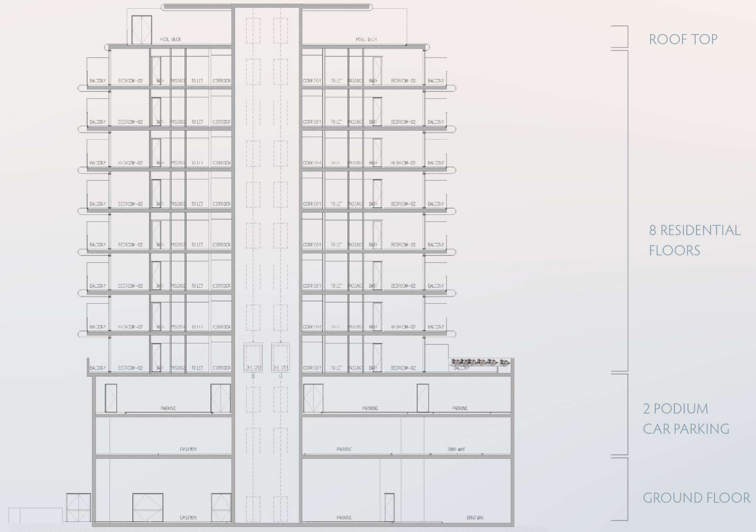
G + 2 PODIUM CAR PARKING + 8 RESIDENTIAL FLOORS + RF RESIDENTIAL