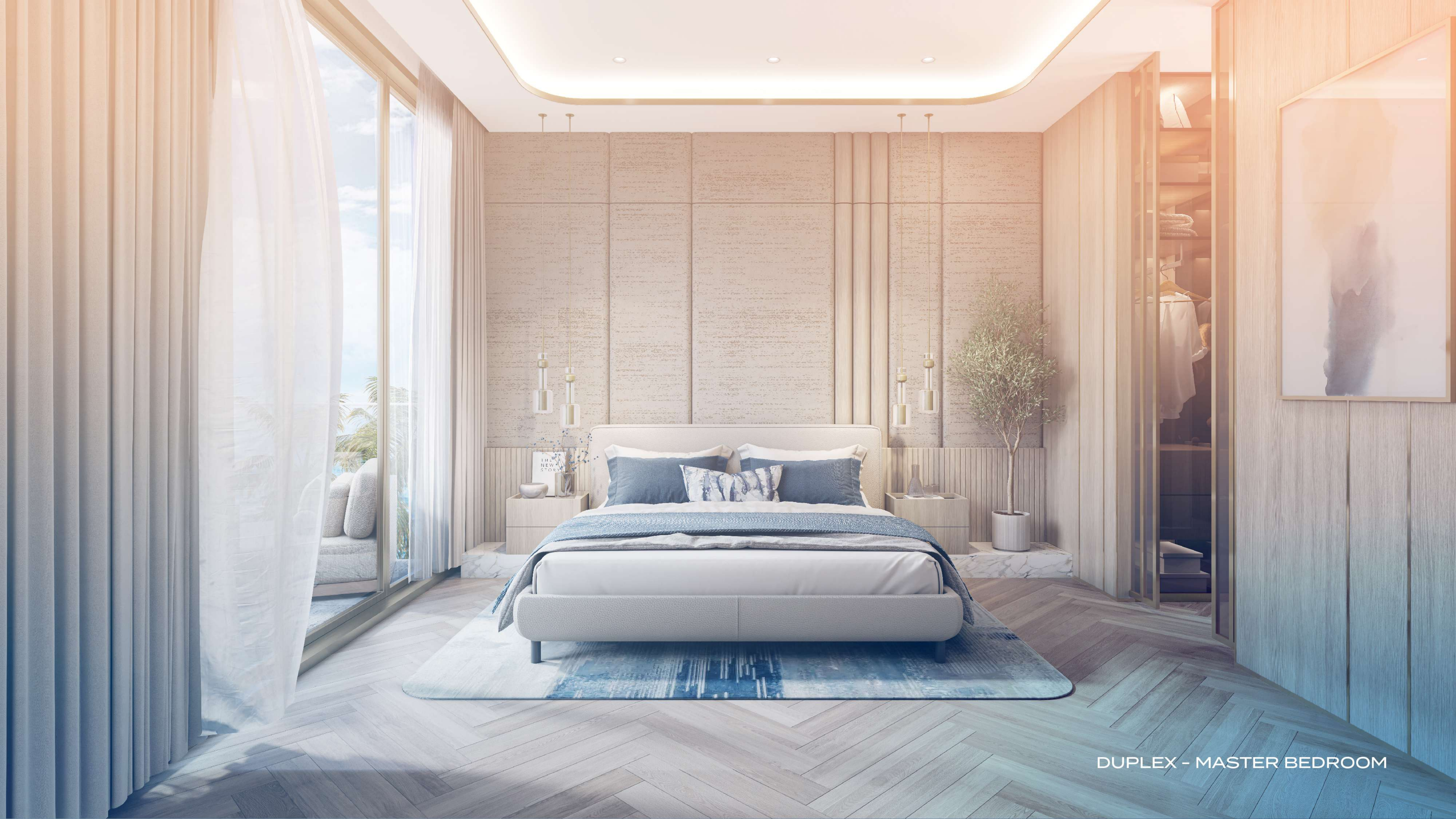
DUPLEX - MASTER BEDROOM