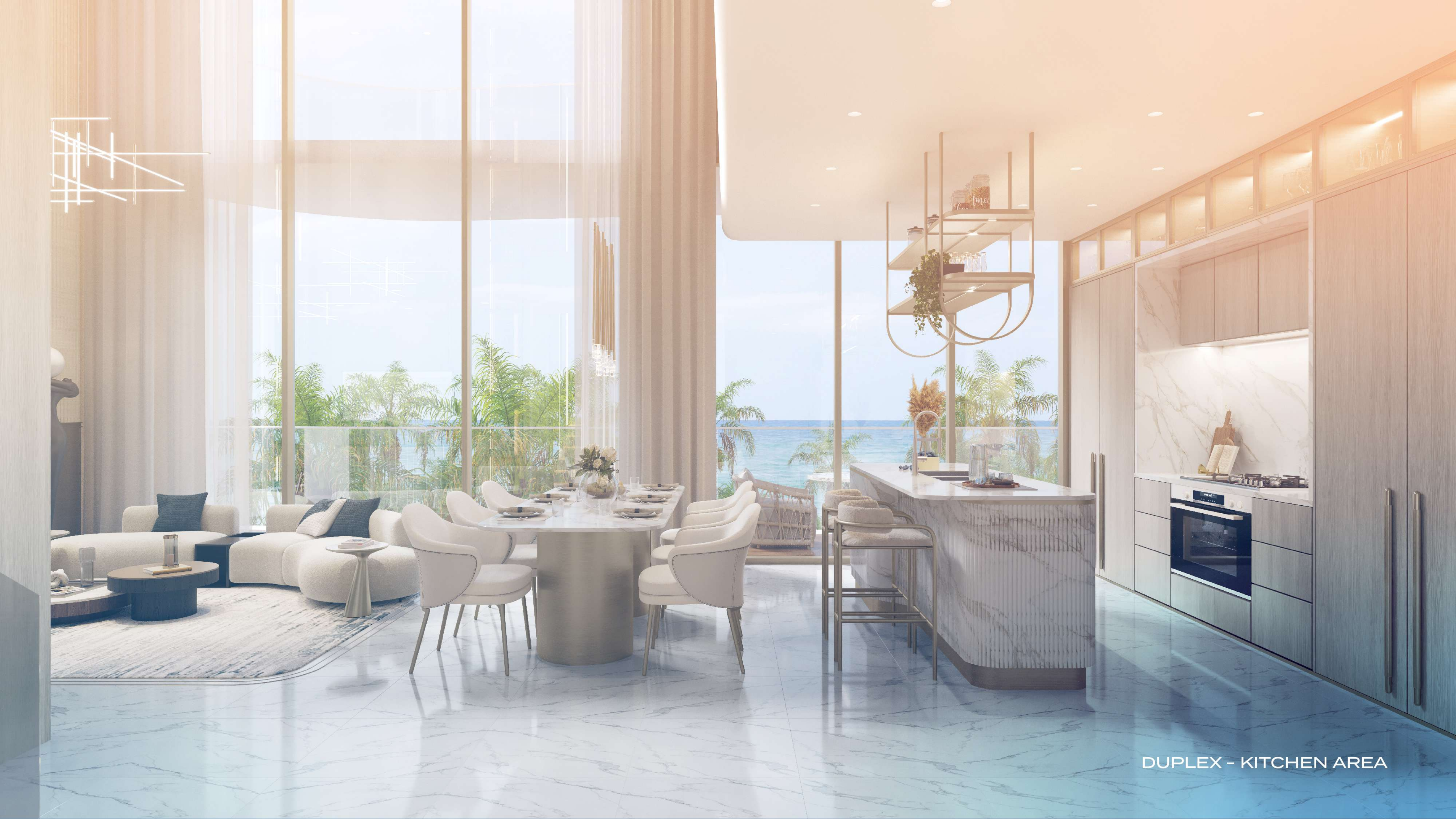
DUPLEX - KITCHEN AREA