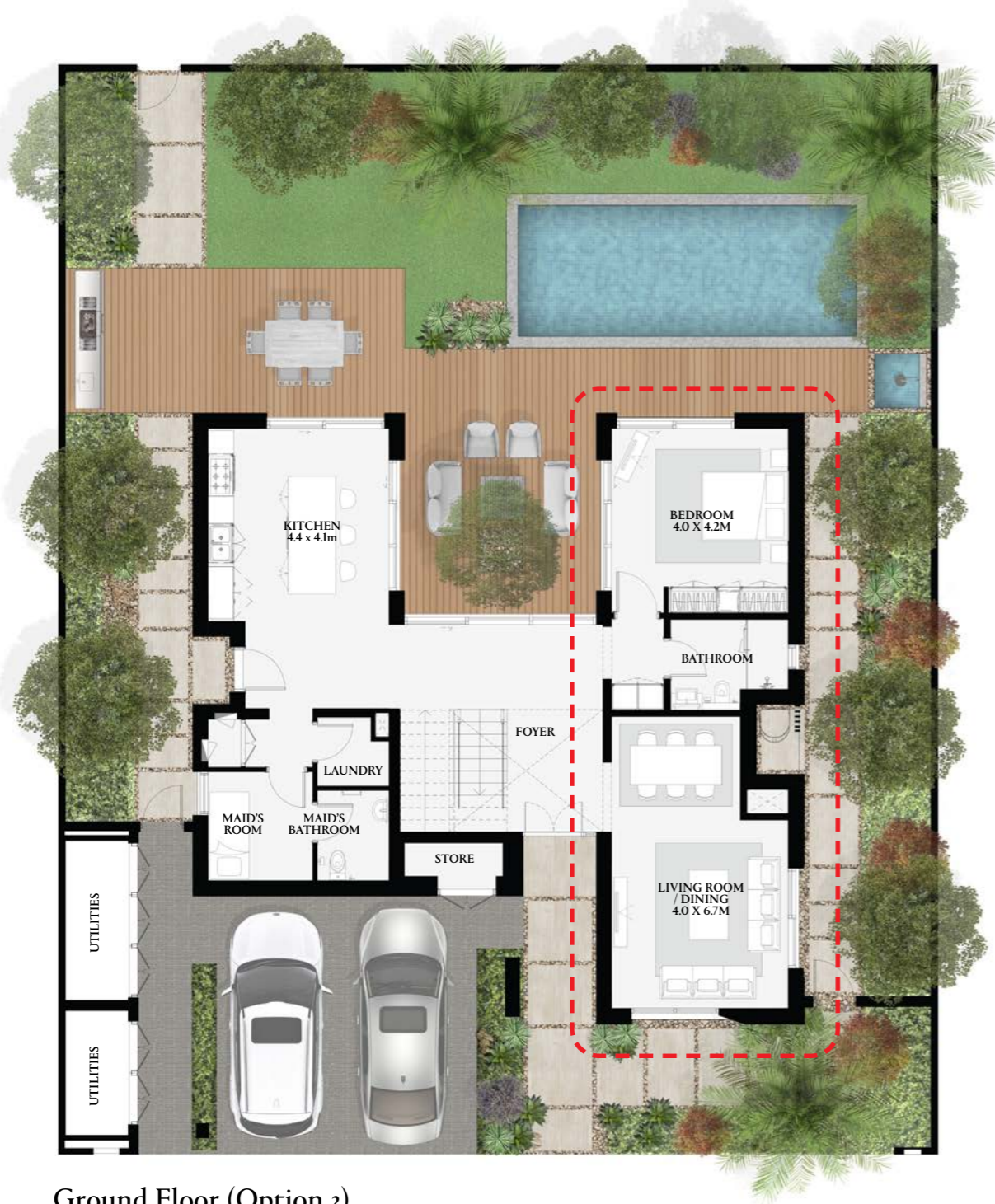
Ground Floor (Option 3)