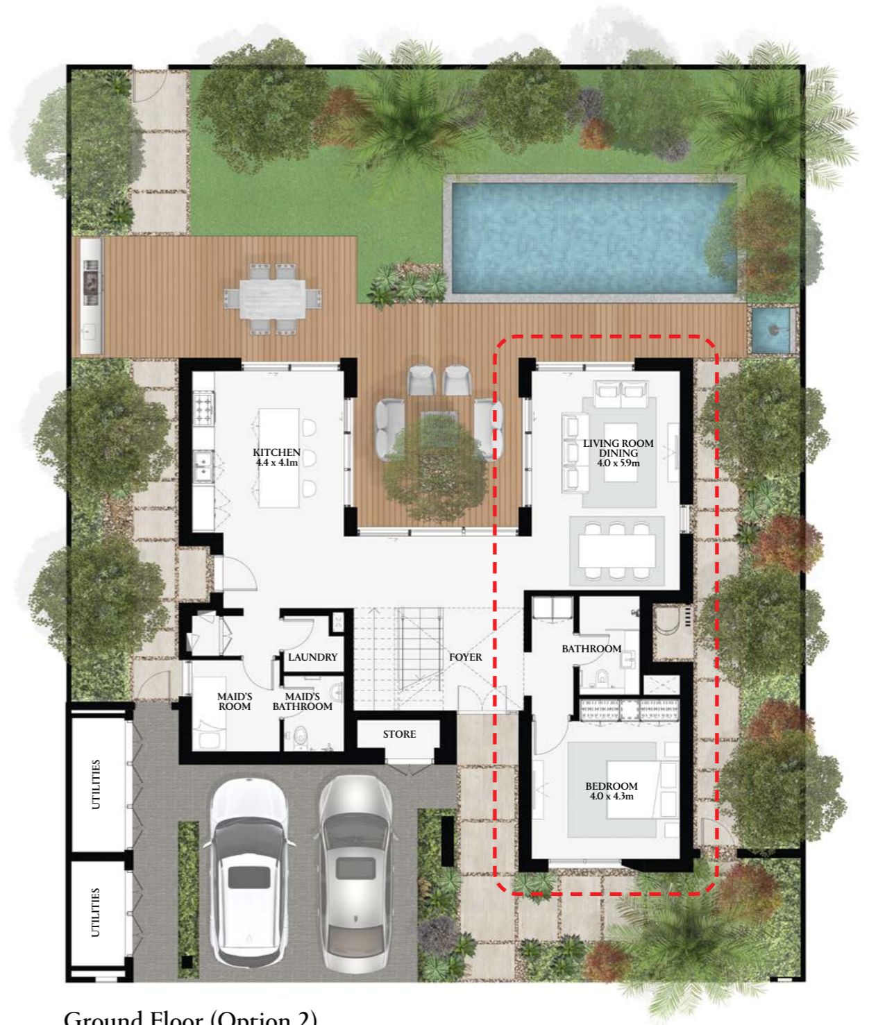
Ground Floor (Option 2)