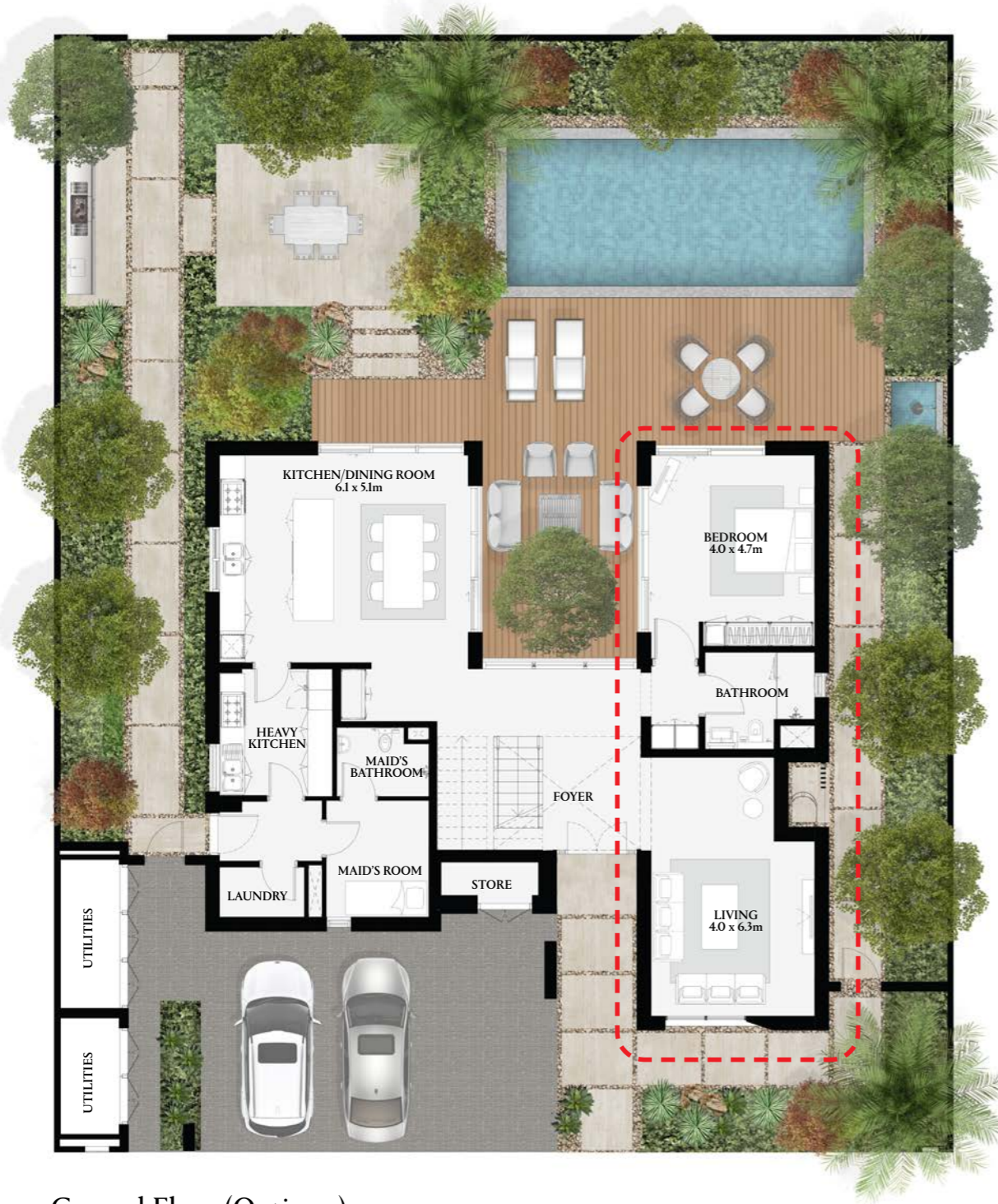
Ground Floor (Option 3)