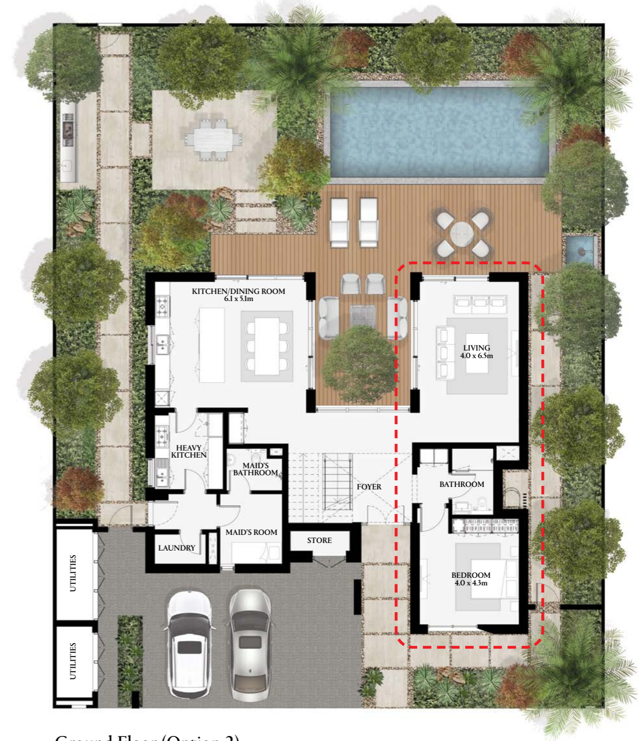
Ground Floor (Option 2)