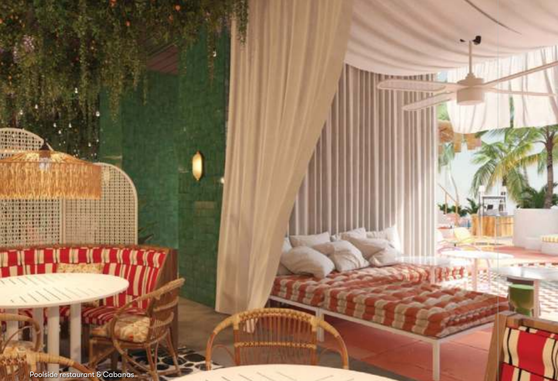
Poolside restaurant & Cabanas