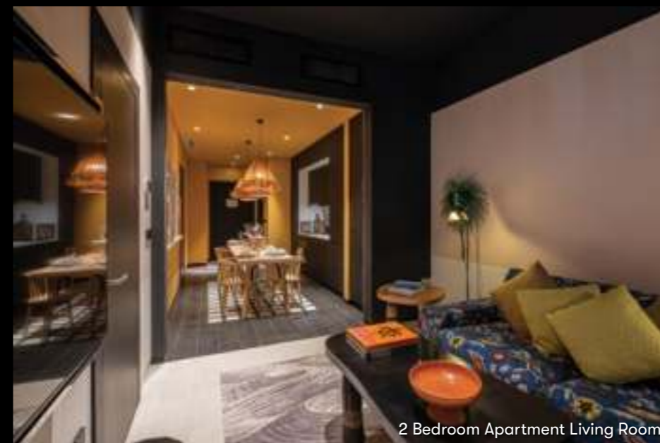
2 Bedroom Apartment Living Room

Mama Residences have been uniquely styled for the skyline around them. Every part of the building hosts art masterpieces that tell the city's story and create an urban haven where the global and the local fuse. Mosaic steps, colorful walls and eccentric hanging decorations brighten up every corner of Mama. You'll never be short on inspiration, and your home base will never be far from the lips of every mover and shaker in town.