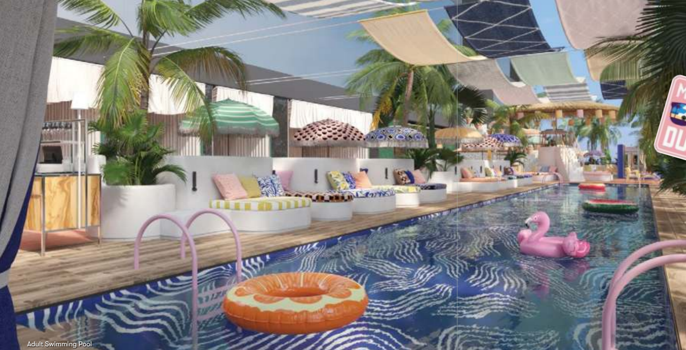
Adult Swimming Pool