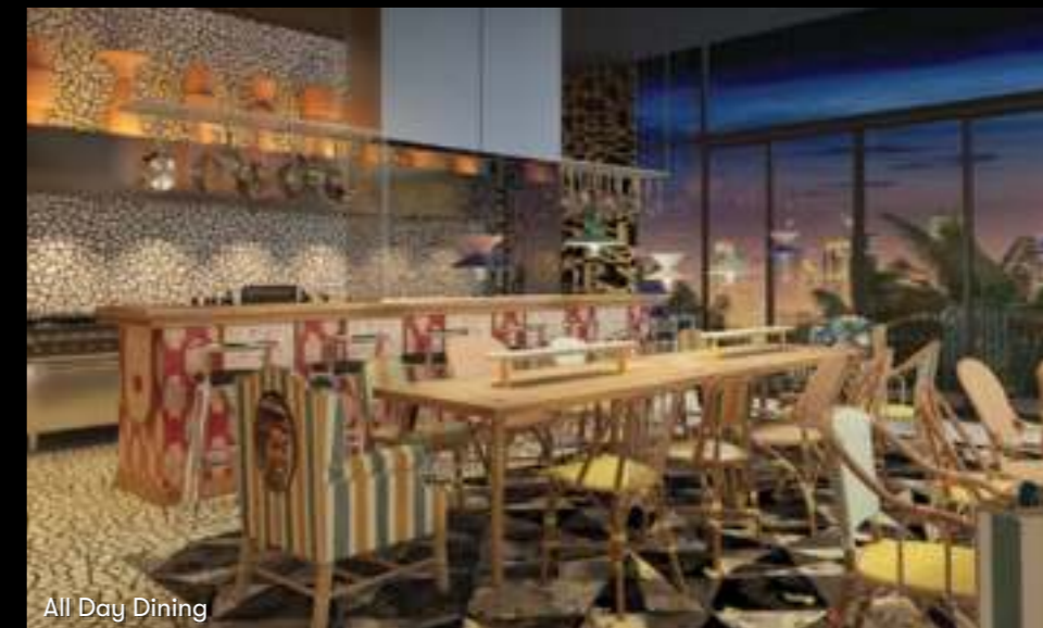
All Day Dining