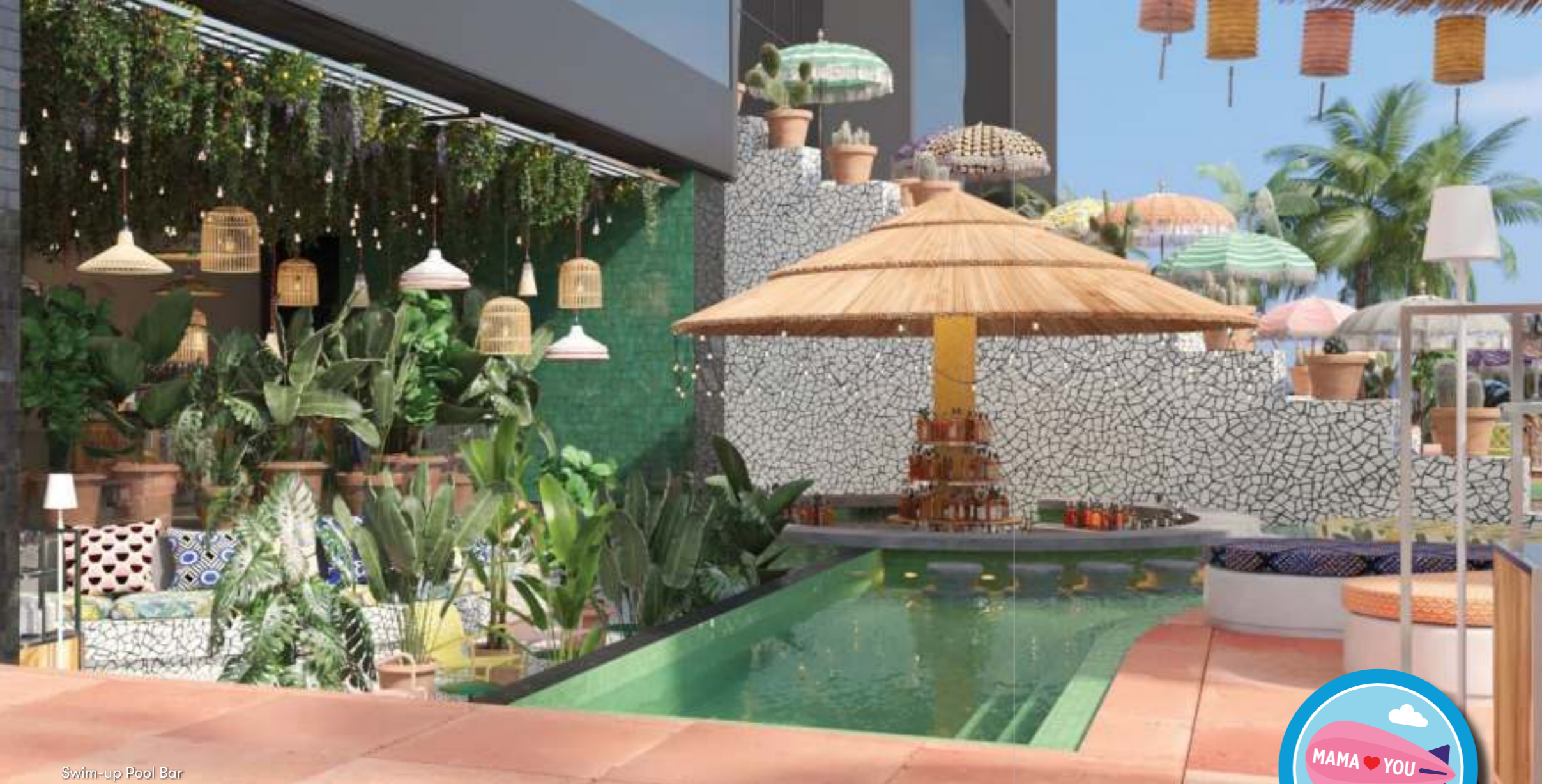
Swim-up Pool Bar