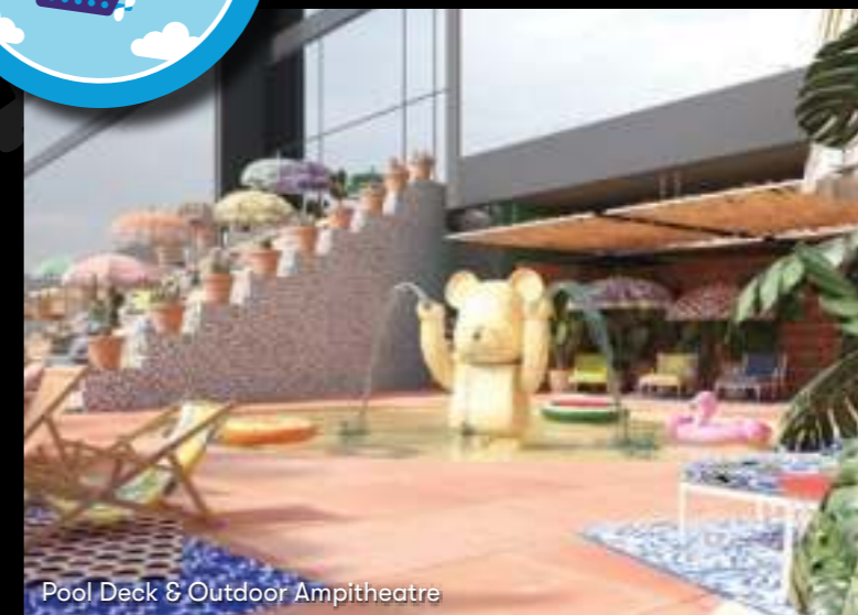
Pool Deck & Outdoor Ampitheatre