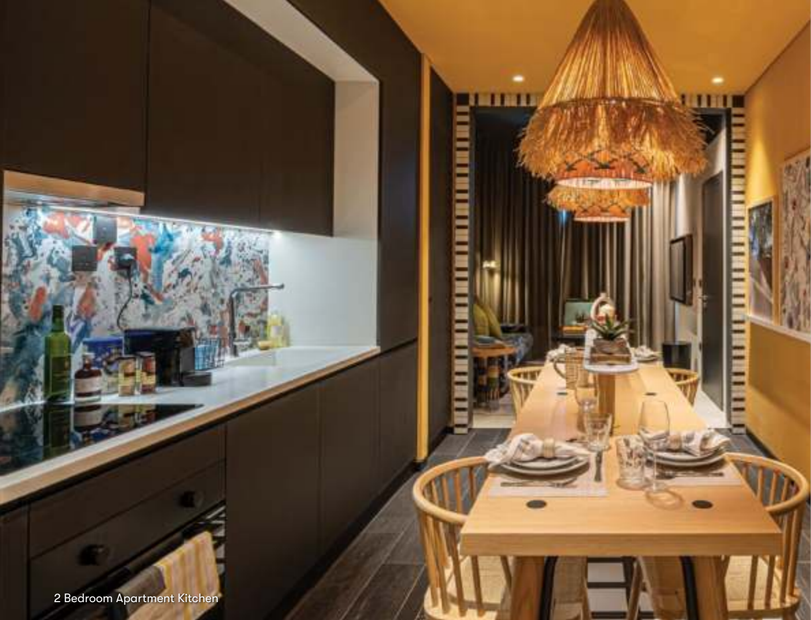
2 Bedroom Apartment Kitchen