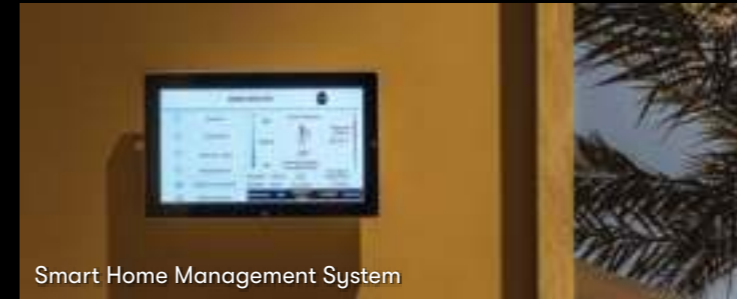
Smart Home Management System