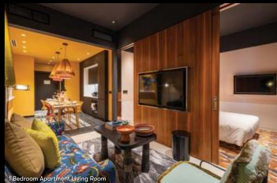
1 Bedroom Apartment Living Room

With exceptional hotel amenities and hospitality services provided by the global lifestyle hotel leader Ennismore to complete the picture, this fusion of world-class, leading hospitality and the ultimate in-home design makes this an unmatched choice in Dubai. Step inside and start living. With personalized free WiFi, a virtual concierge, a top-notch in-room entertainment system with TV and free movies on demand in every apartment... Nothing is too much to imagine for Mama!