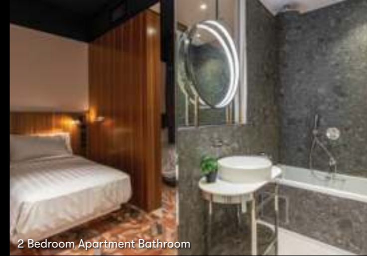
2 Bedroom Apartment Bathroom