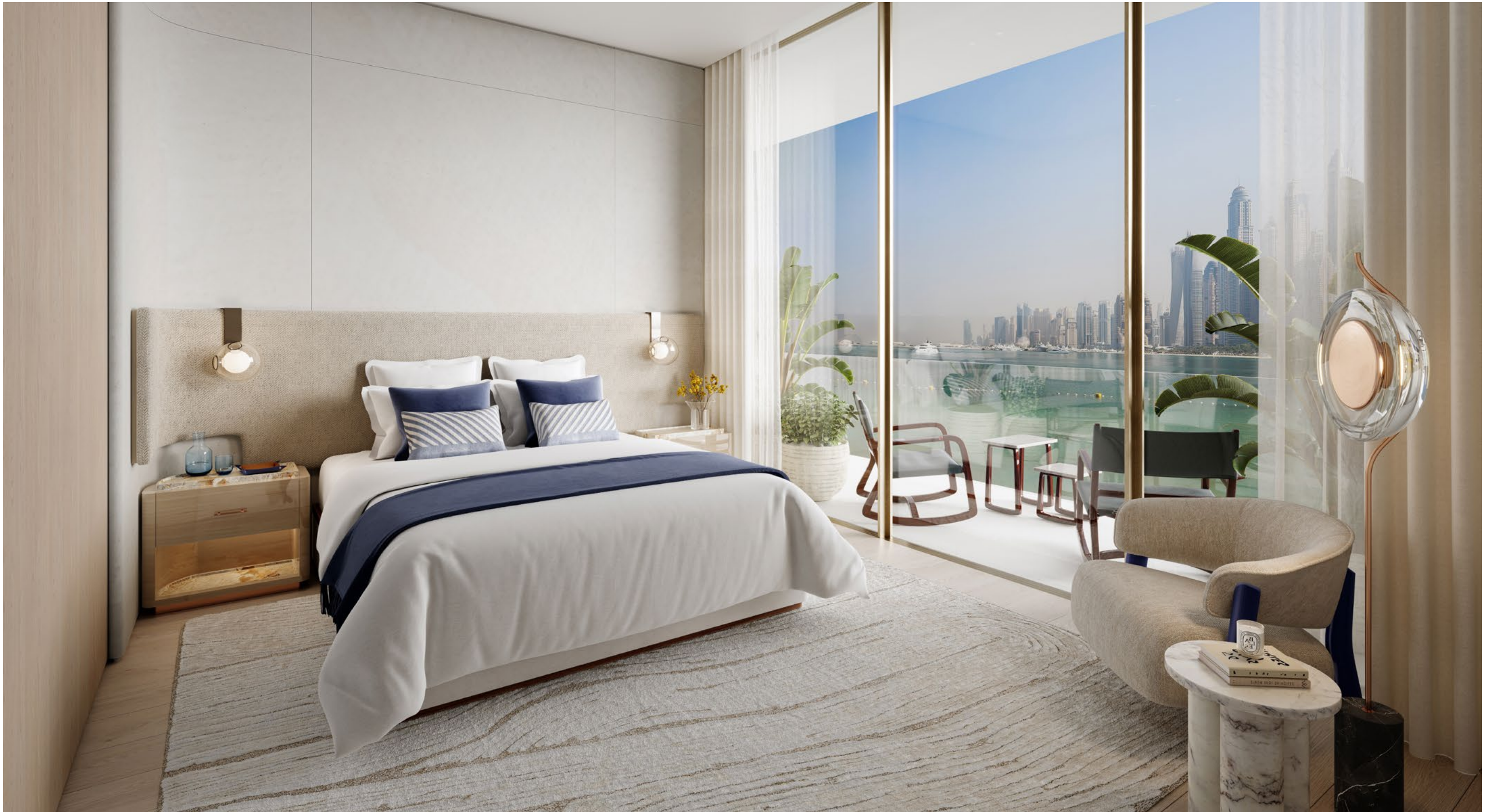
Panoramic bedroom views of the sands, sea, and city