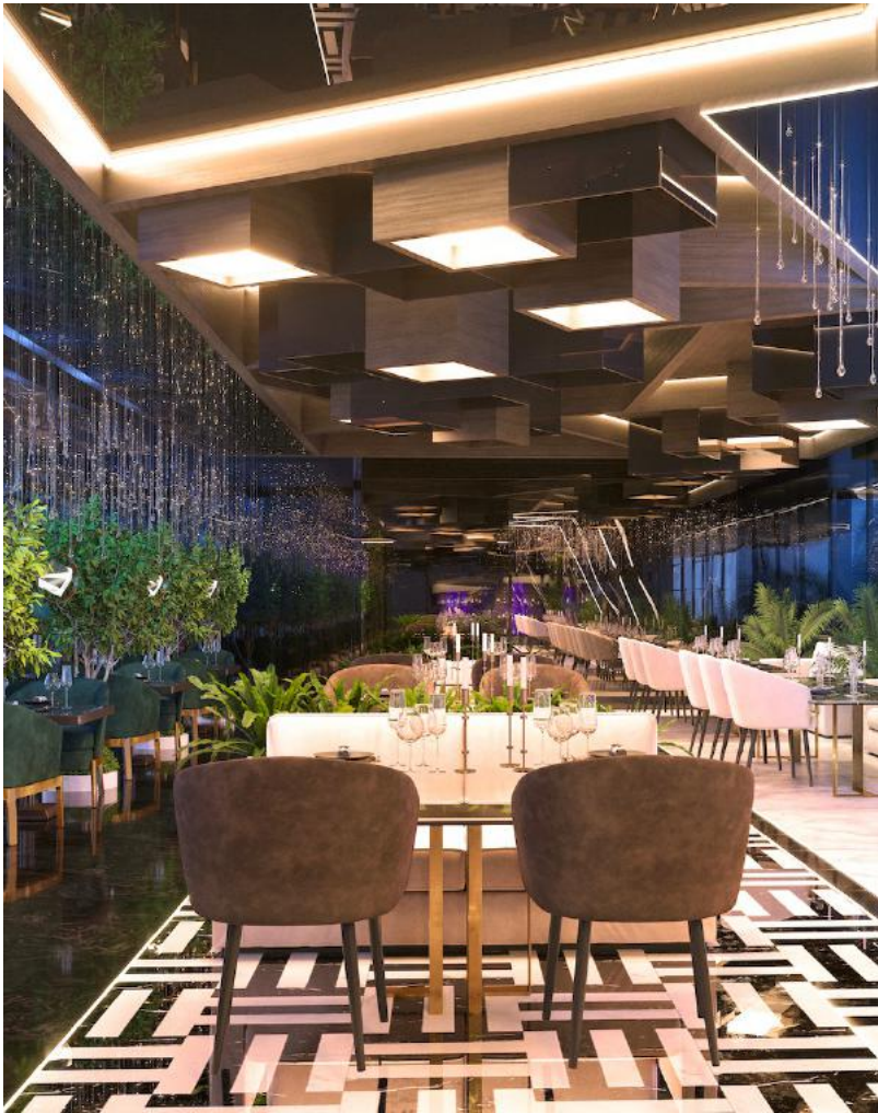
Restaurant on the 4th floor