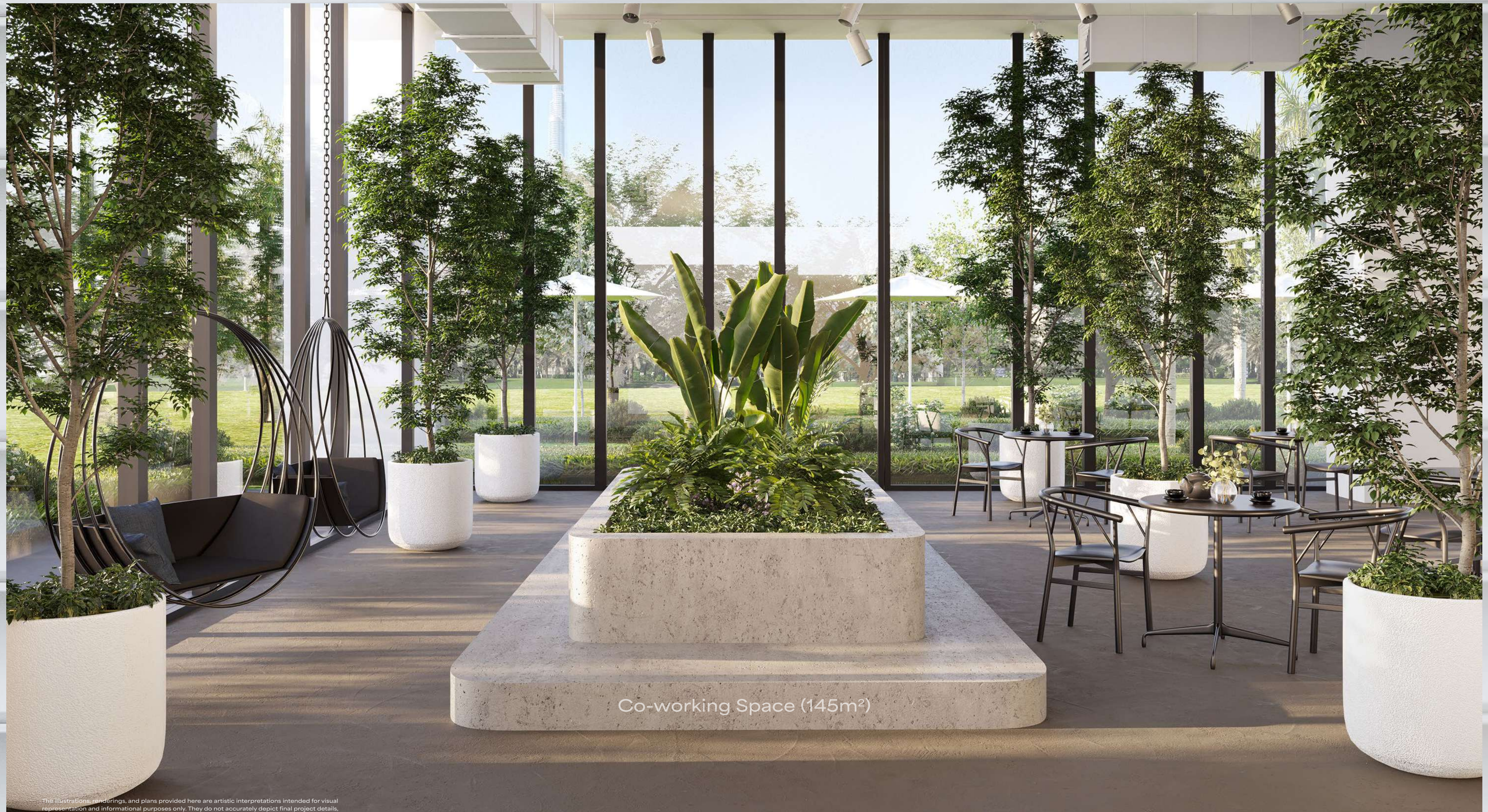
Co-working Space (145m 2 )