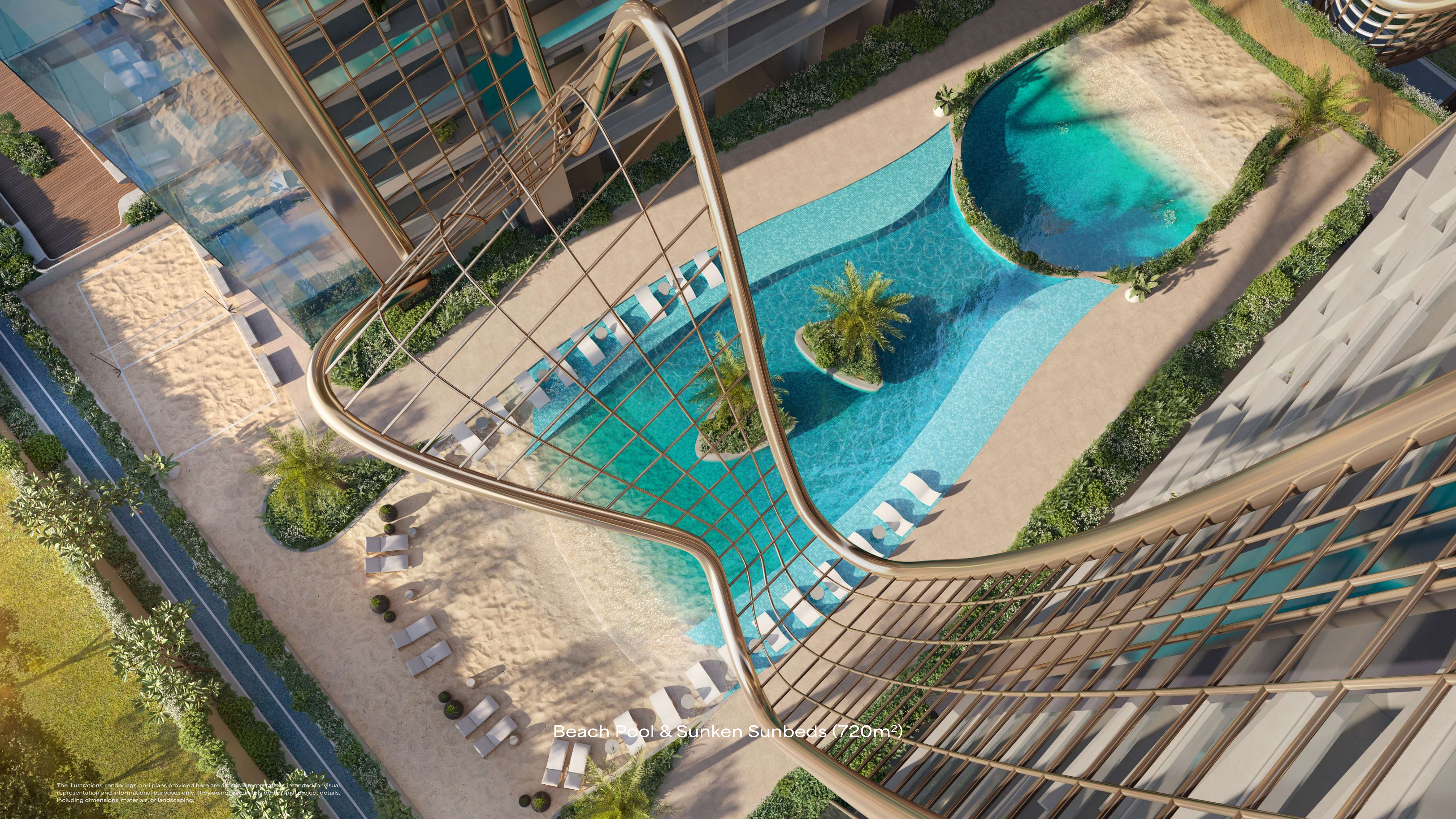
Beach Pool & Sunken Sunbeds (720m 2 )