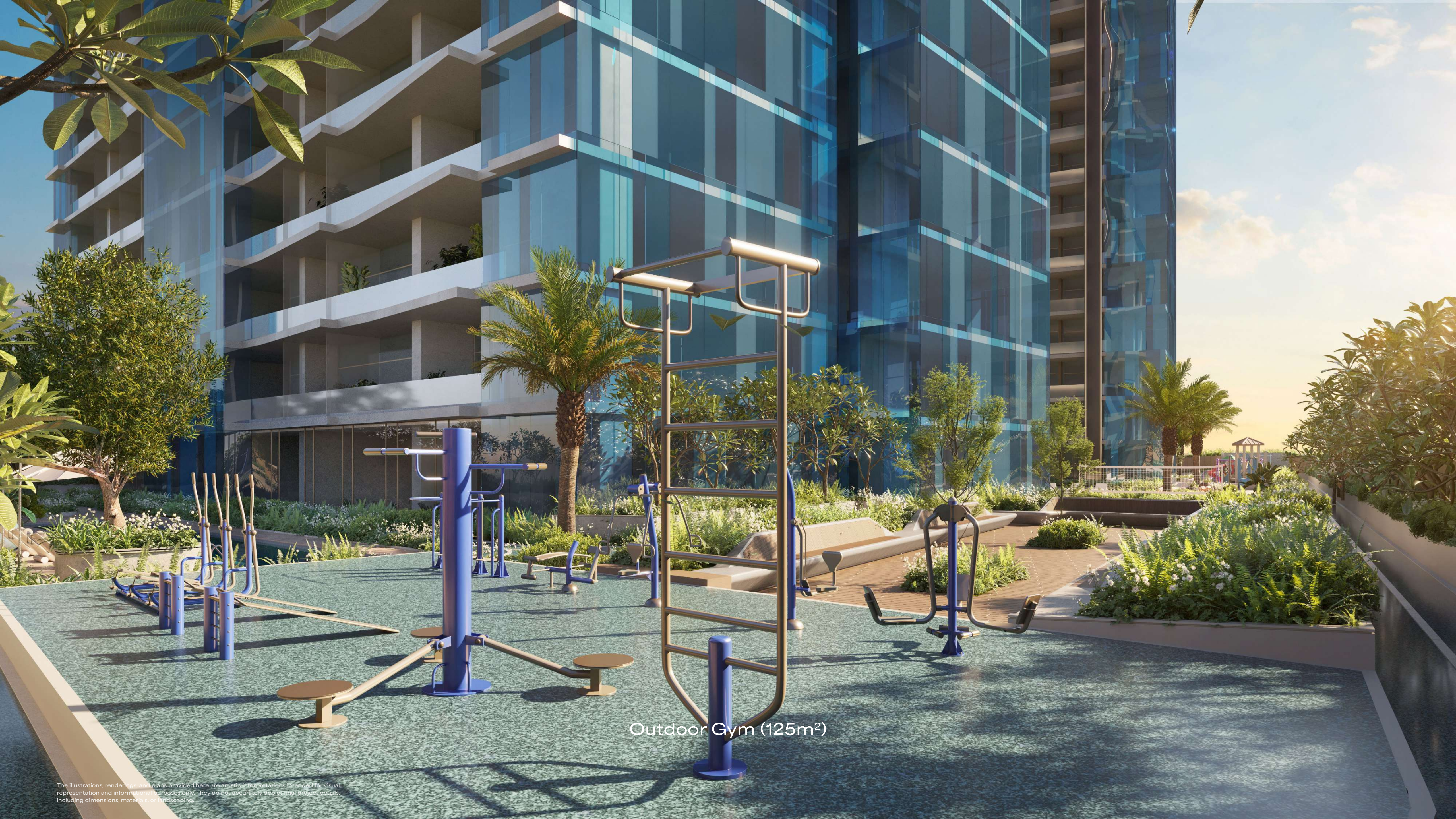
Outdoor Gym (125m 2 )