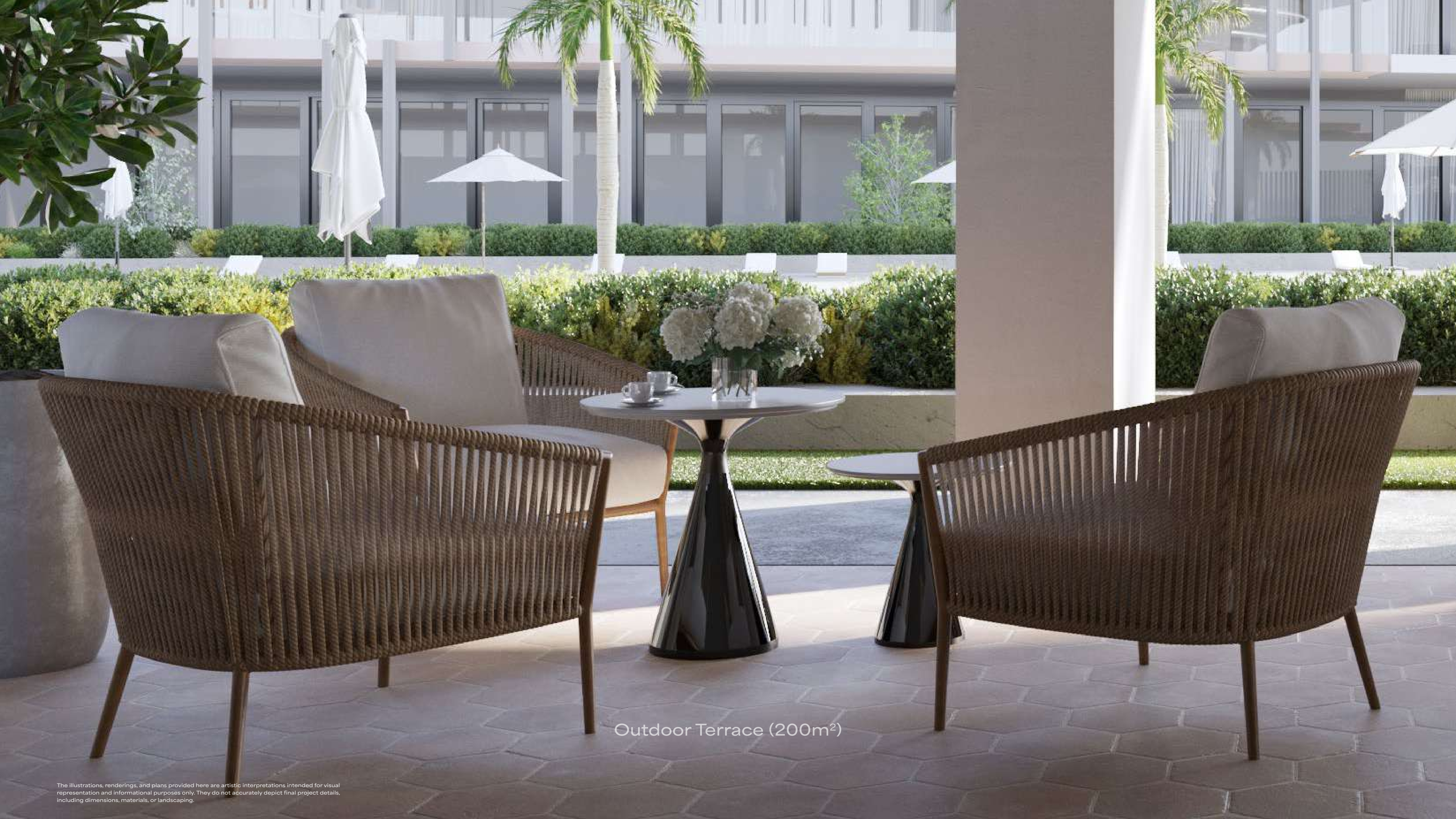
Outdoor Terrace (200m 2 )