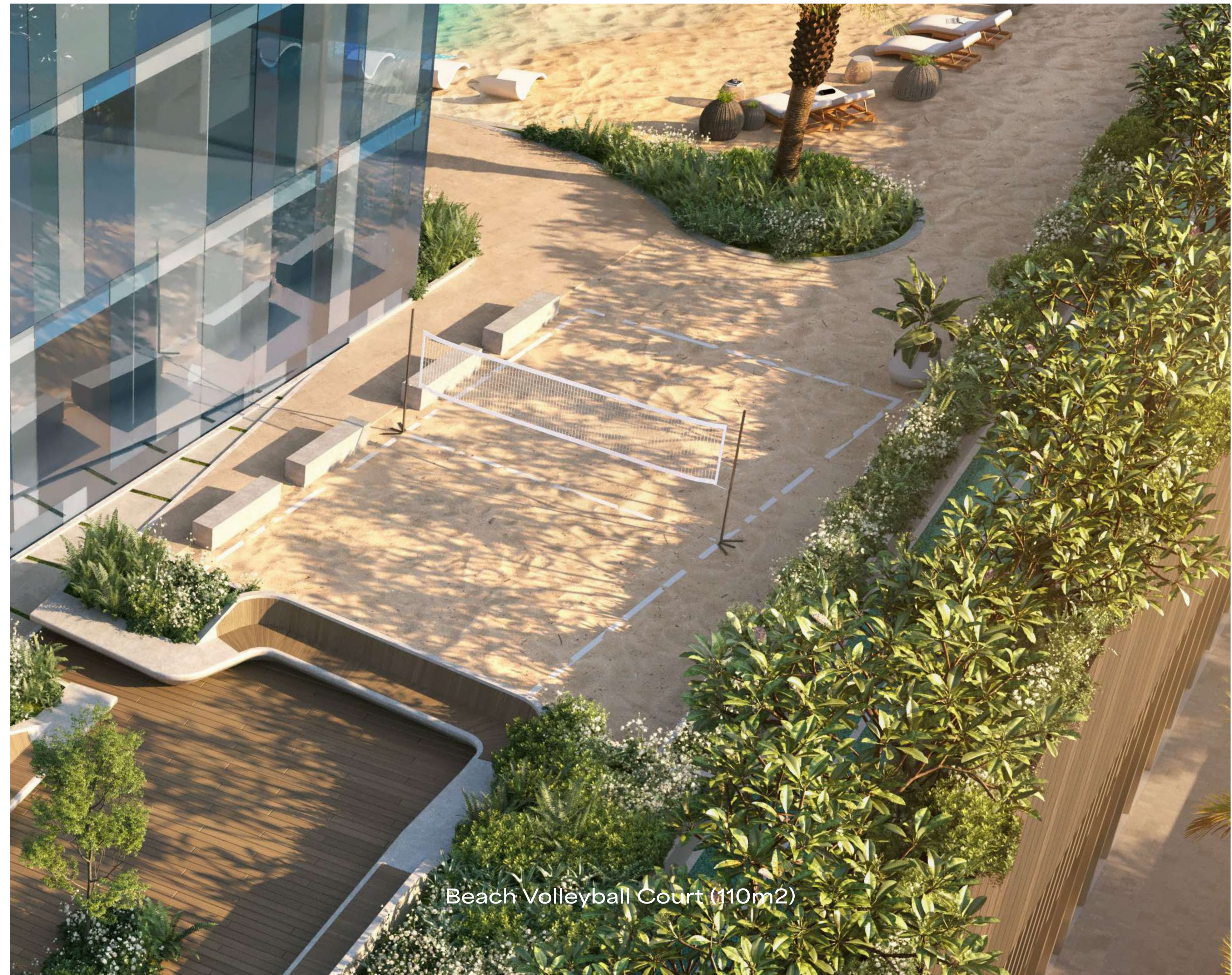
Beach Volleyball Court (110m 2 )