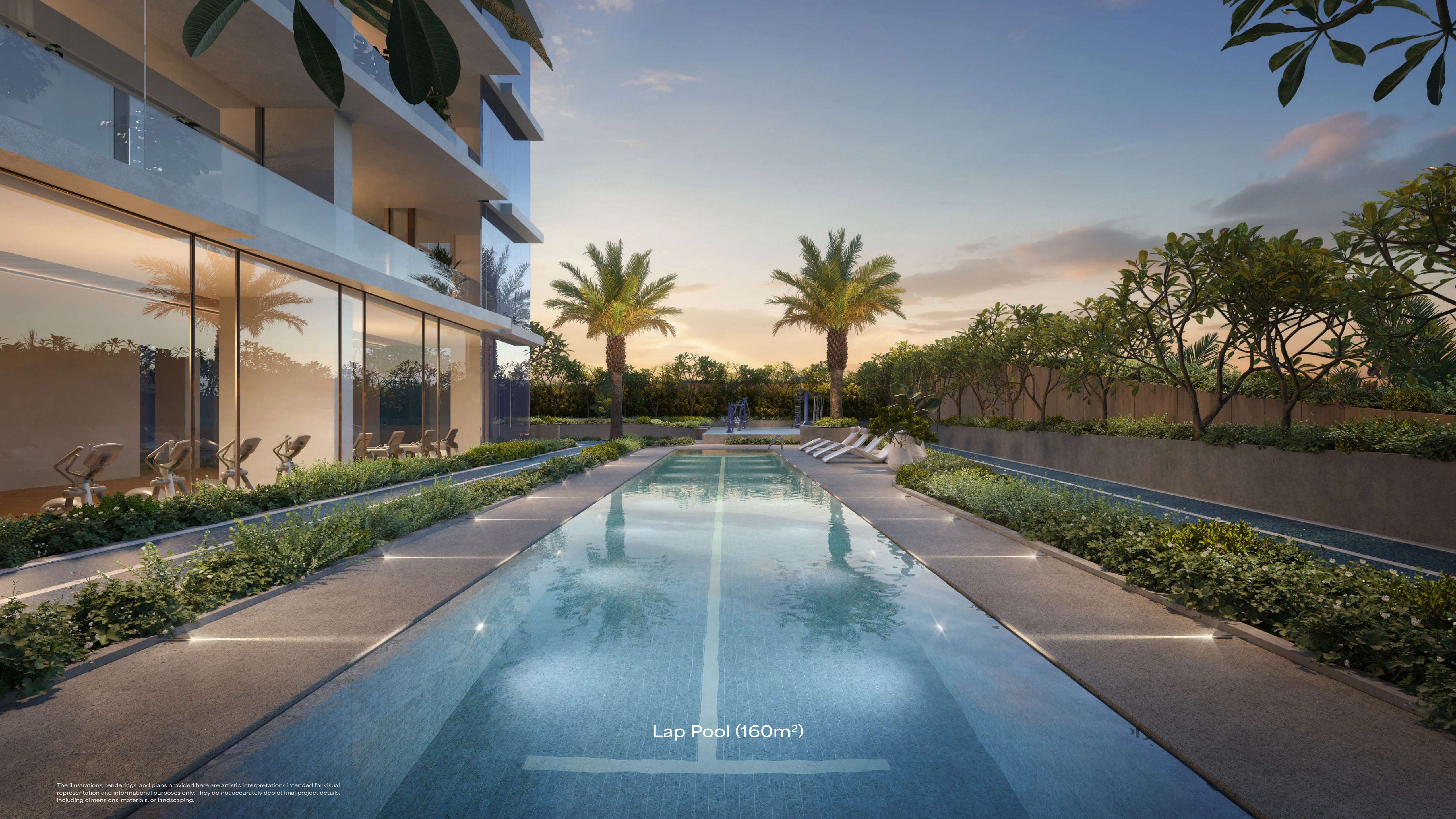
Lap Pool (160m 2 )