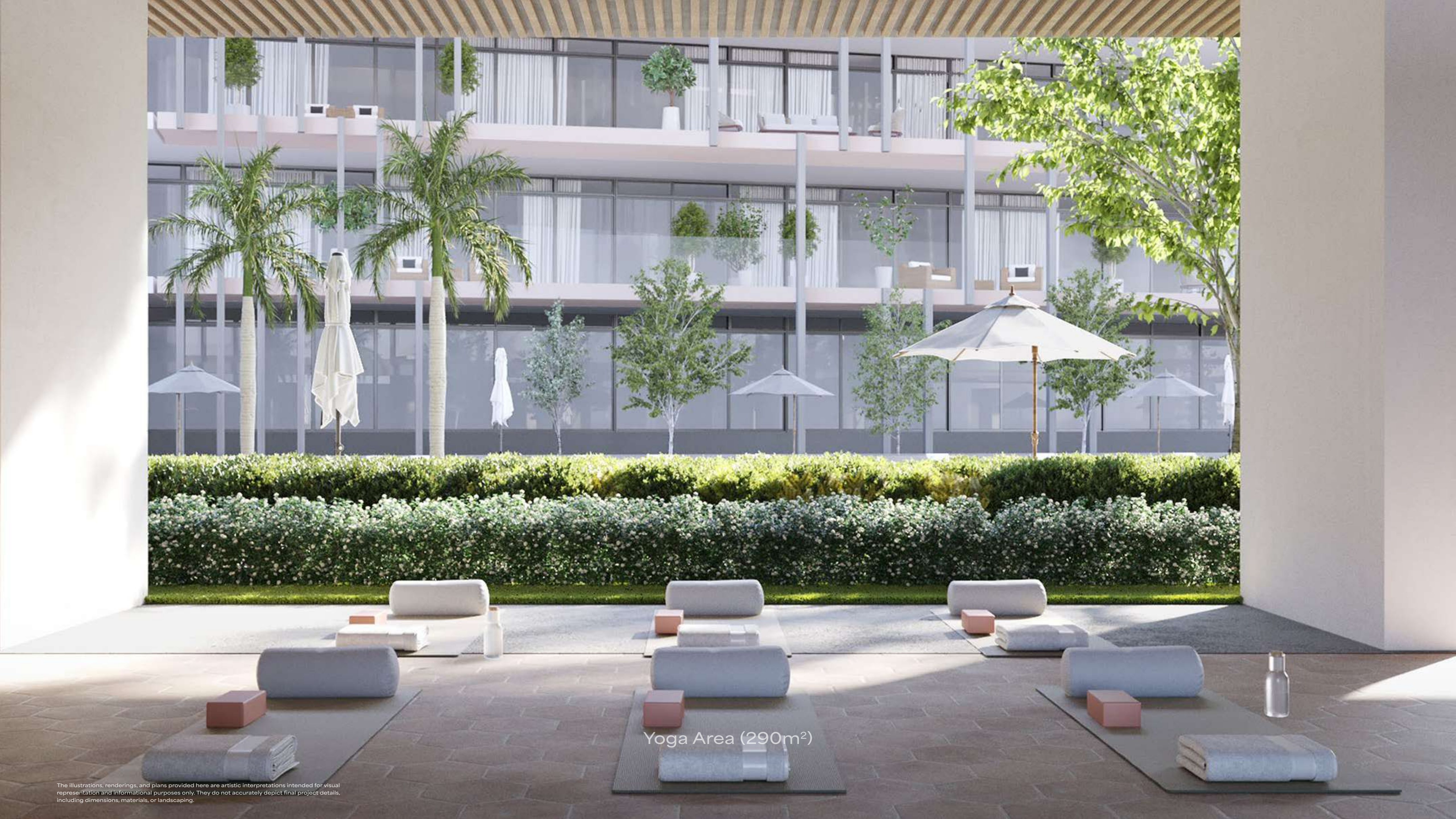
Yoga Area (290m 2 )