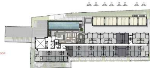
FLOOR PLAN | 1 ST FLOOR