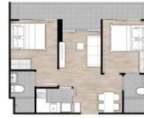
TYPE C 2-BEDROOM 50.00-54.60 SQ.M.