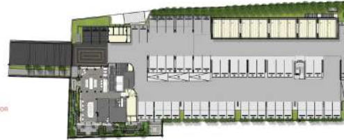
FLOOR PLAN | 0 TH FLOOR