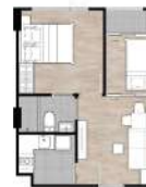
TYPE BP 1-BEDROOM PLUS 32.00-36.00 SQ.M.