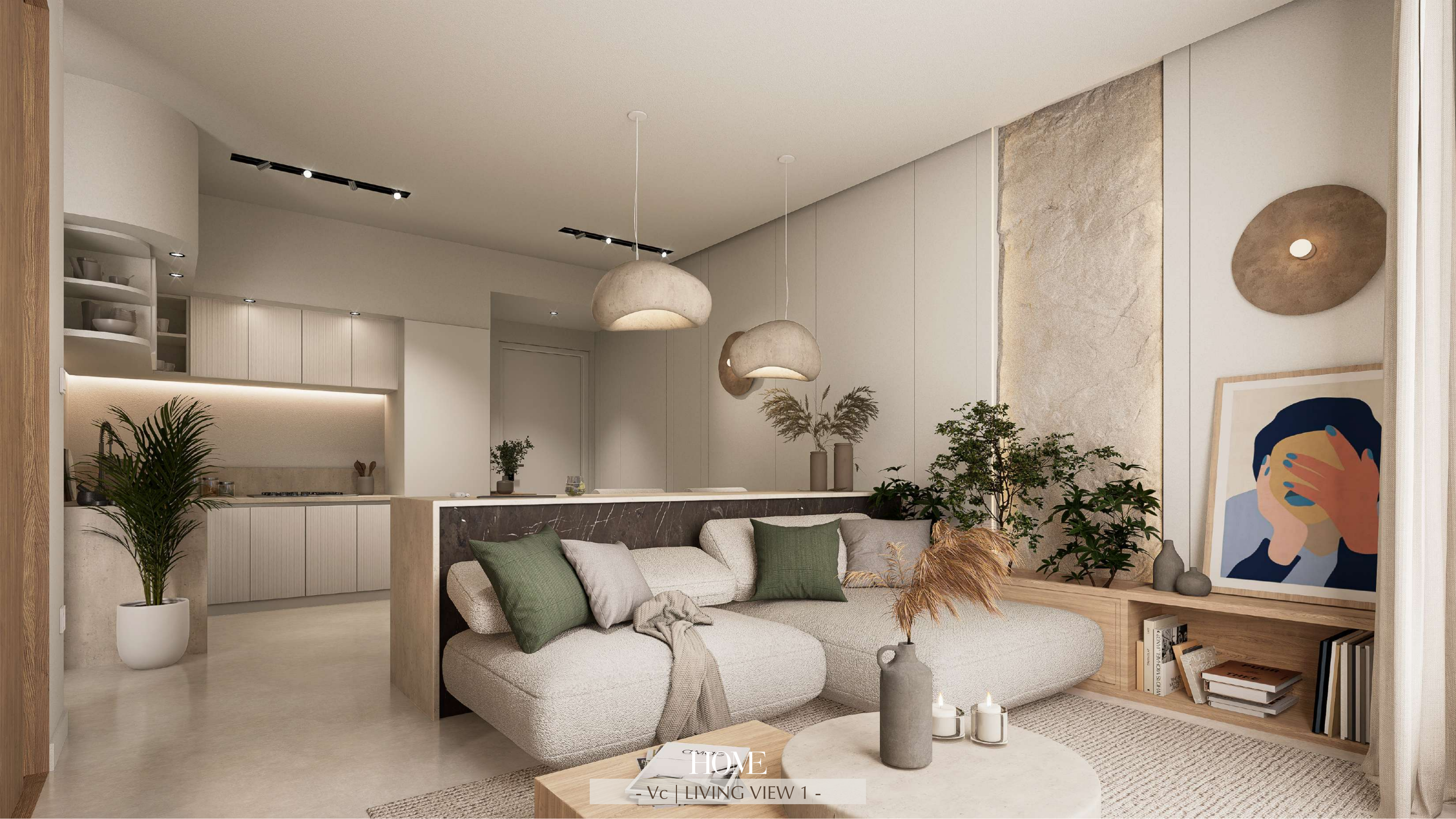
HOME - Vc | LIVING VIEW 1 -