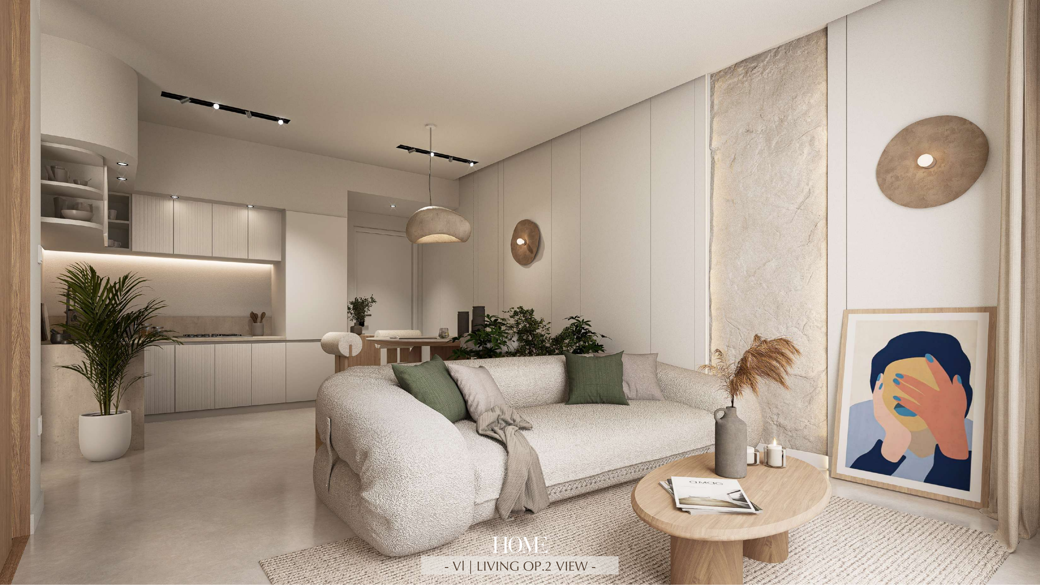
HOME - VI | LIVING OP.2 VIEW -