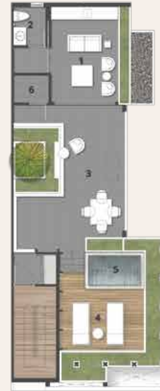
2 nd FLOOR PLAN