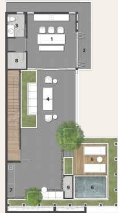
2 nd FLOOR PLAN