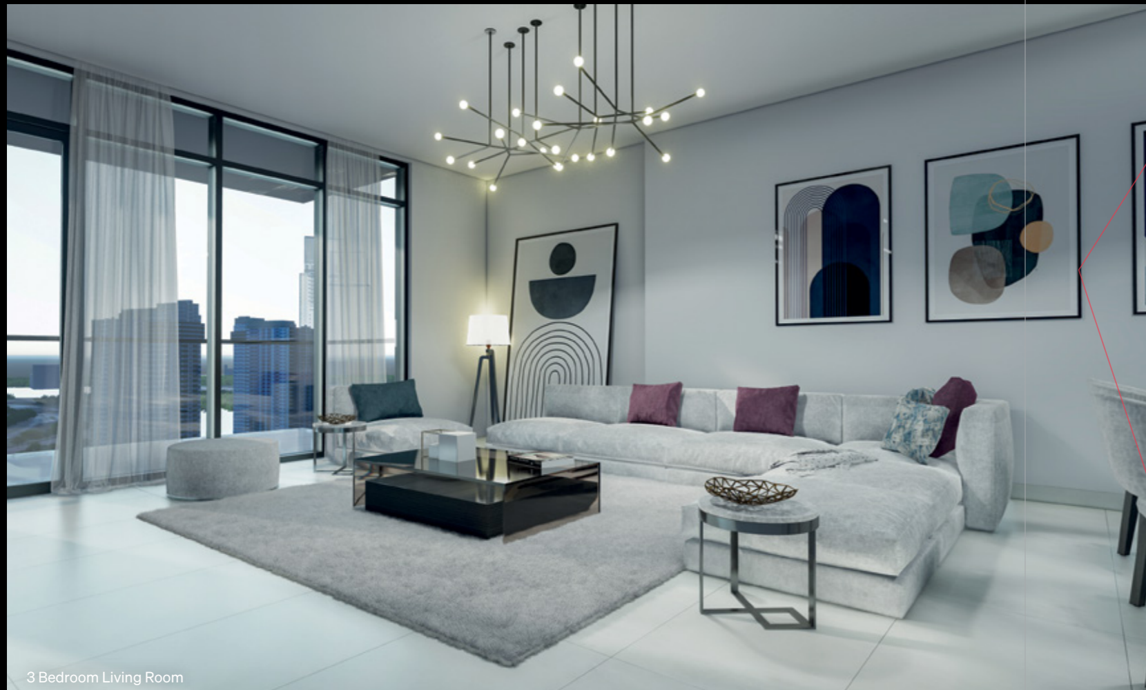
3 Bedroom Living Room