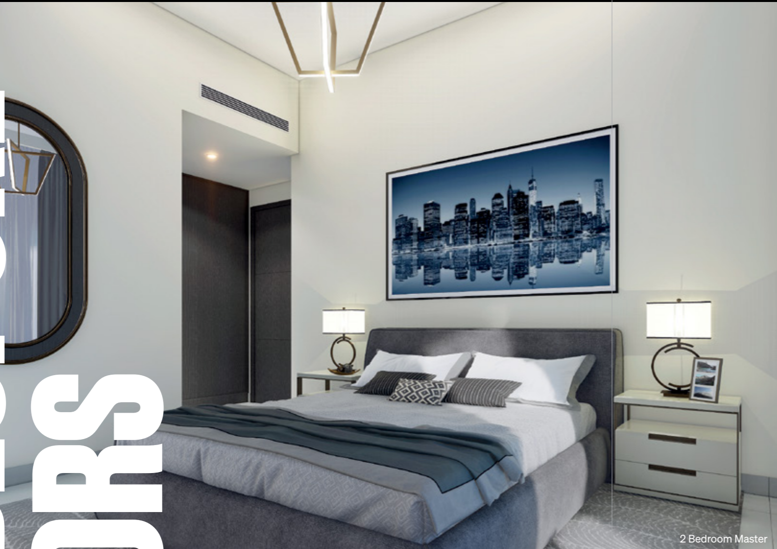
2 Bedroom Master

The Paragon apartments succeed in fusing an upmarket and stylish design with a harmonized and balanced atmosphere. Porcelain-tiled floors flow smoothly throughout each home, while European light fixtures are fitted within every room. Double glazed, floor to ceiling windows work functionally to keep out noise and heat, but also aesthetically to create a bright and open living space. The neutral color palette adds a touch of understated elegance or acts as the perfect base for owners to decorate to their own liking.