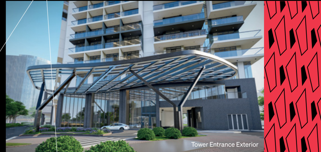
Tower Entrance Exterior