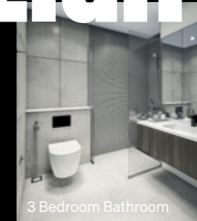
3 Bedroom Bathroom