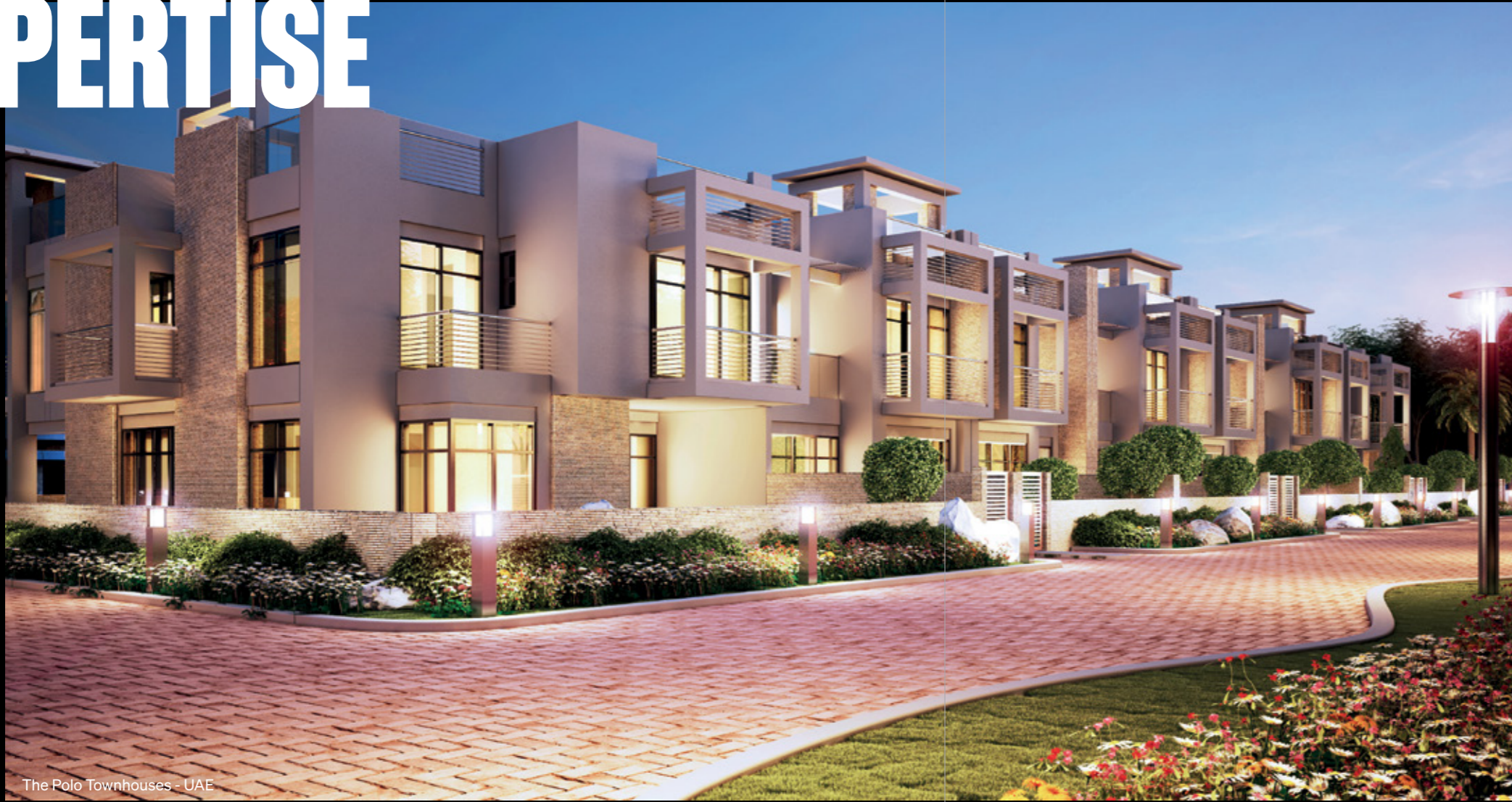
The Polo Townhouses - UAE