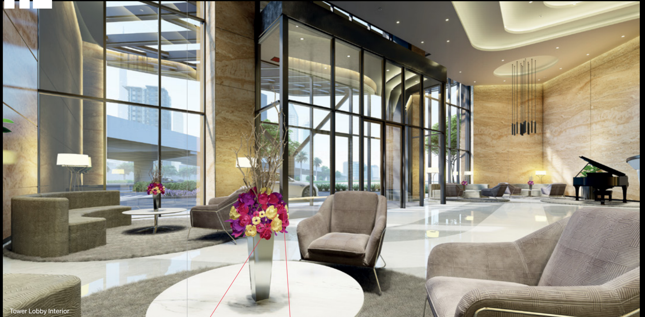
Tower Lobby Interior

THE PARAGON HAS AN EDGY URBAN ARCHITECTURAL DESIGN AND IS BUILT WITH THE HIGHEST QUALITY MATERIALS AND FINISHES, MAKING IT THE DEFINITION OF ULTIMATE SOPHISTICATION.