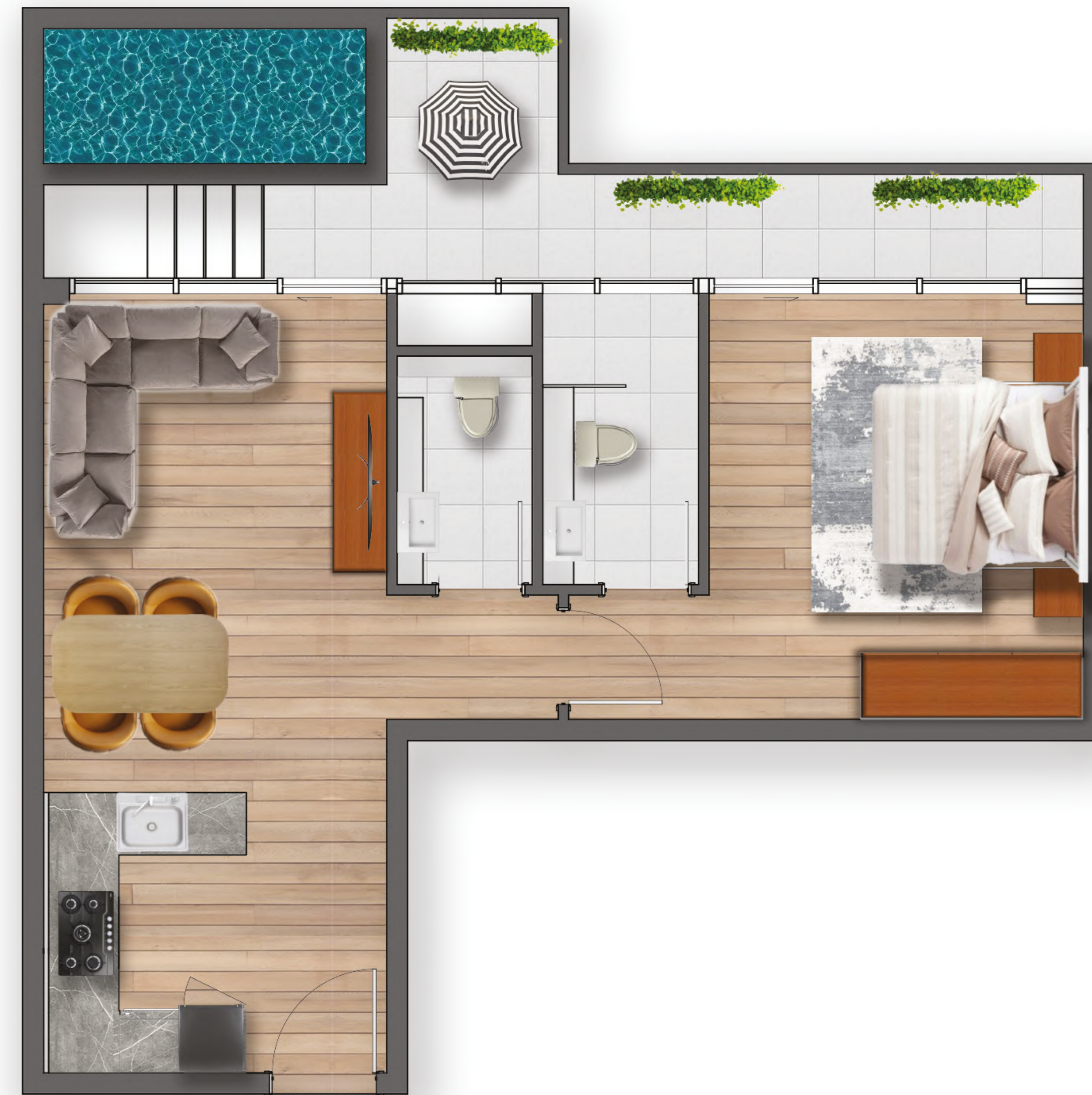
ONE BEDROOM WITH PRIVATE POOL