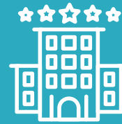
Waldorf Astoria RAK Resort