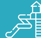
Ice Land Waterpark