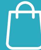
Al Hamra Mall