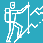
Hiking Jees Mountain