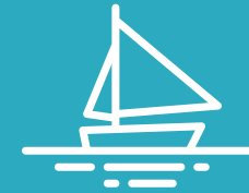
Al Hamra Marina & Yacht Club