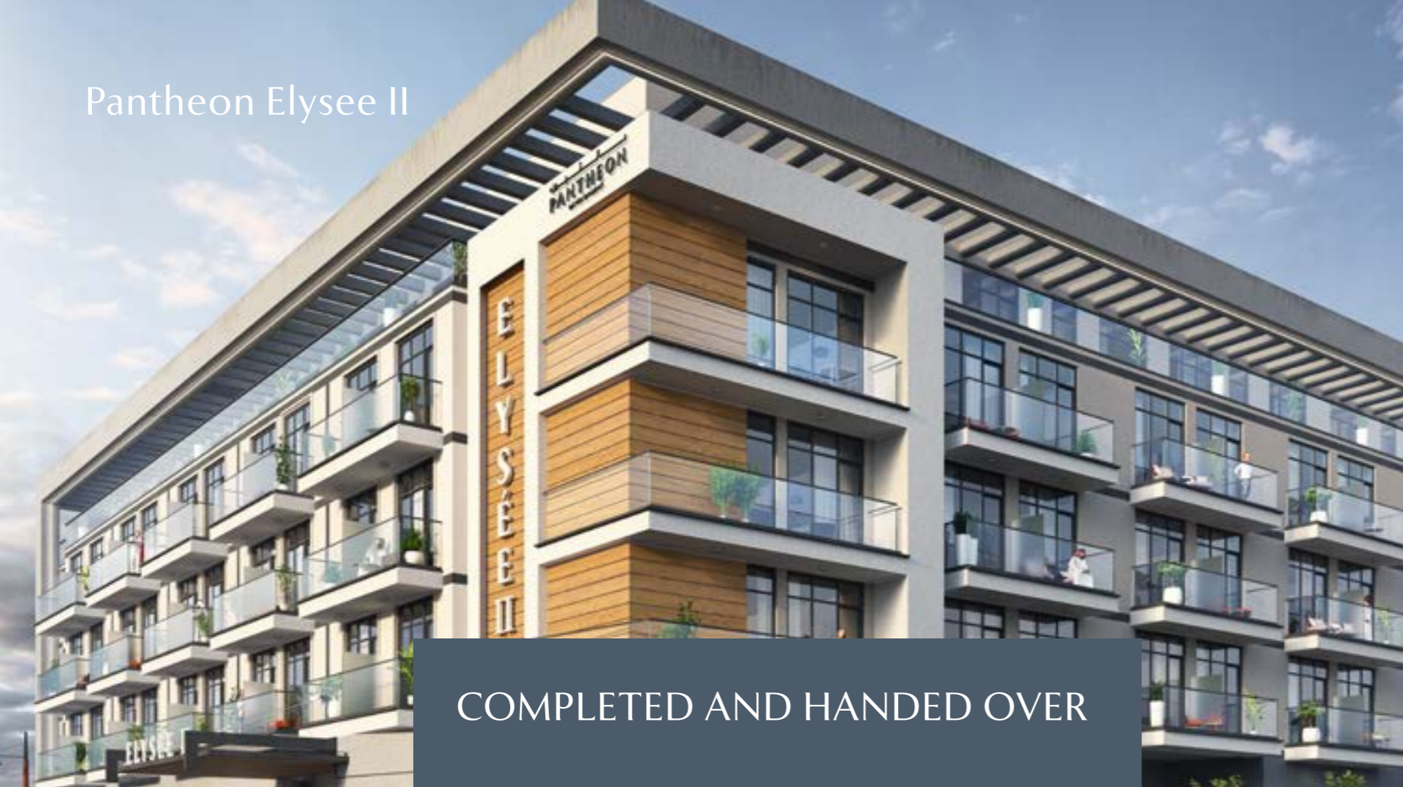
Pantheon Elysee II