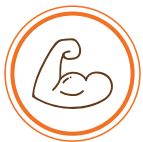
La Mazzoni's Version of Powerhouse

Beyond your private haven, a realm of exclusive indulgence unfolds. Crafted for those who seek the extraordinary, every amenity is a testament to refined living. From tranquil retreats to vibrant social spaces, every detail at La Mazzoni is designed to elevate your lifestyle, offering a seamless blend of luxury, comfort, and sophistication.