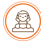
Kid's Pool and Play Area