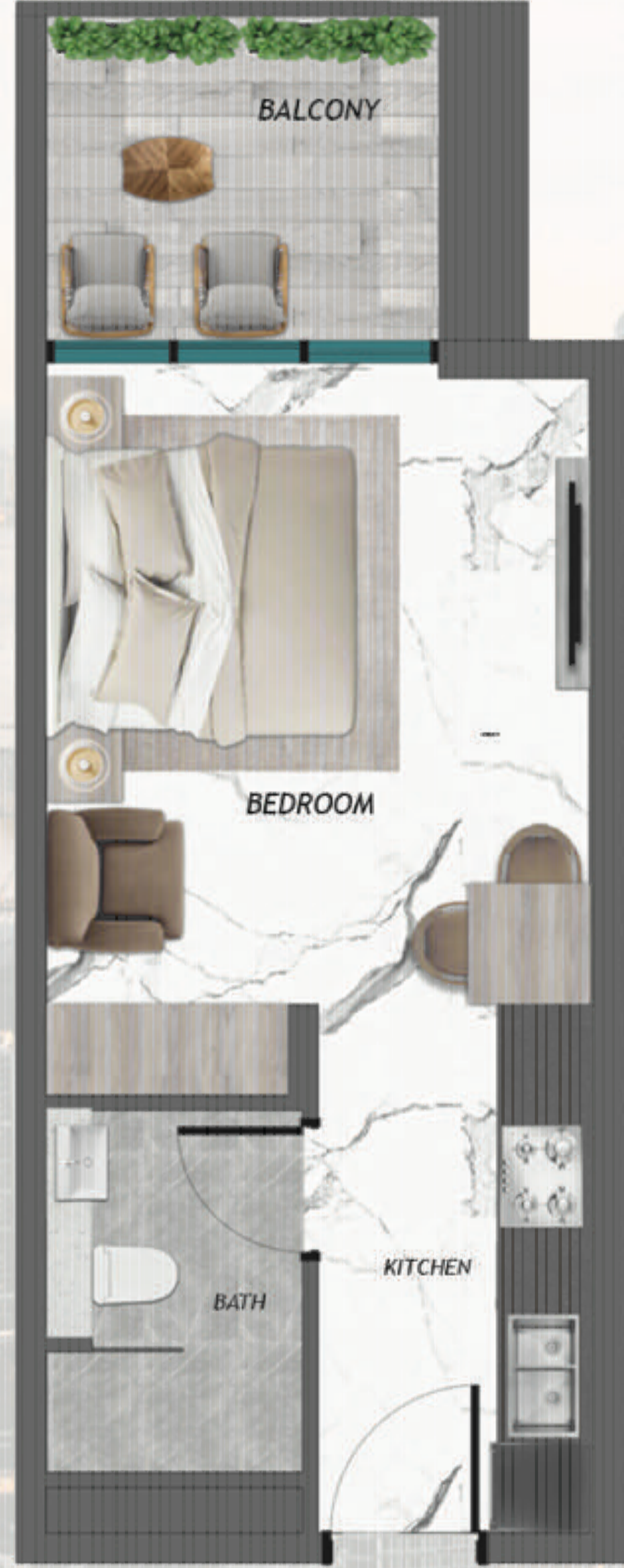
Studio WITHOUT POOL