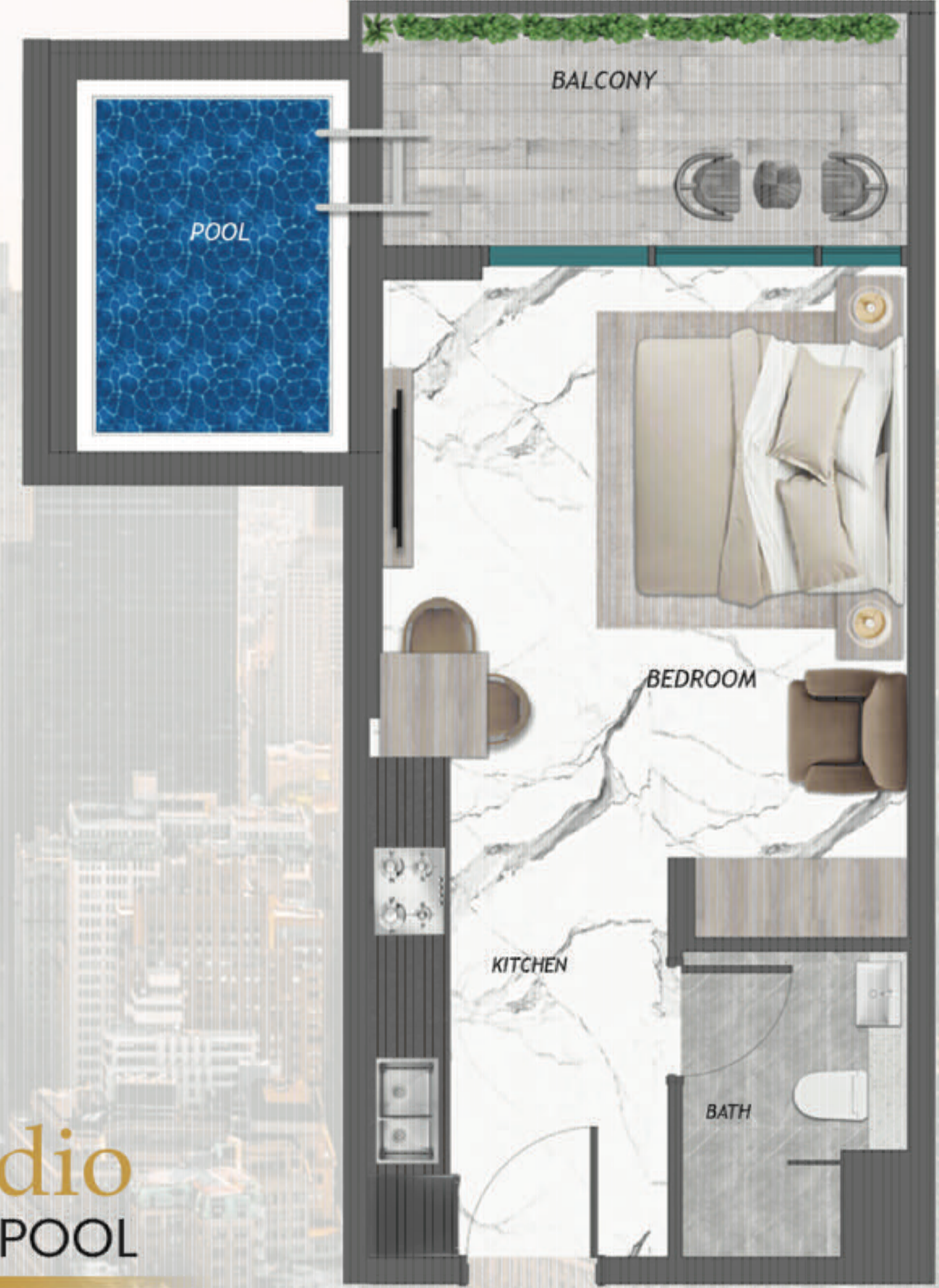
Studio WITH POOL