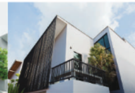
WALLAYA VILLAS HARMONY PHASE 2-3