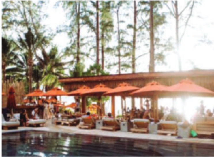
CAFÉ DEL MAR PHUKET 4 min / 2 km.