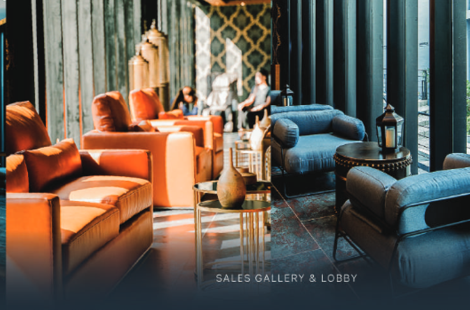
SALES GALLERY & LOBBY