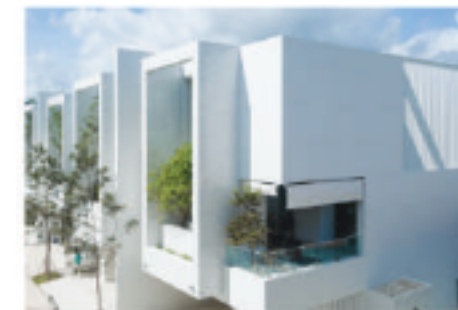
THE RESIDENCE BY ANDAMAN ASSET SOLUTION