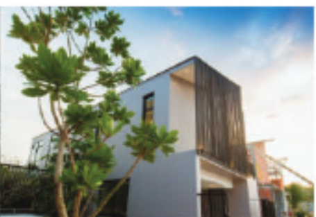
WALLAYA VILLAS PASAK SOI B