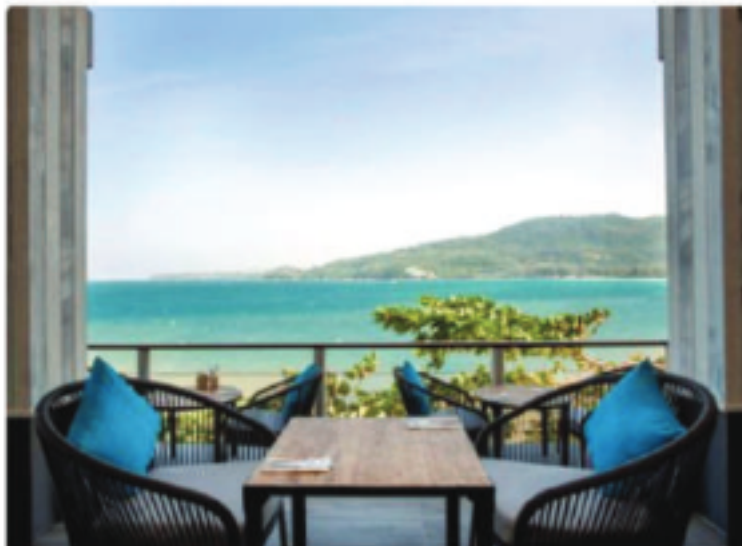
CAPE SIENNA ROCKS CAFE 6 min / 6 km.