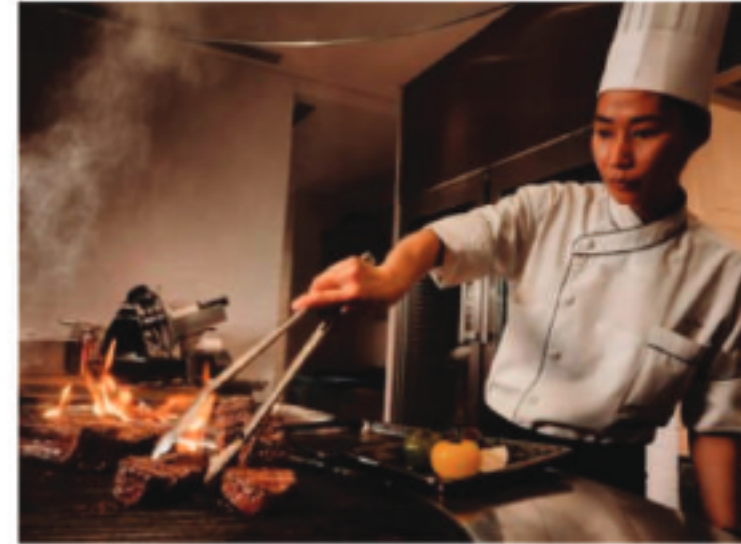
WAGYU STEAKHOUSE 7 min / 5 km.