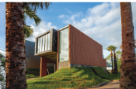
THE VICTORY BY ANDAMAN ASSET SOLUTION