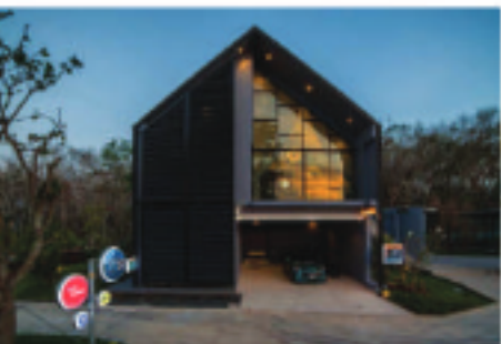
WALLAYA VILLAS THE GRANARY