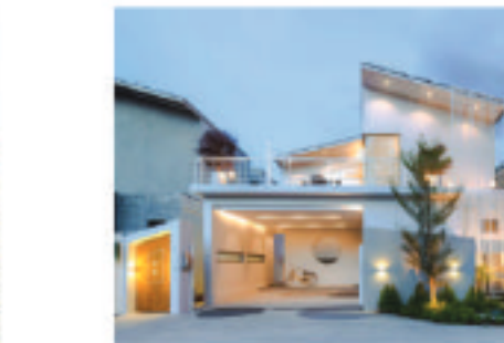
WALLAYA VILLAS THE ELEMENT