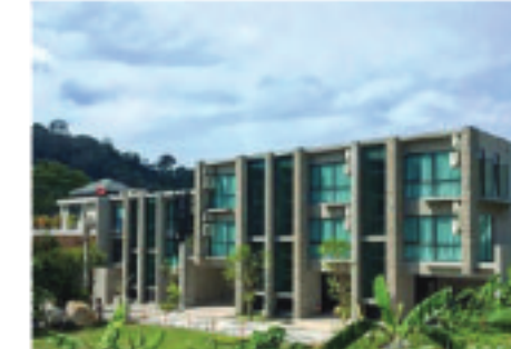
WALLAYA VILLAS BY THE LAKE