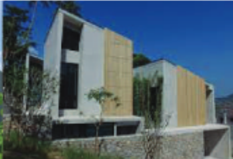
WALLAYA GRAND RESIDENCE