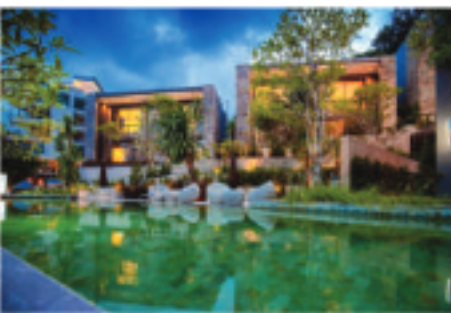
NATURAL PARK PAVILLION