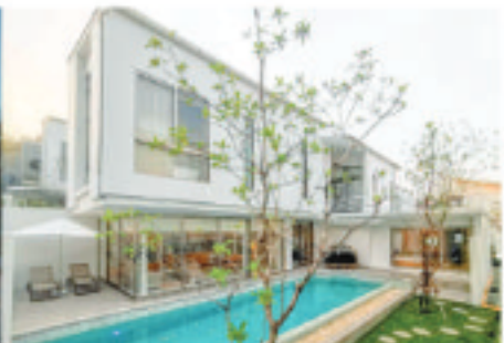
WALLAYA VILLAS THE NEST