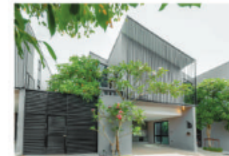
WALLAYA VILLAS HARMONY PHASE 1