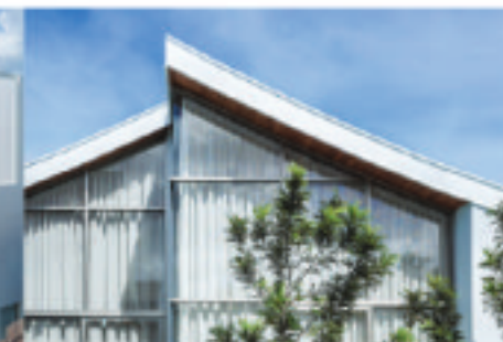
THE TRINITY BY ANDAMAN ASSET SOLUTION