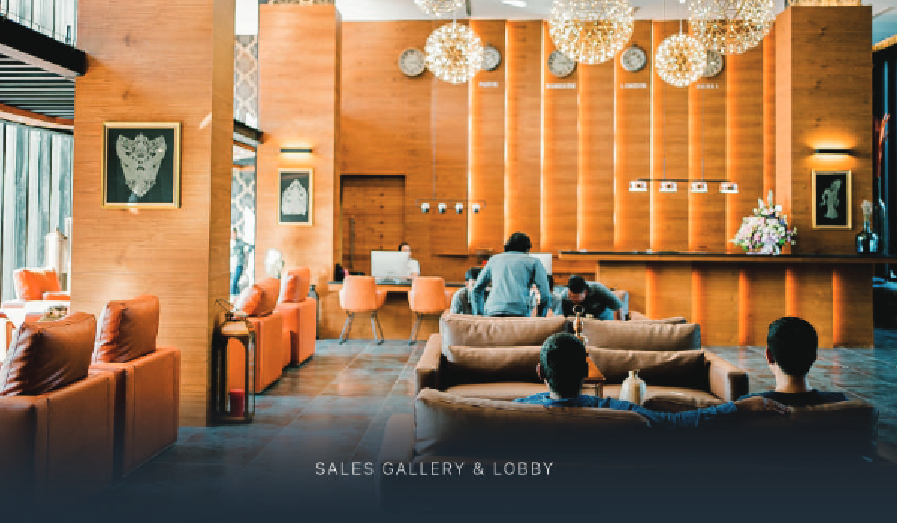
SALES GALLERY & LOBBY