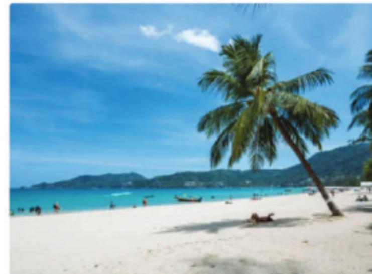
PATONG BEACH 18 min / 9 km.