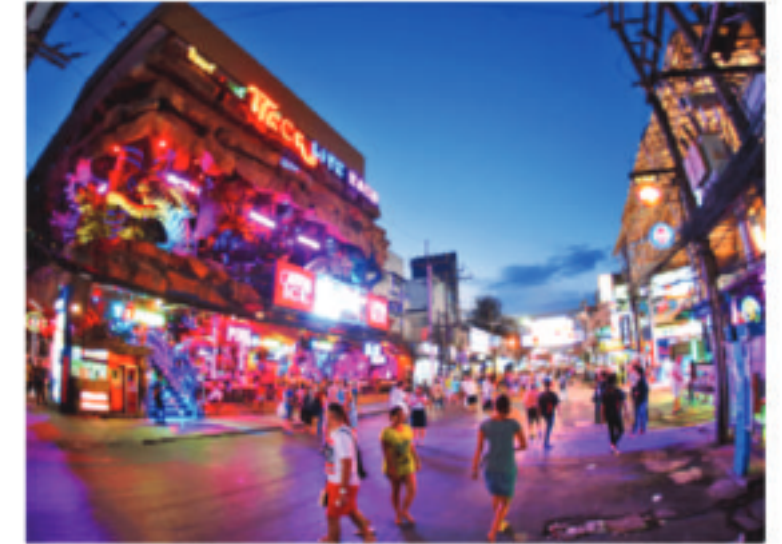
BANGLA WALKING STREET 19 min / 10 km.