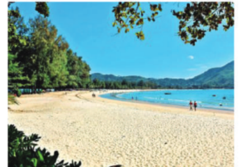
KAMALA BEACH 5 min / 2 km.