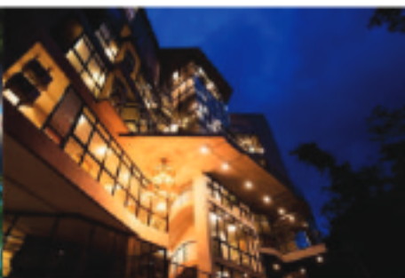
NATURAL PARK HABITAT