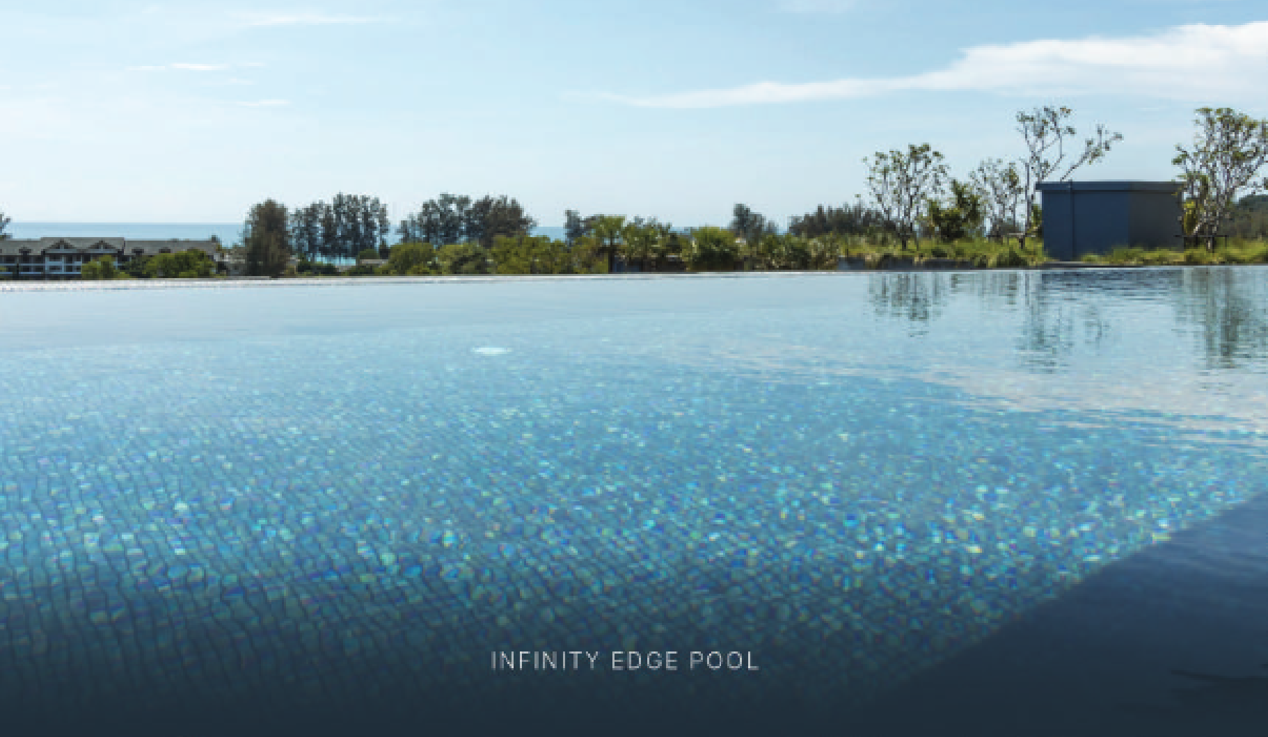
INFINITY EDGE POOL