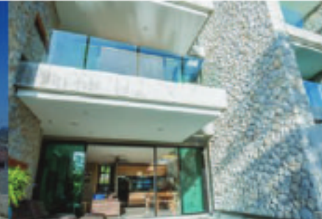
NATURAL PARK VILLAS