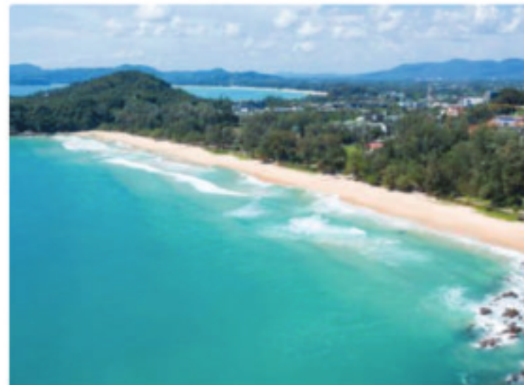
SURIN BEACH 9 min / 5 km.