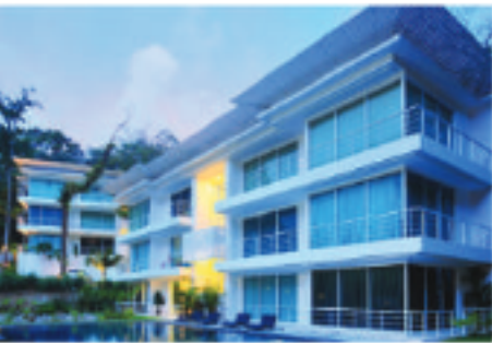
THE TREE RESIDENCE