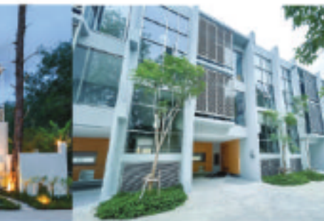
WALLAYA VILLAS TOWN AT CHALONG