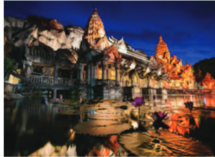
PHUKET FANTASEA 4 min / 1 km.