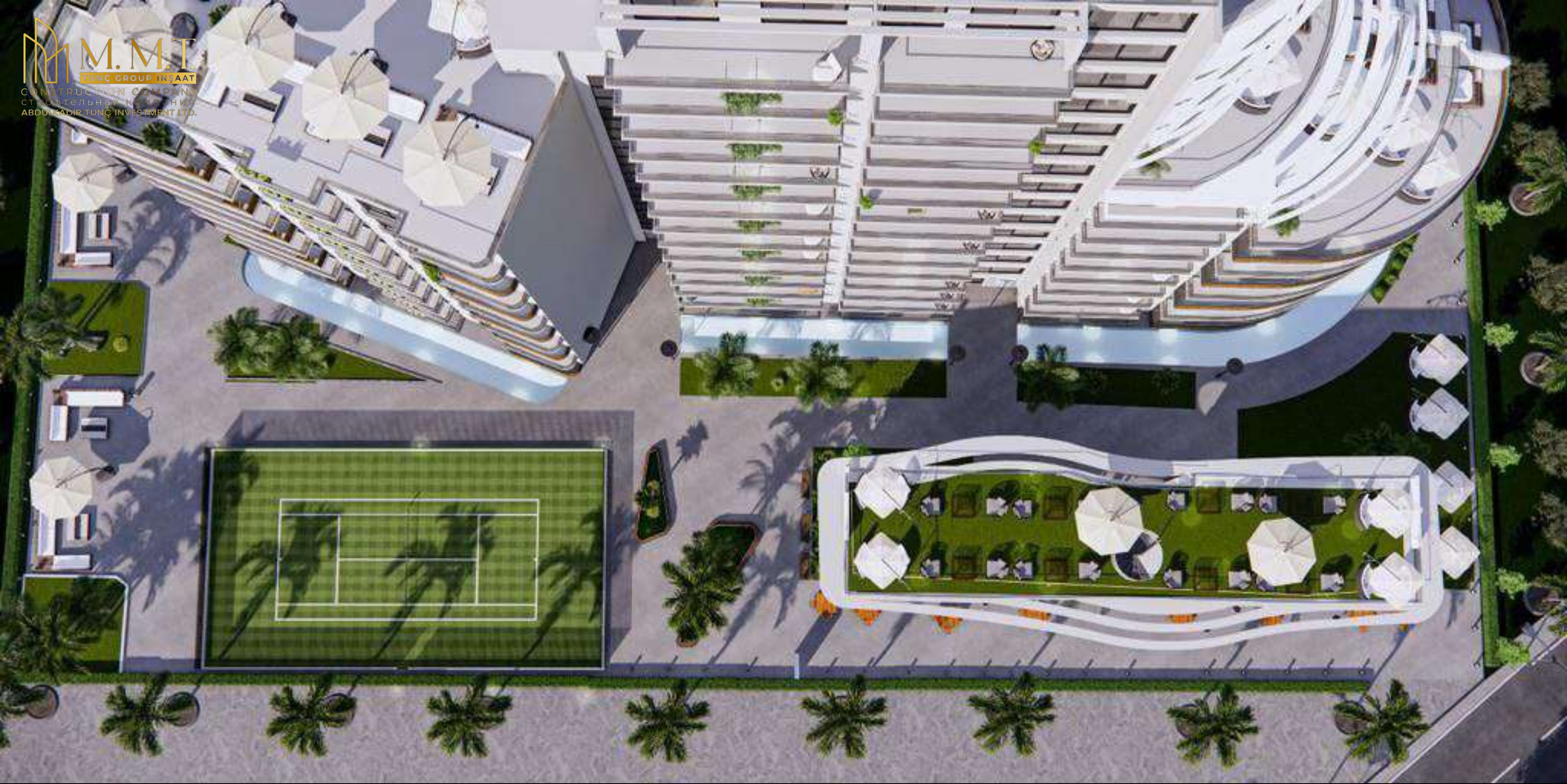
Top view, backyard