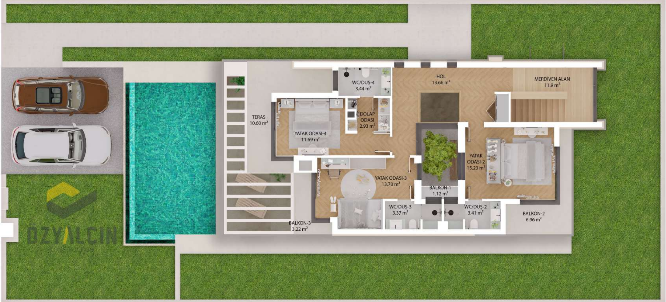
TİP C (C2,C3,C4)