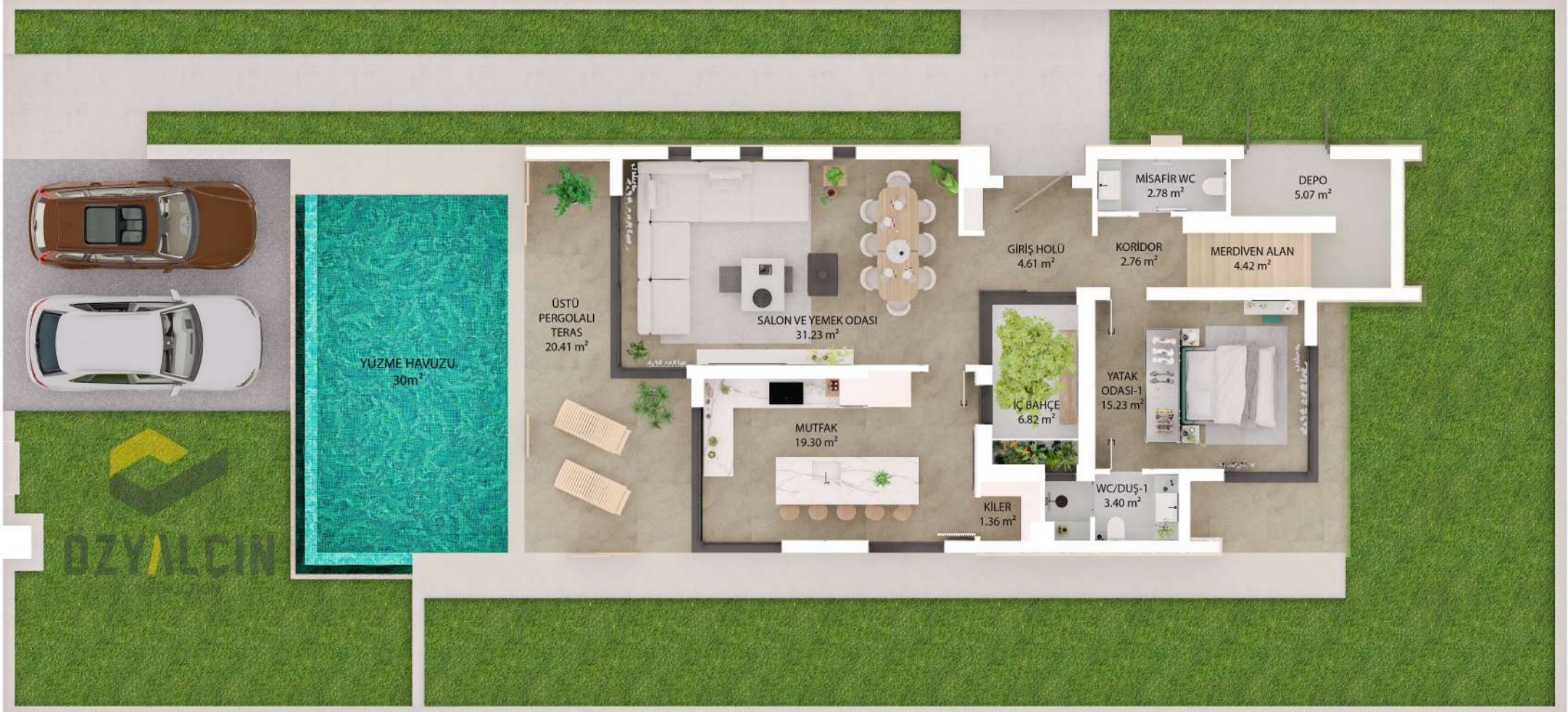
TİP C (C2,C3,C4)