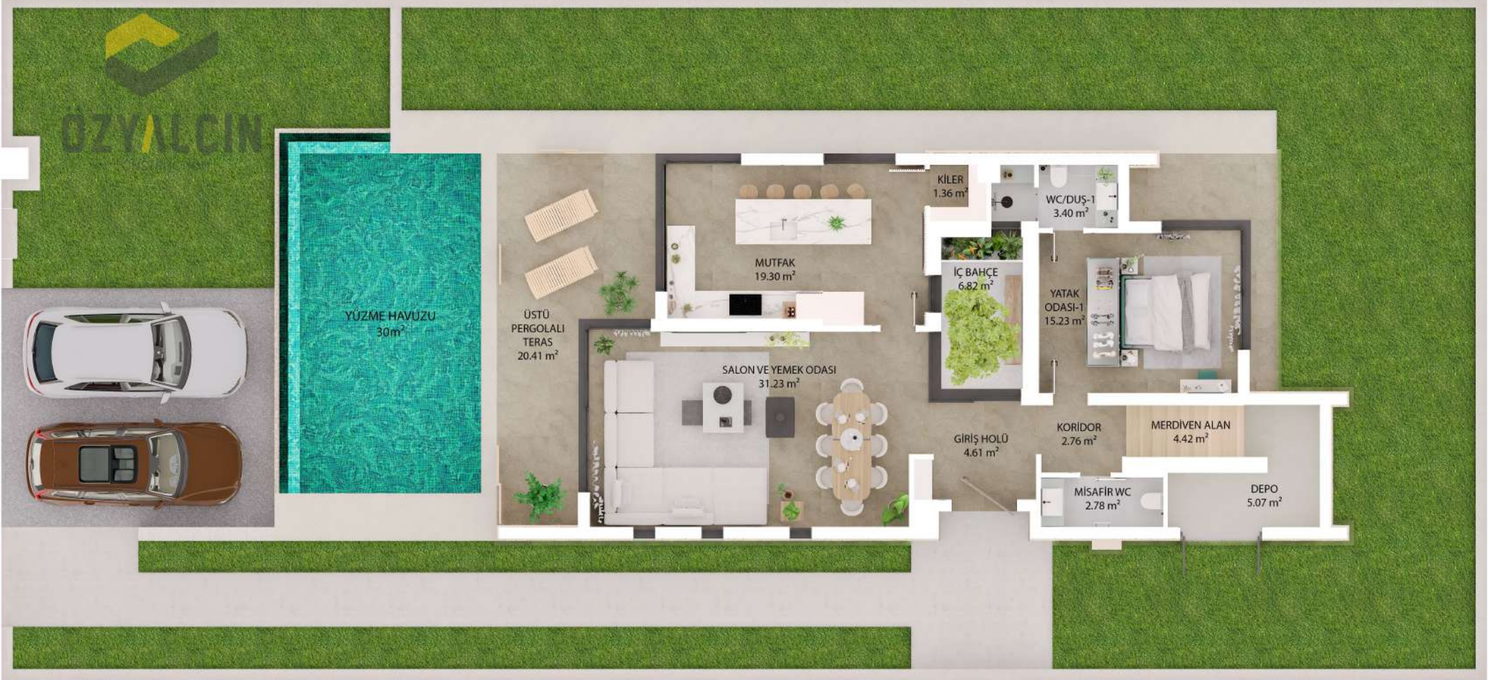
TİP B (B1,B2,B3,B4,B5,B8,B9,B10,B14)