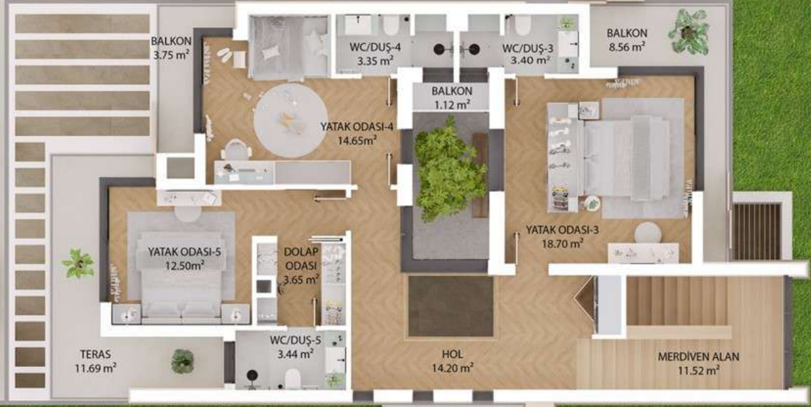
TİP A (A1,A2,A3,A4,A5,A6)