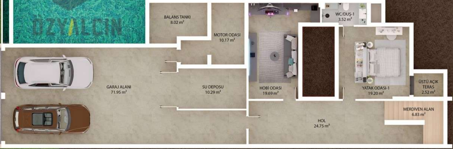
TİP A (A1,A2,A3,A4,A5,A6)