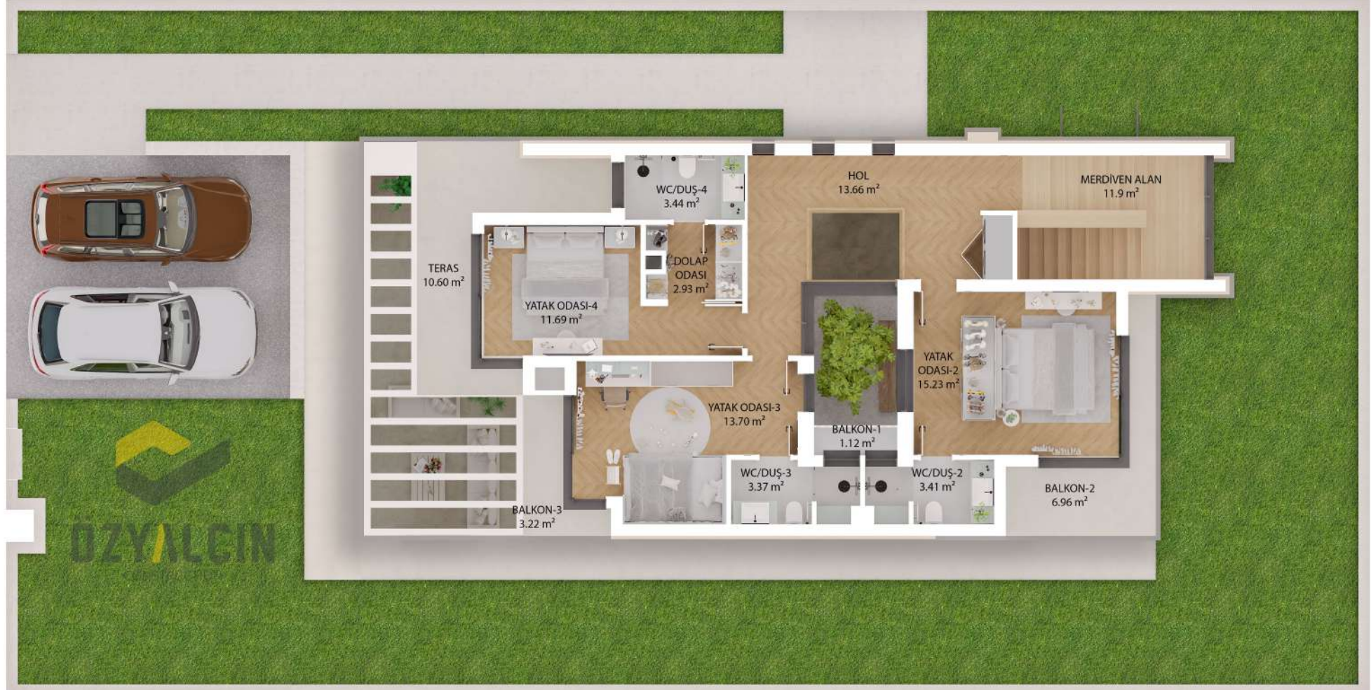
TİP C (C1)