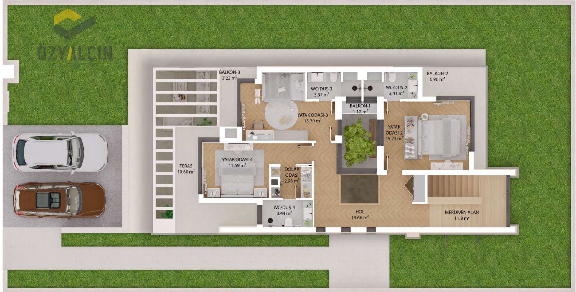
TİP B (B6,B7,B12,B13)