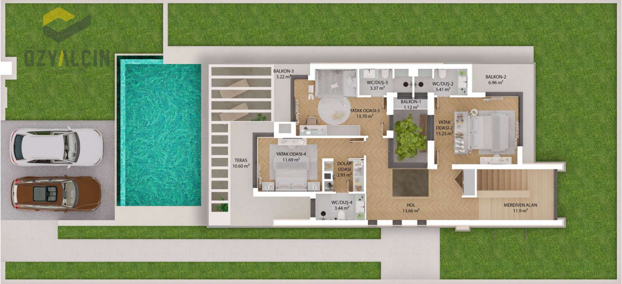
TİP B (B1,B2,B3,B4,B5,B8,B9,B10,B14)