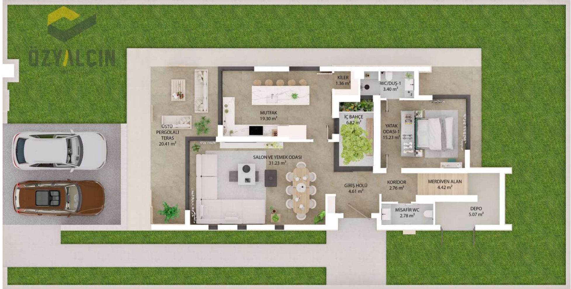
TİP B (B6,B7,B12,B13)