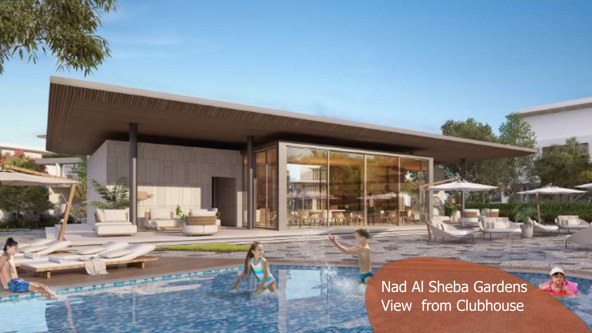
Nad Al Sheba Gardens View from Clubhouse