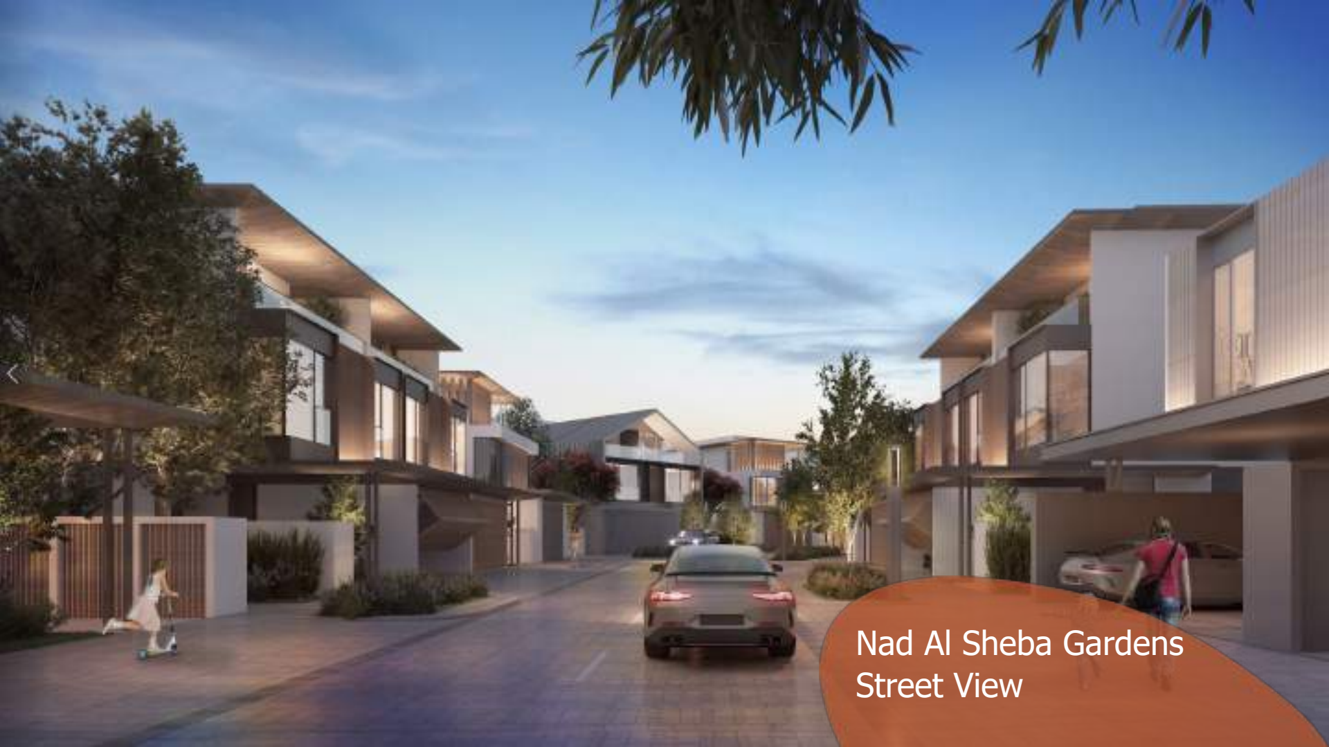
Nad Al Sheba Gardens Street View