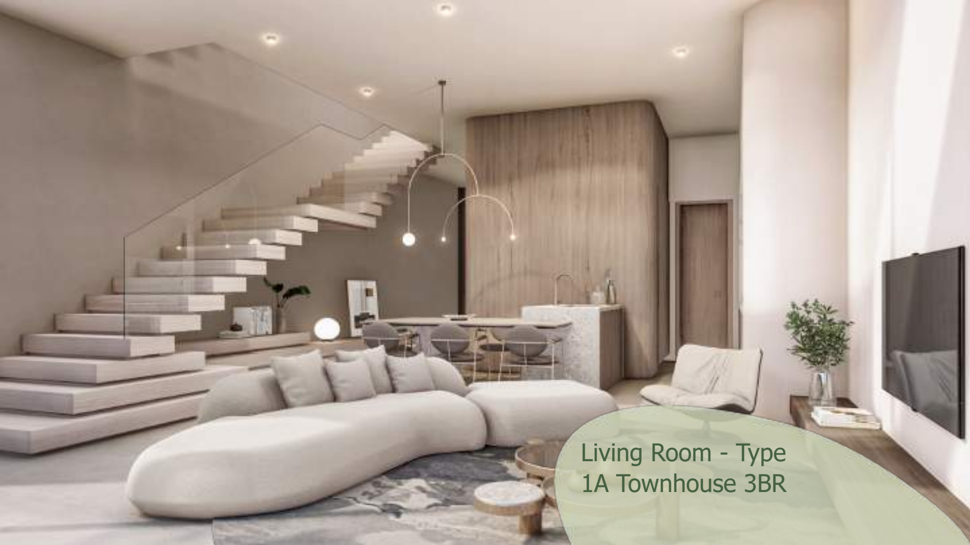
Living Room - Type 1A Townhouse 3BR