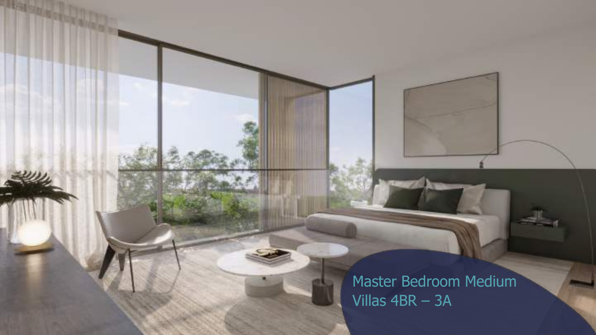
Master Bedroom Medium Villas 4BR – 3A