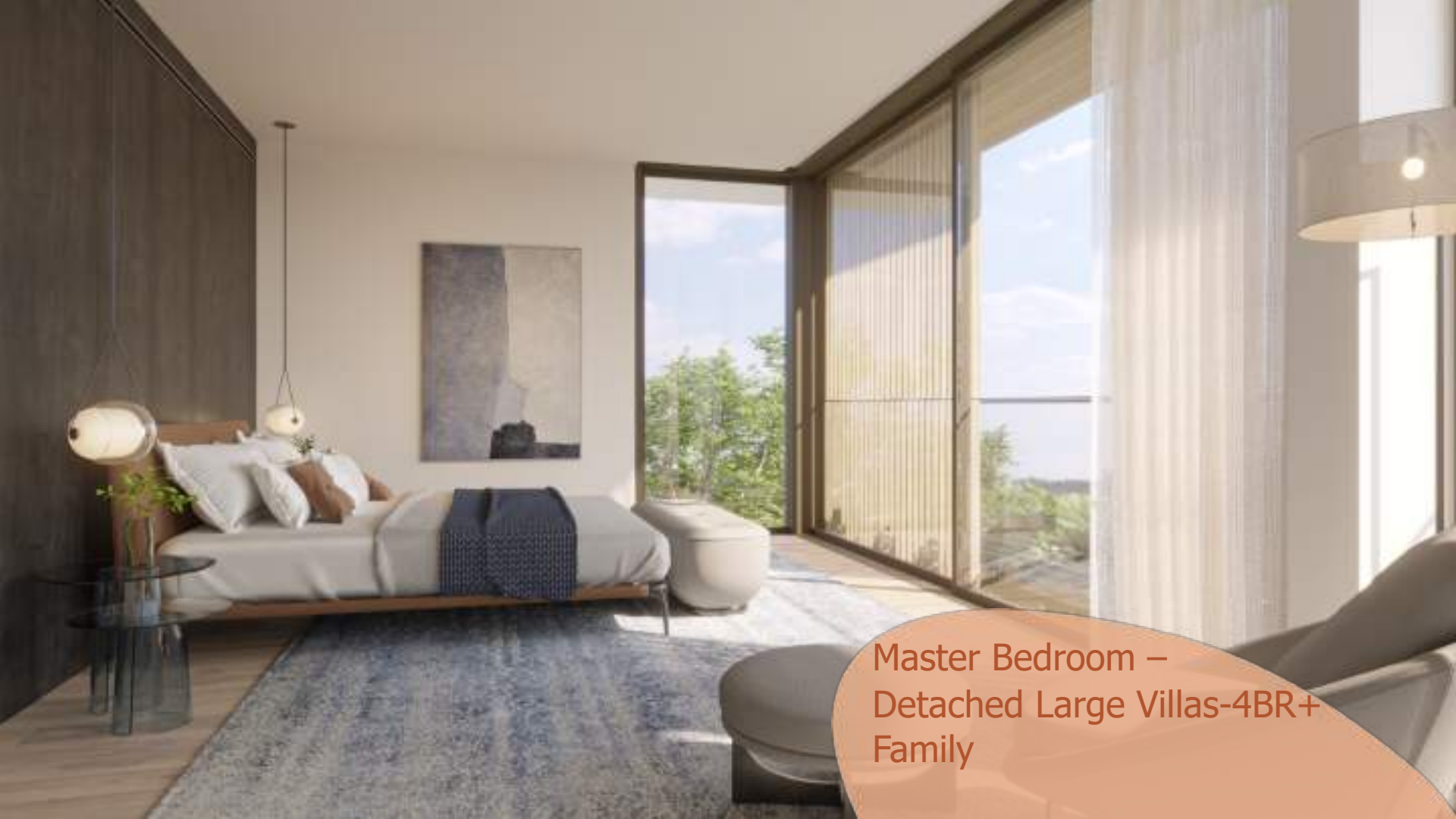
Master Bedroom – Detached Large Villas-4BR+ Family