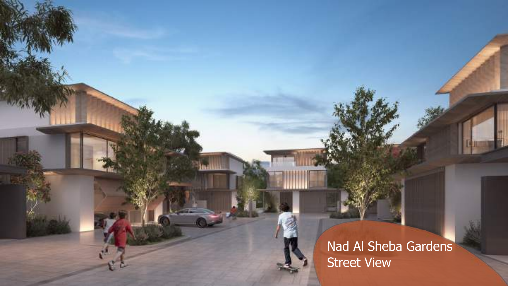
Nad Al Sheba Gardens Street View