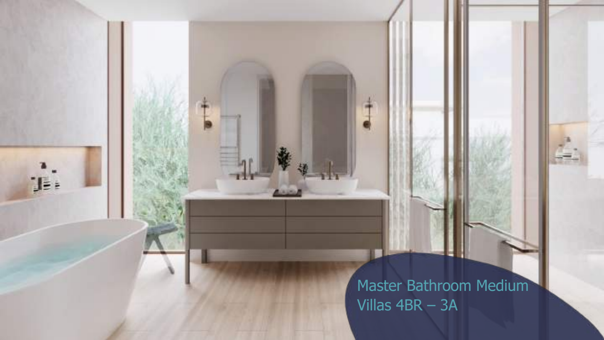
Master Bathroom Medium Villas 4BR – 3A