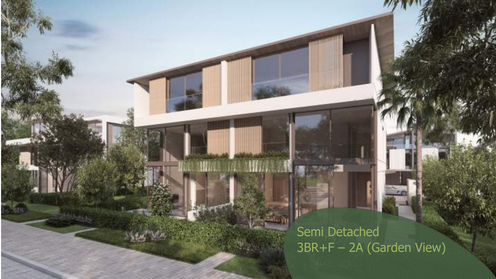
Semi Detached 3BR+F – 2A (Garden View)