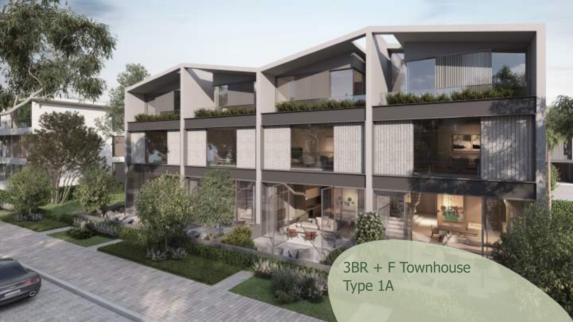
3BR + F Townhouse Type 1A