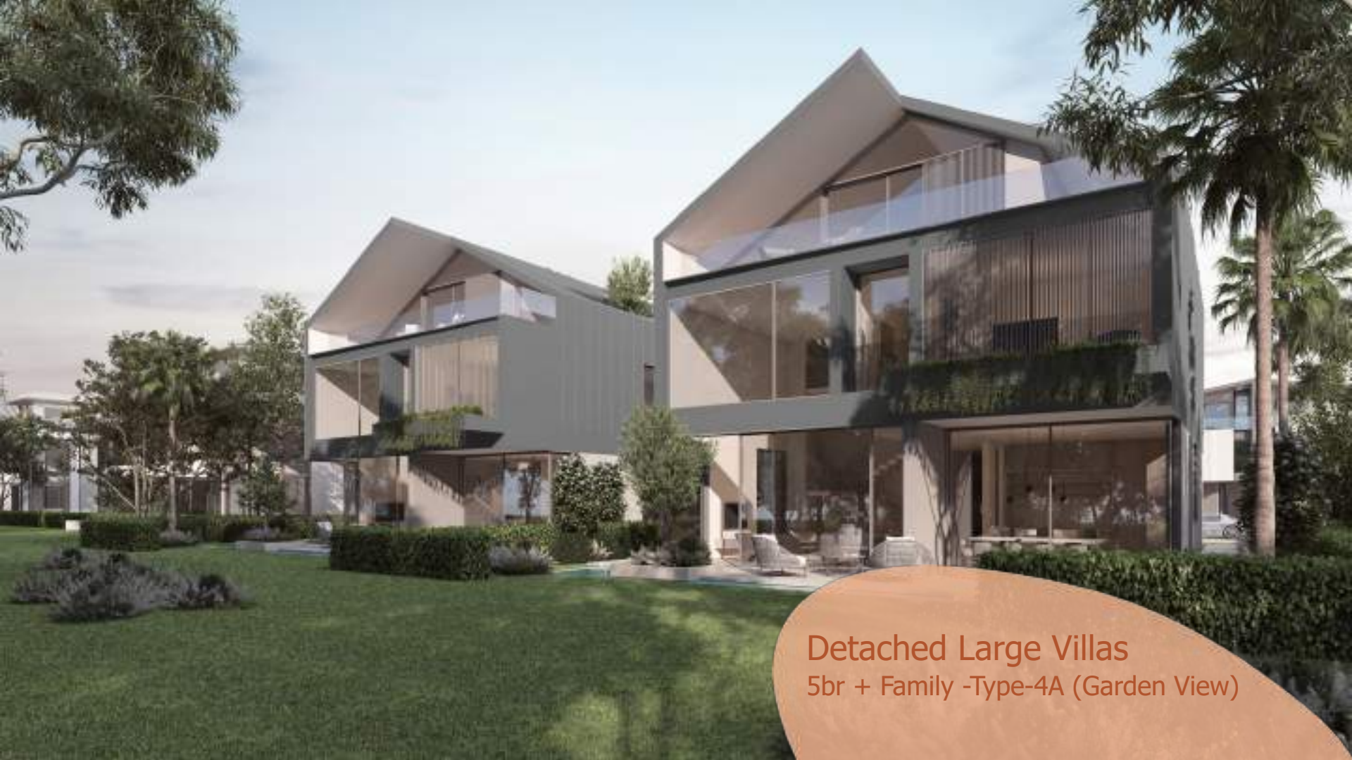
Detached Large Villas 5br + Family -Type-4A (Garden View)