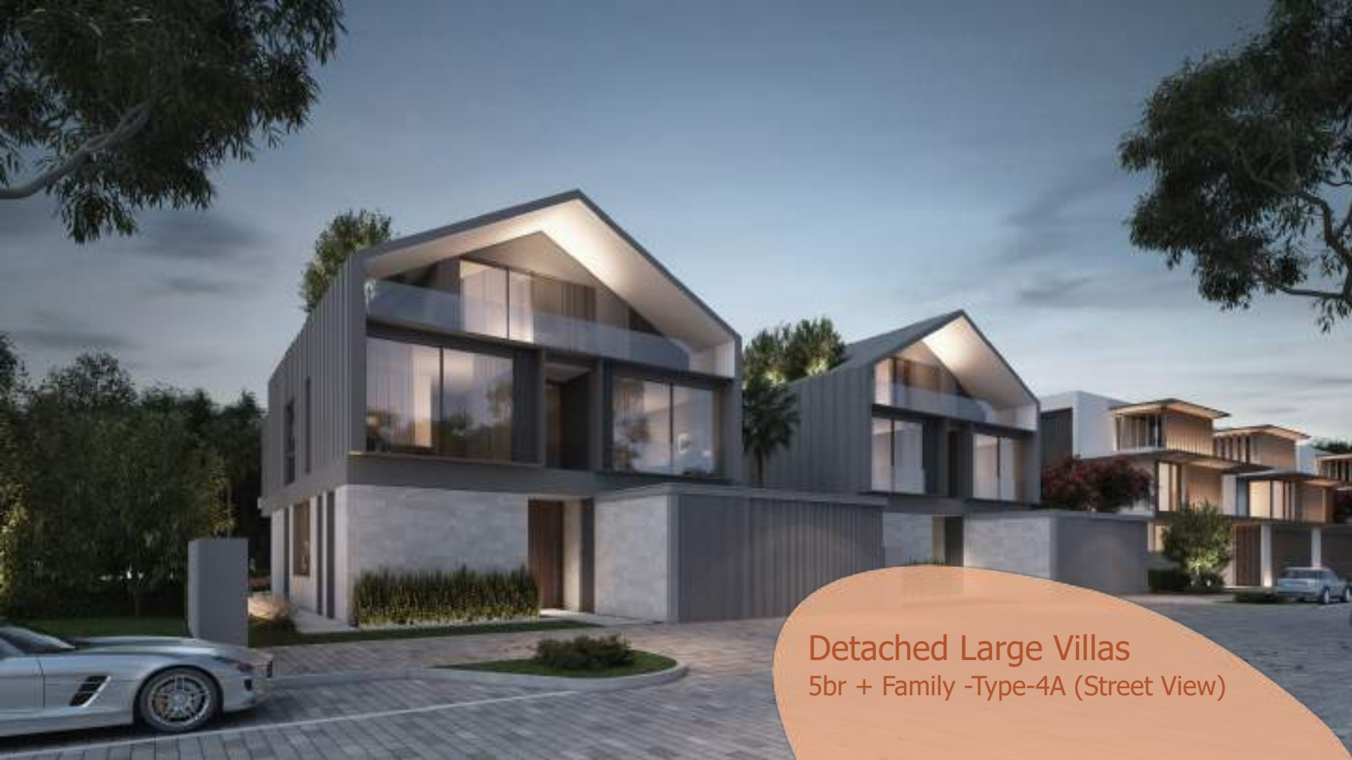
Detached Large Villas 5br + Family -Type-4A (Street View)