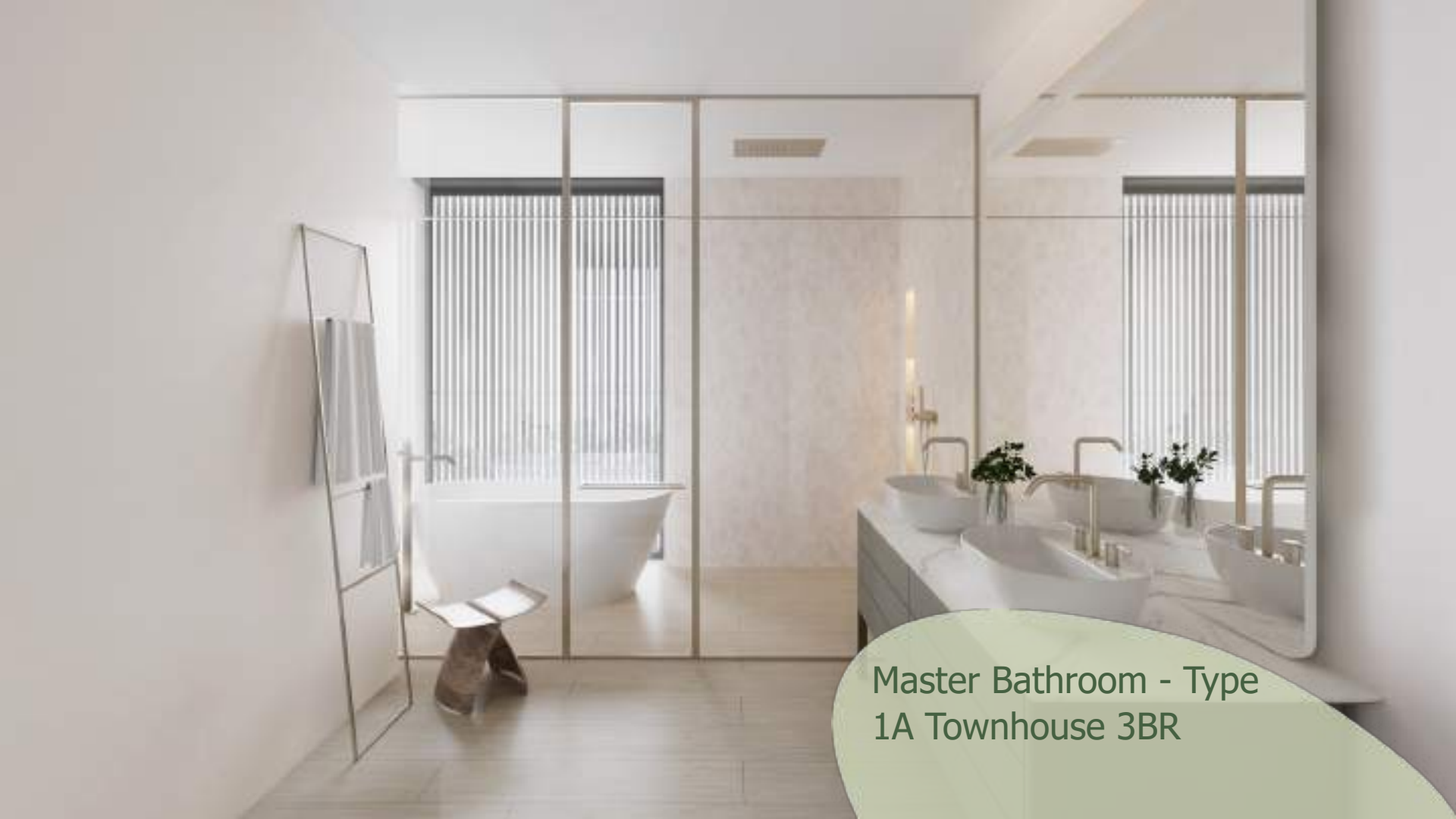
Master Bathroom - Type 1A Townhouse 3BR