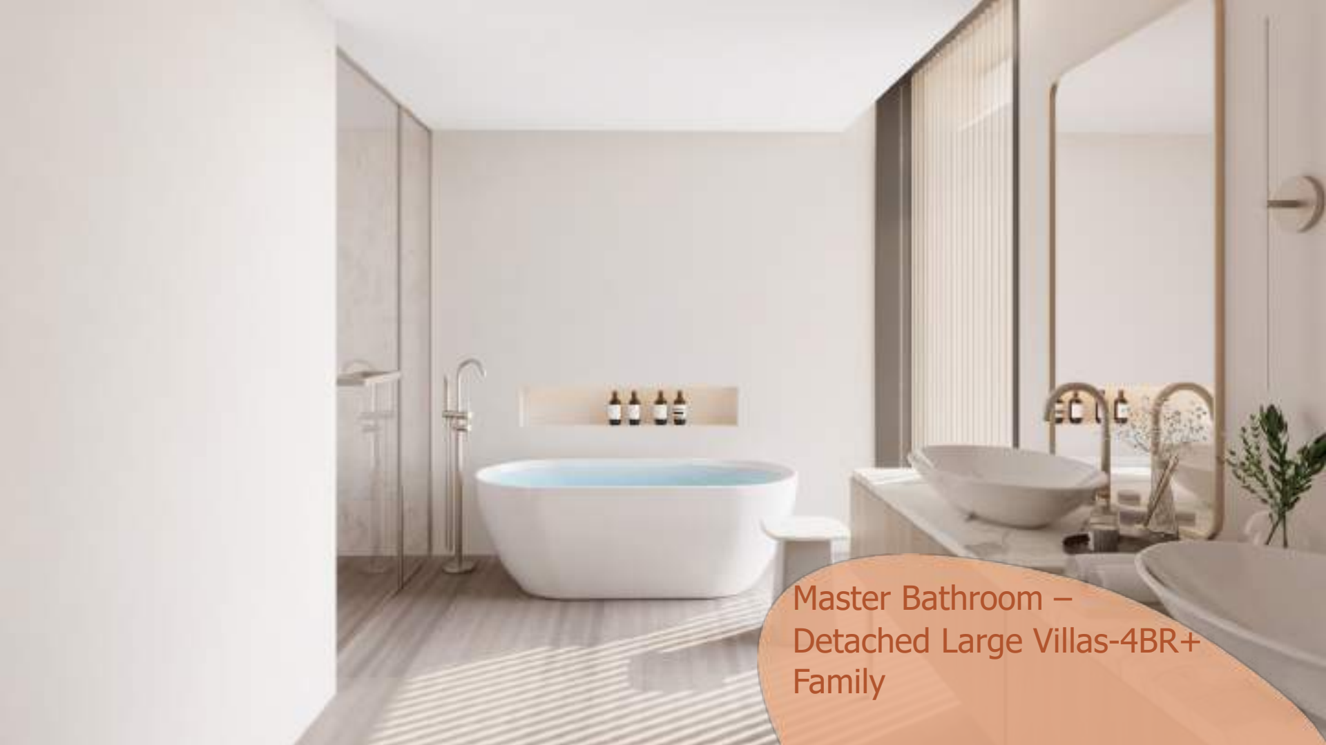
Master Bathroom – Detached Large Villas-4BR+ Family