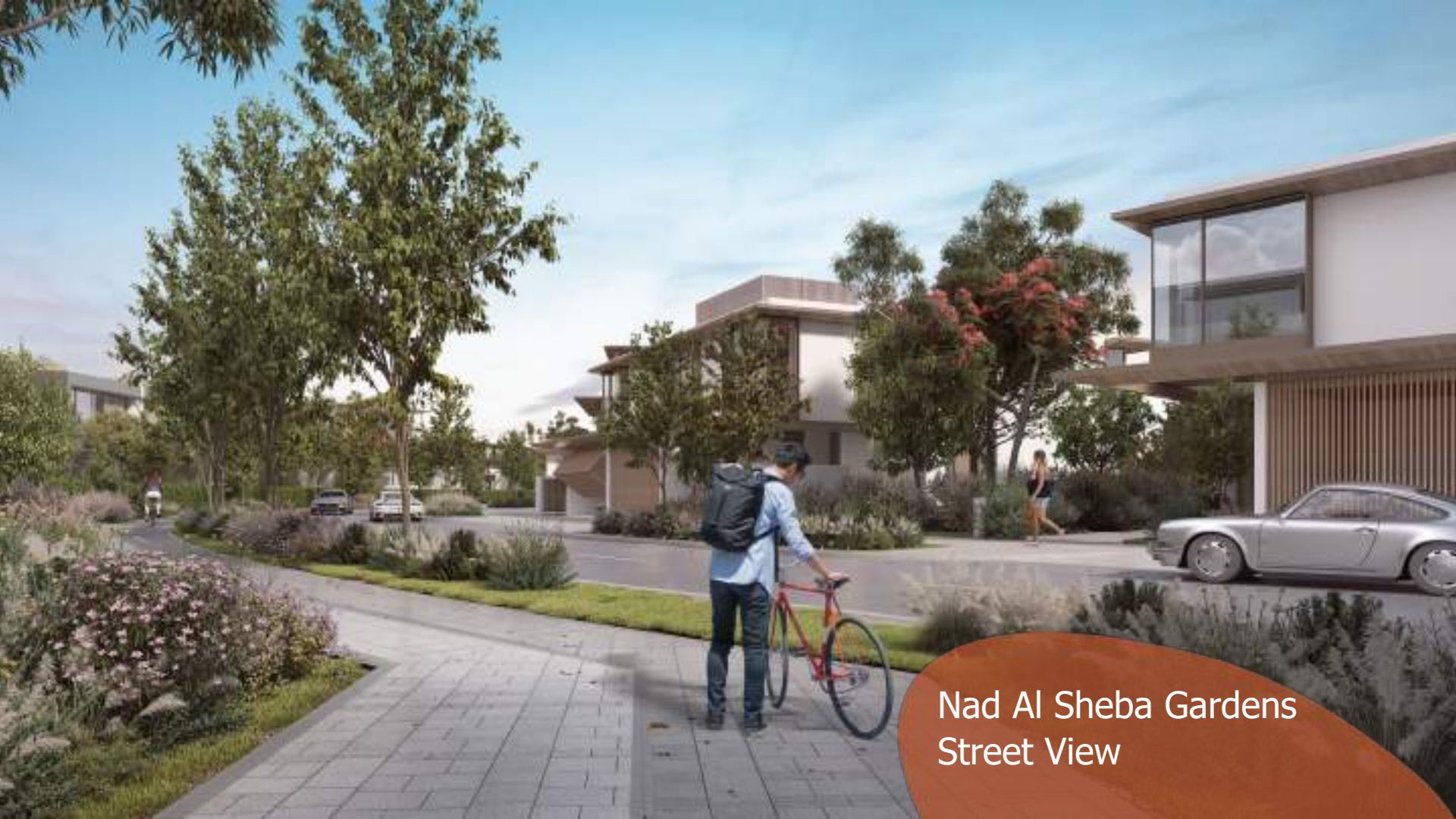
Nad Al Sheba Gardens Street View