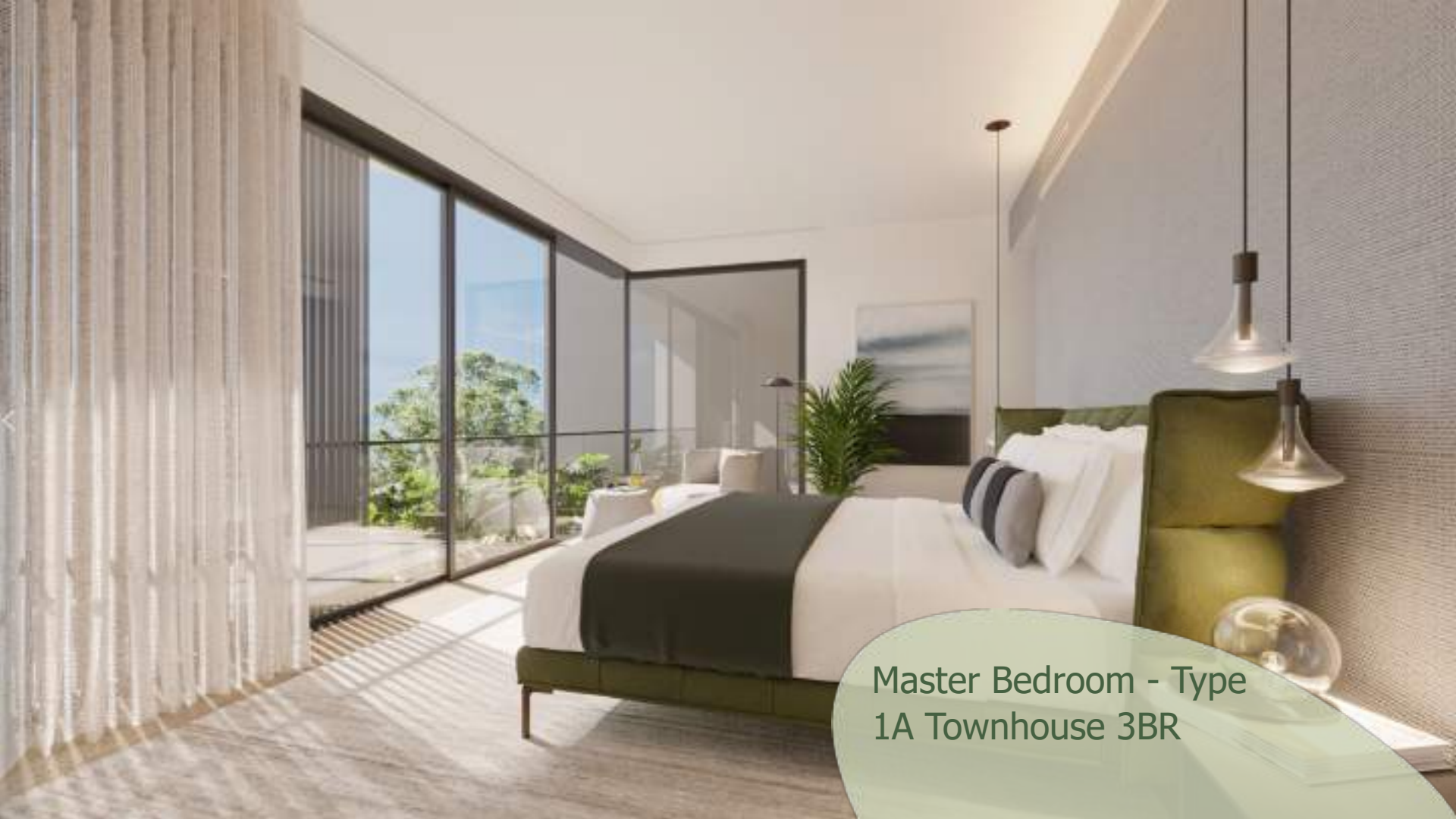
Master Bedroom - Type 1A Townhouse 3BR