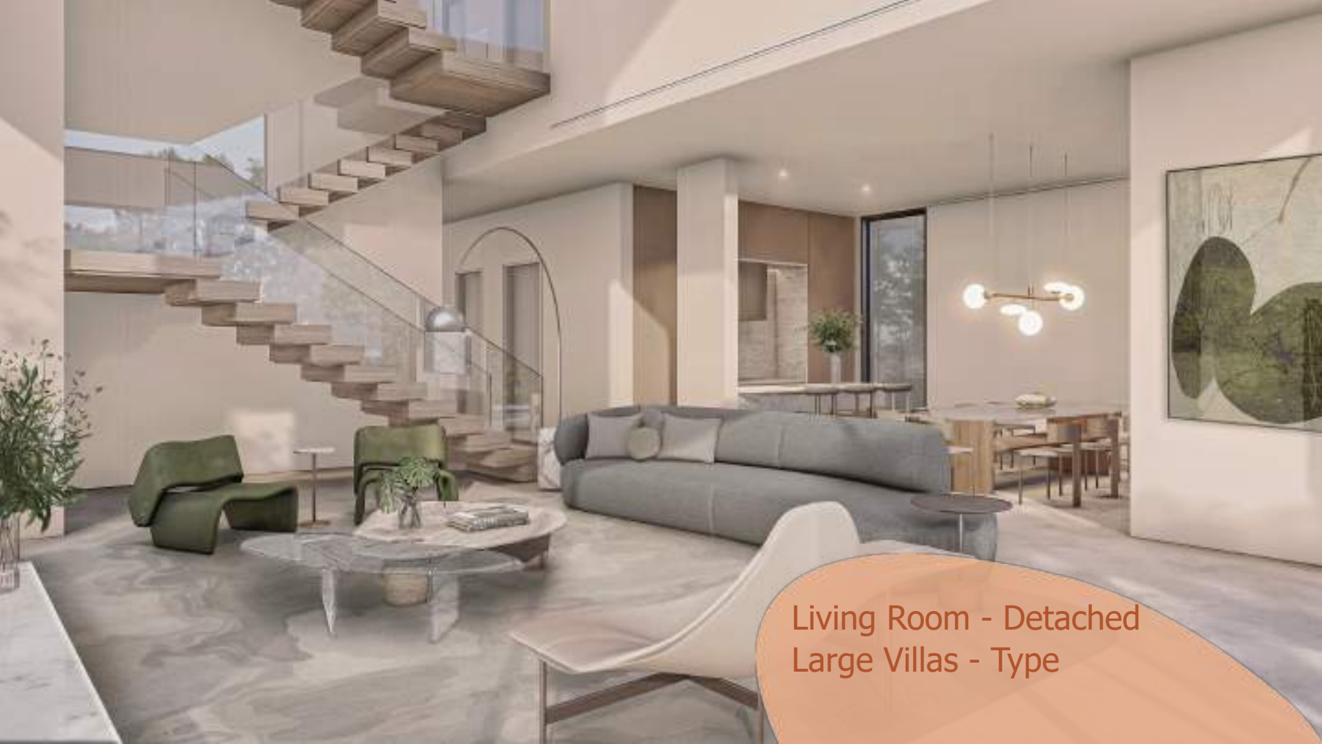
Living Room - Detached Large Villas - Type