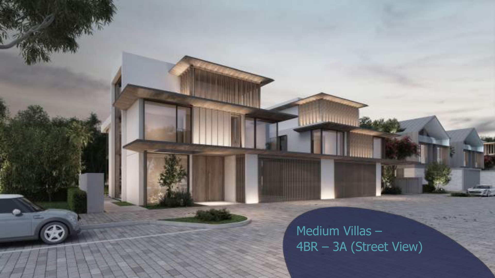
Medium Villas – 4BR – 3A (Street View)