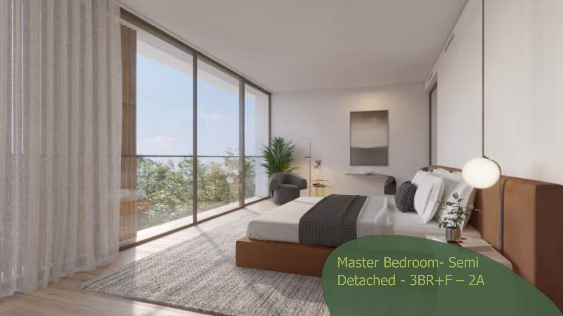
Master Bedroom- Semi Detached - 3BR+F – 2A