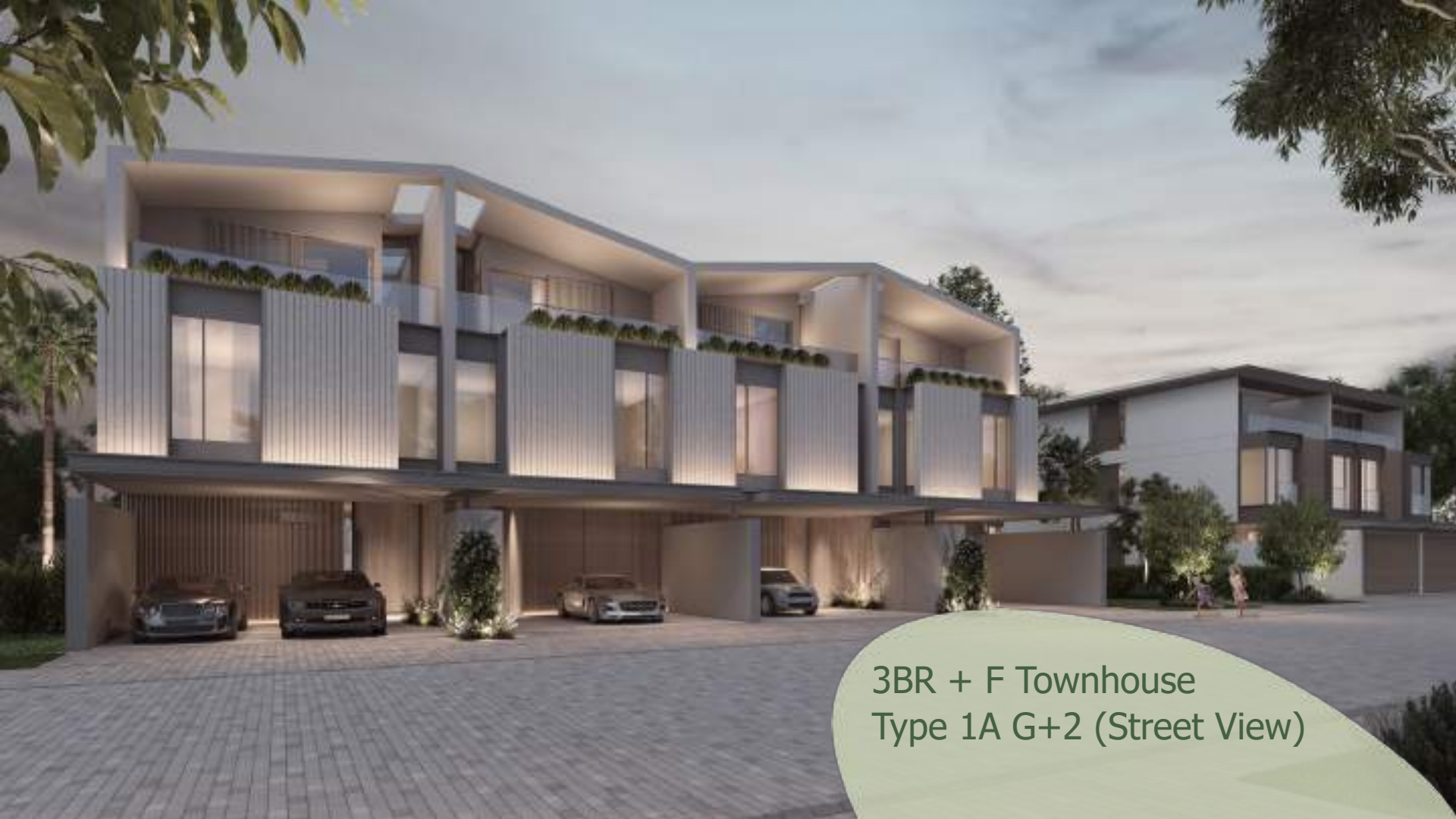
3BR + F Townhouse Type 1A G+2 (Street View)