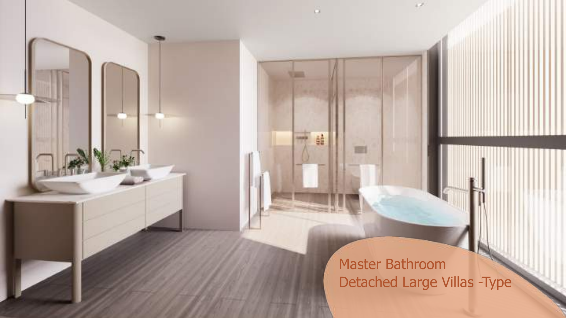
Master Bathroom Detached Large Villas -Type