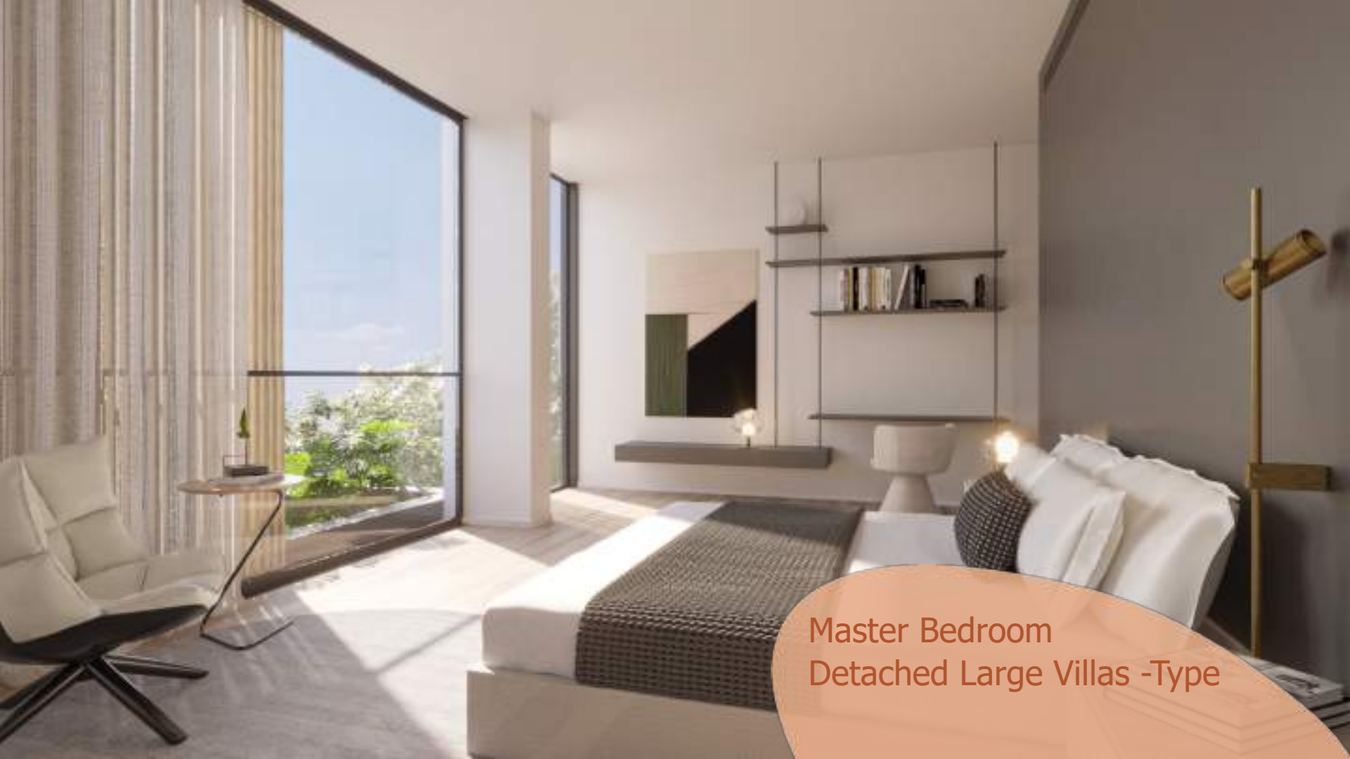
Master Bedroom Detached Large Villas -Type