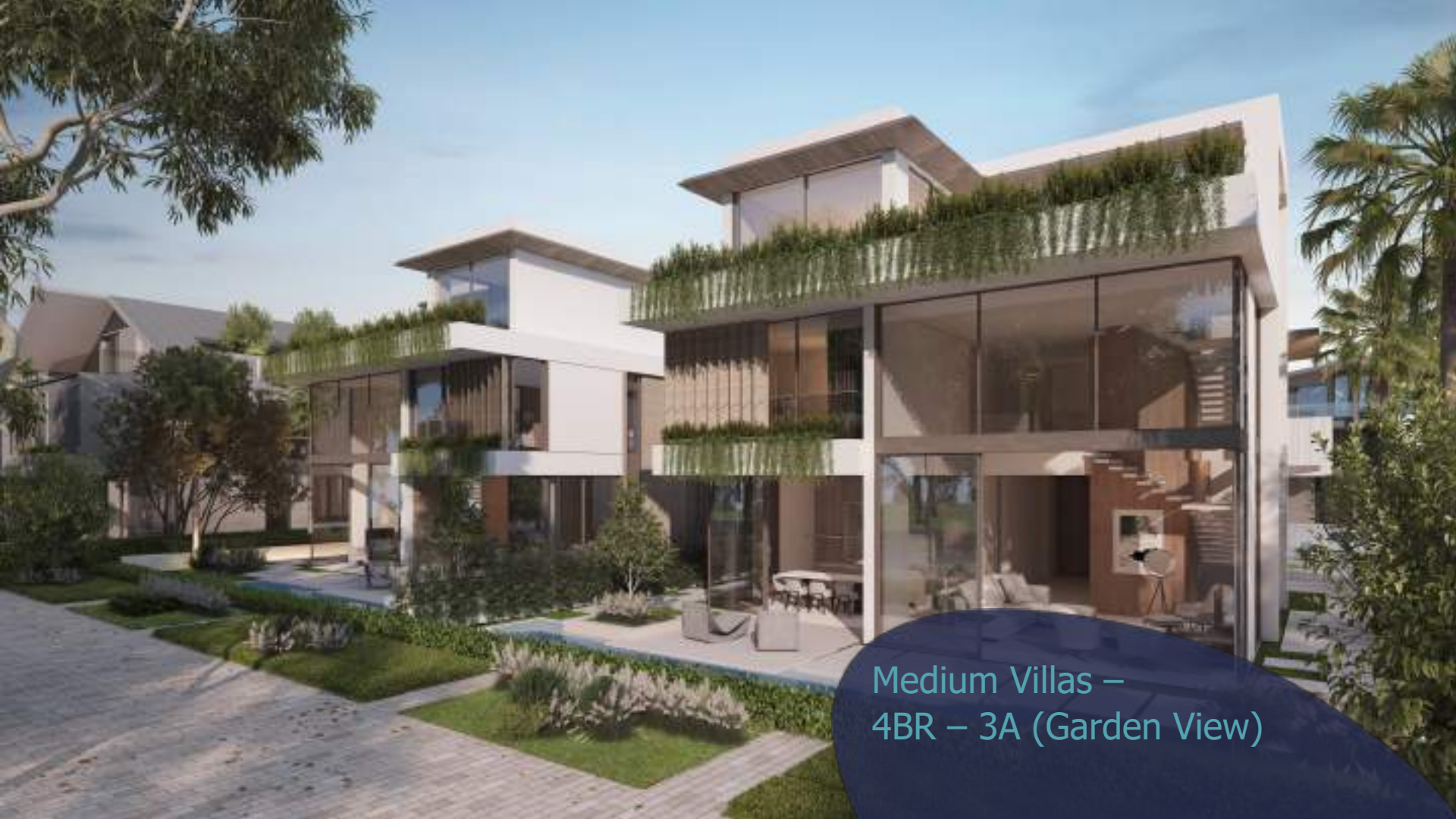
Medium Villas – 4BR – 3A (Garden View)