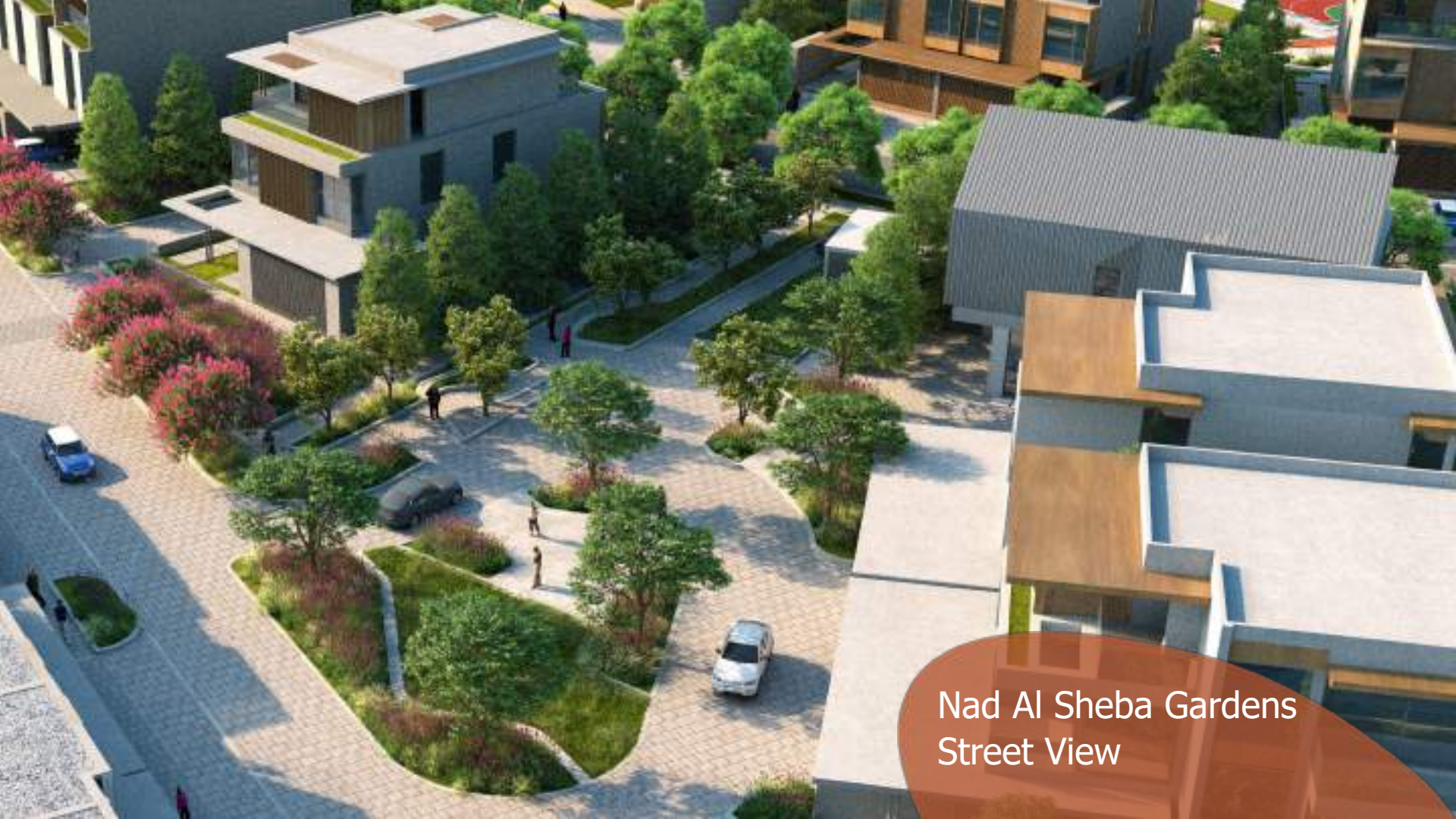
Nad Al Sheba Gardens Street View