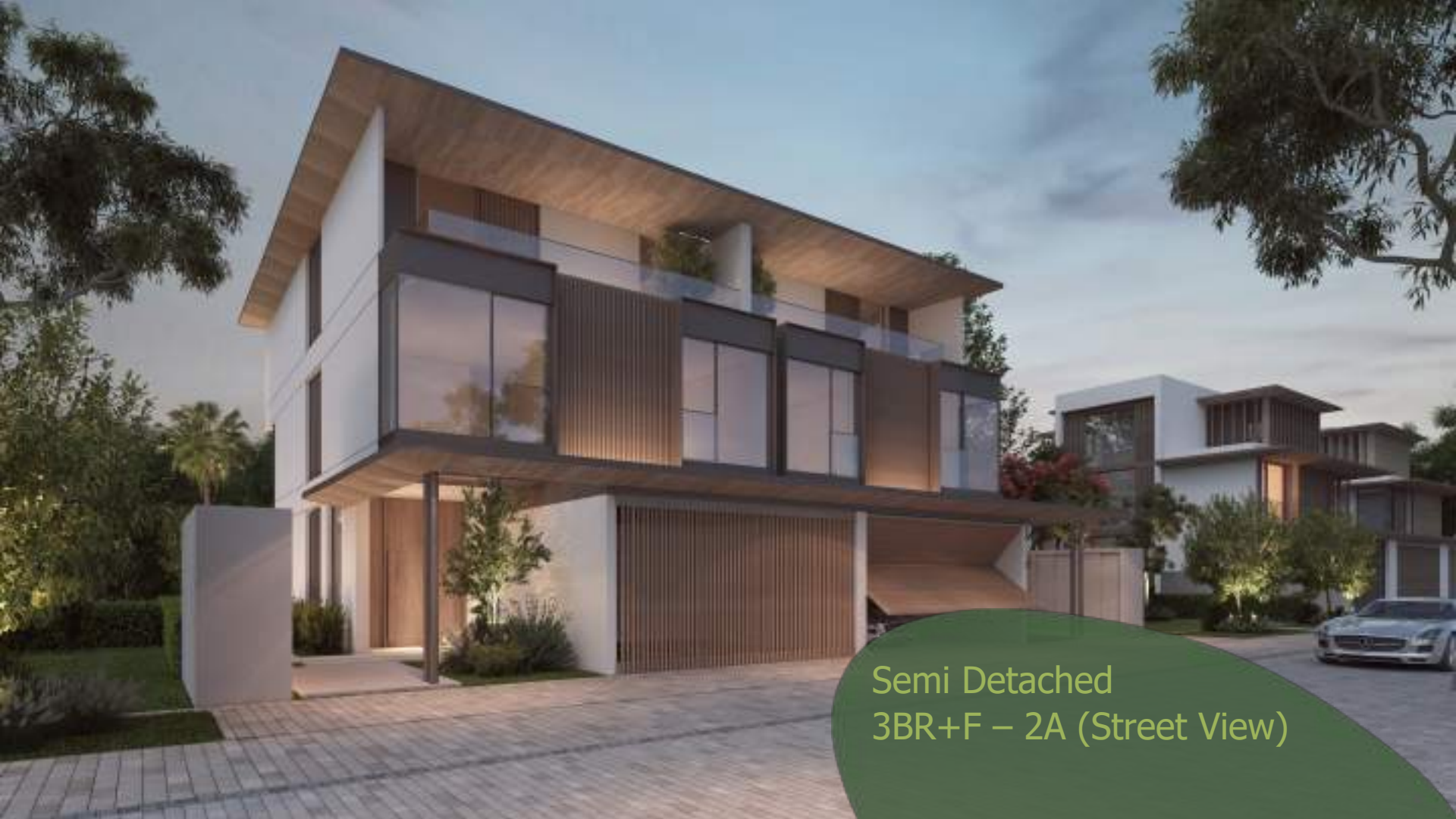
Semi Detached 3BR+F – 2A (Street View)