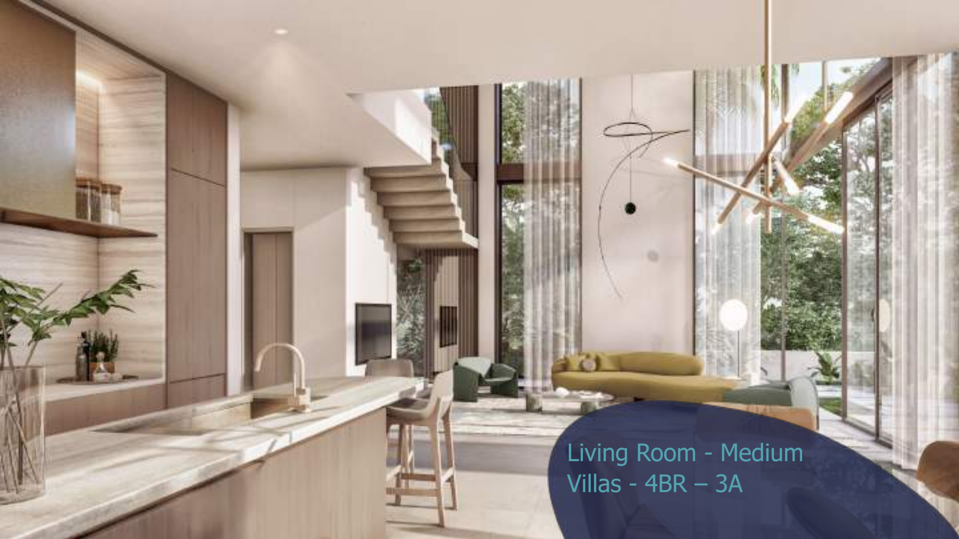
Living Room - Medium Villas - 4BR - 3A