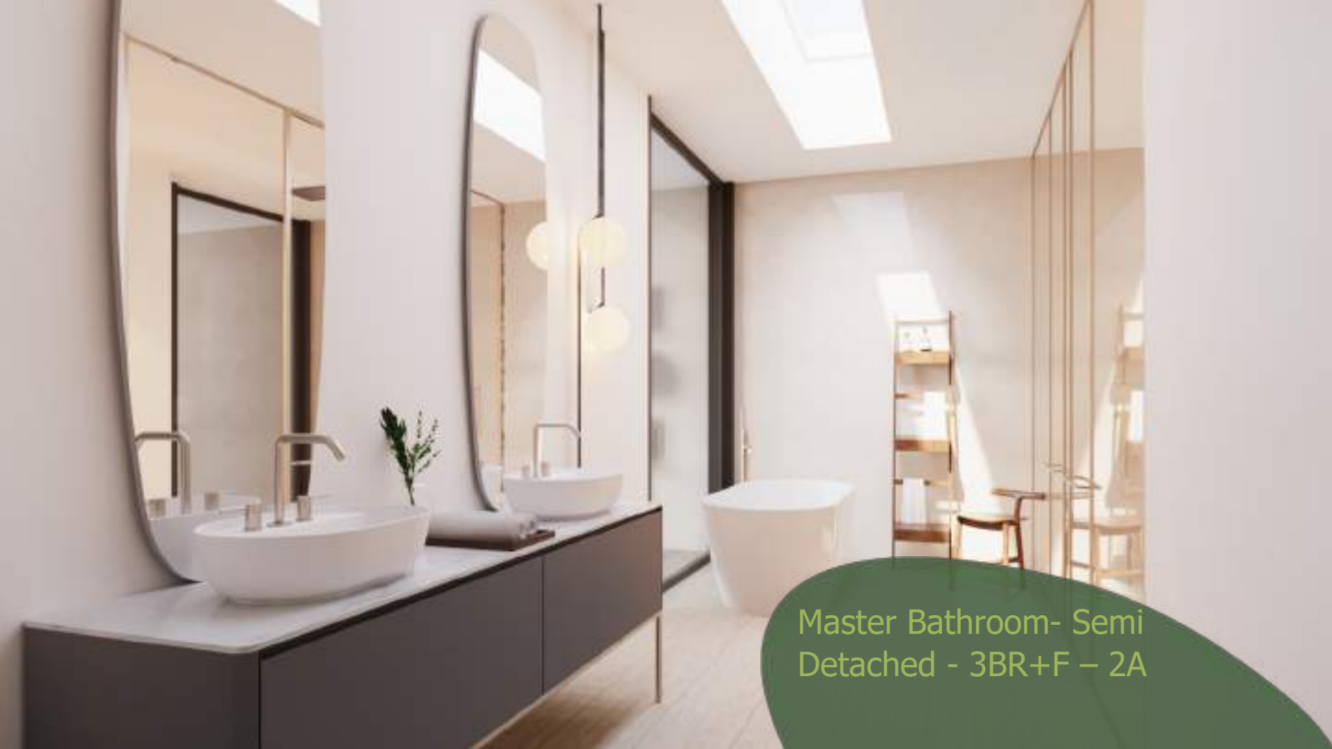
Master Bathroom- Semi Detached - 3BR+F - 2A