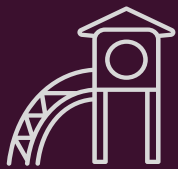
Kids Play Areas