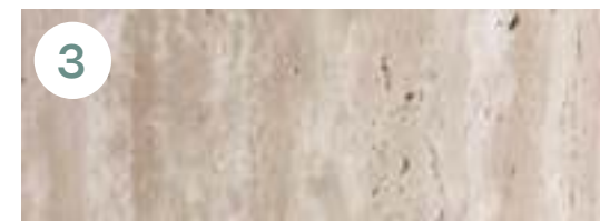
3 Travertine Classico Romano