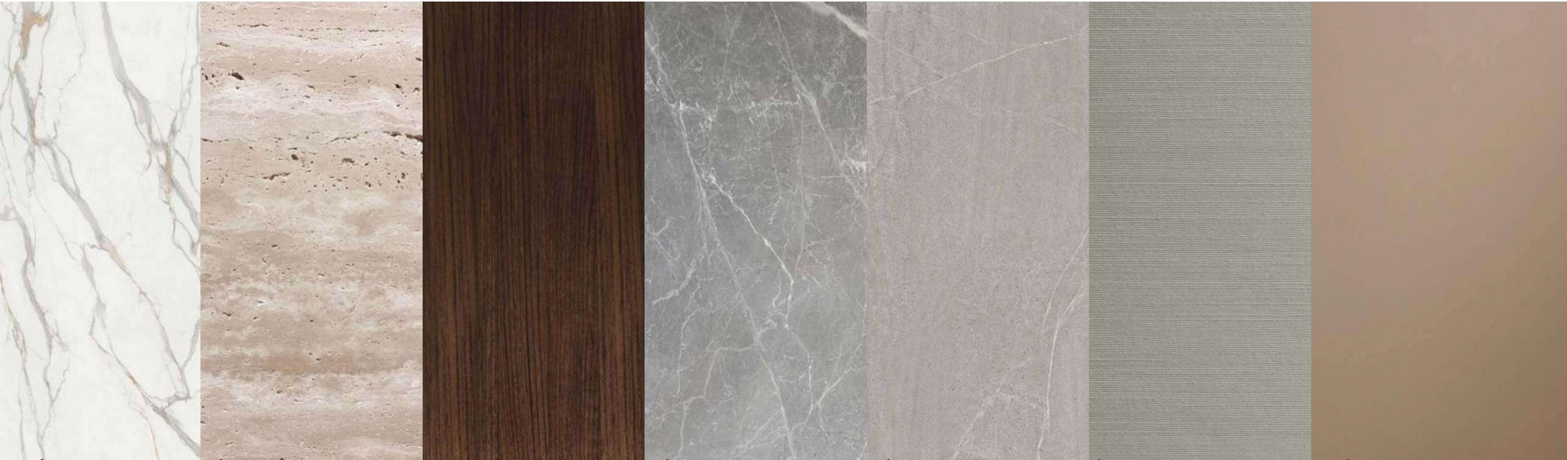
1 Calacatta Oro