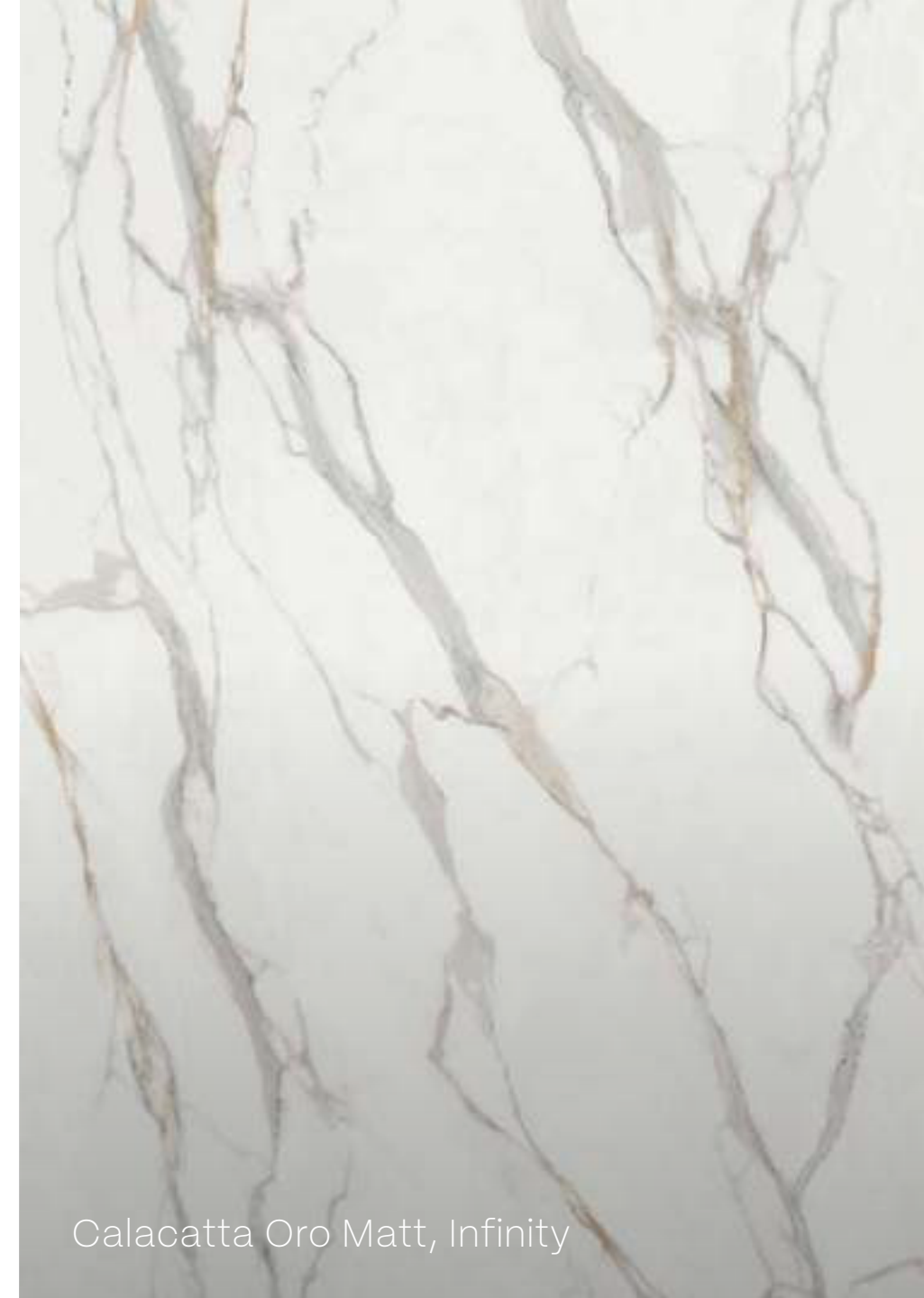
Calacatta Oro Matt, Infinity