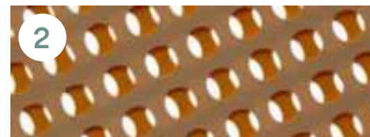
2 Perforated Metal Screen