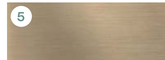
5 Metallic Bronze