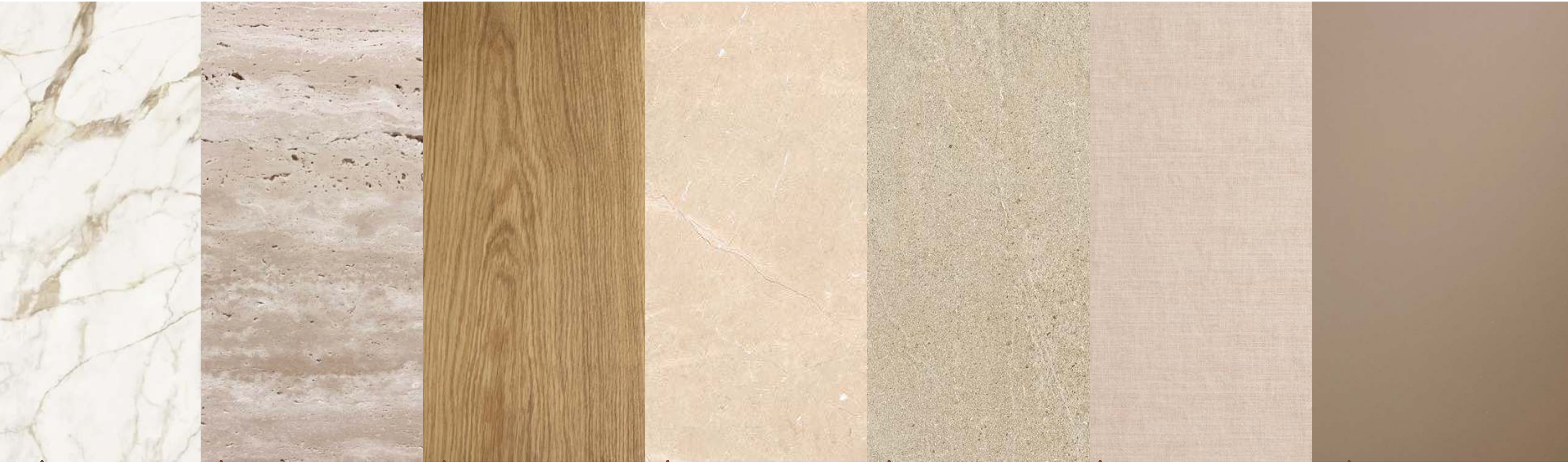
1 Calacatta Gold