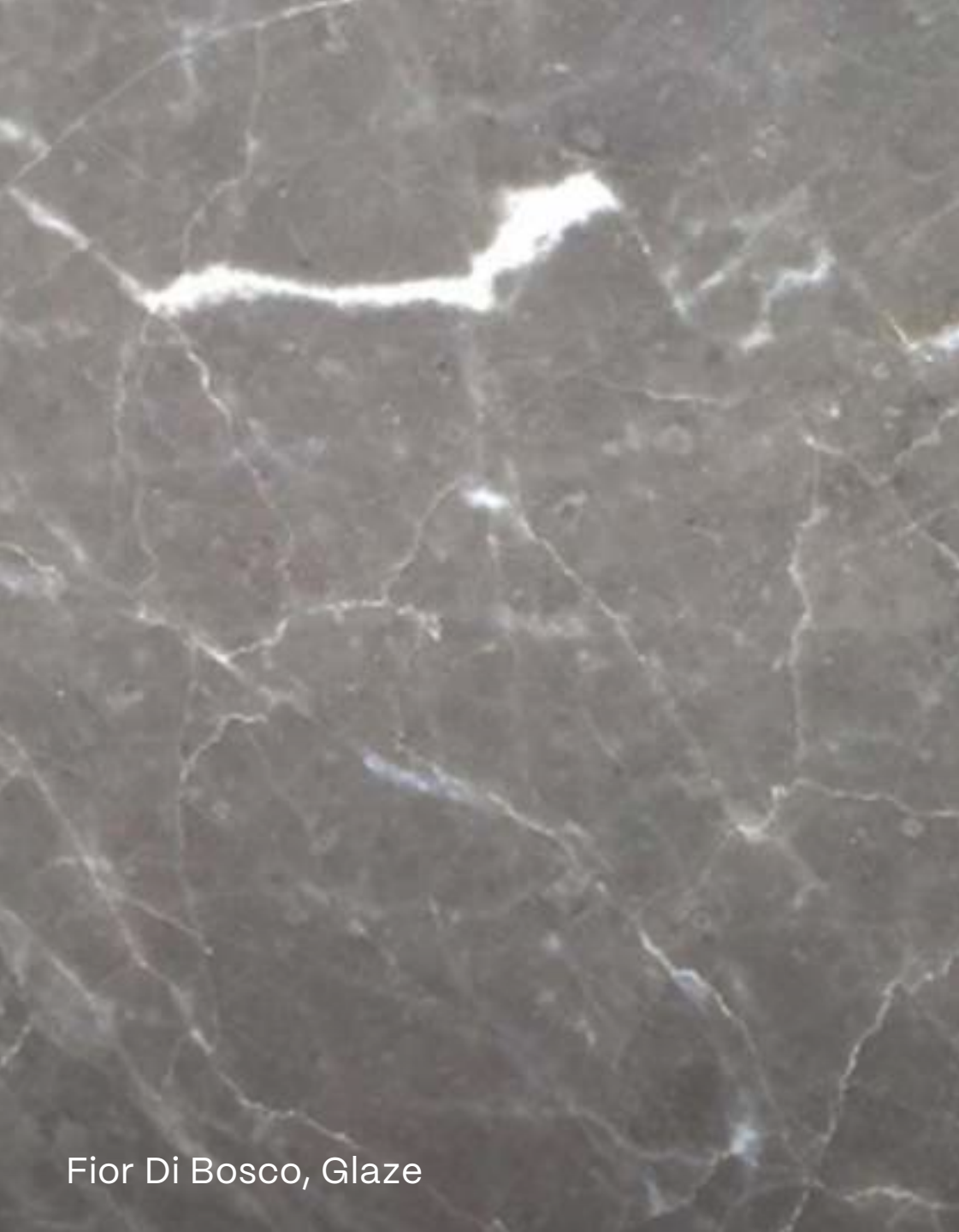
Fior Di Bosco, Glaze