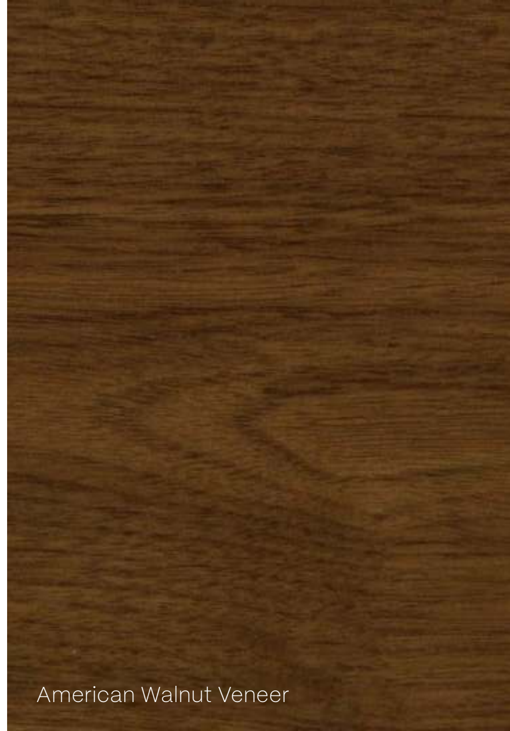
American Walnut Veneer