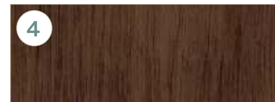
4 Wood Finish Cladding & Door