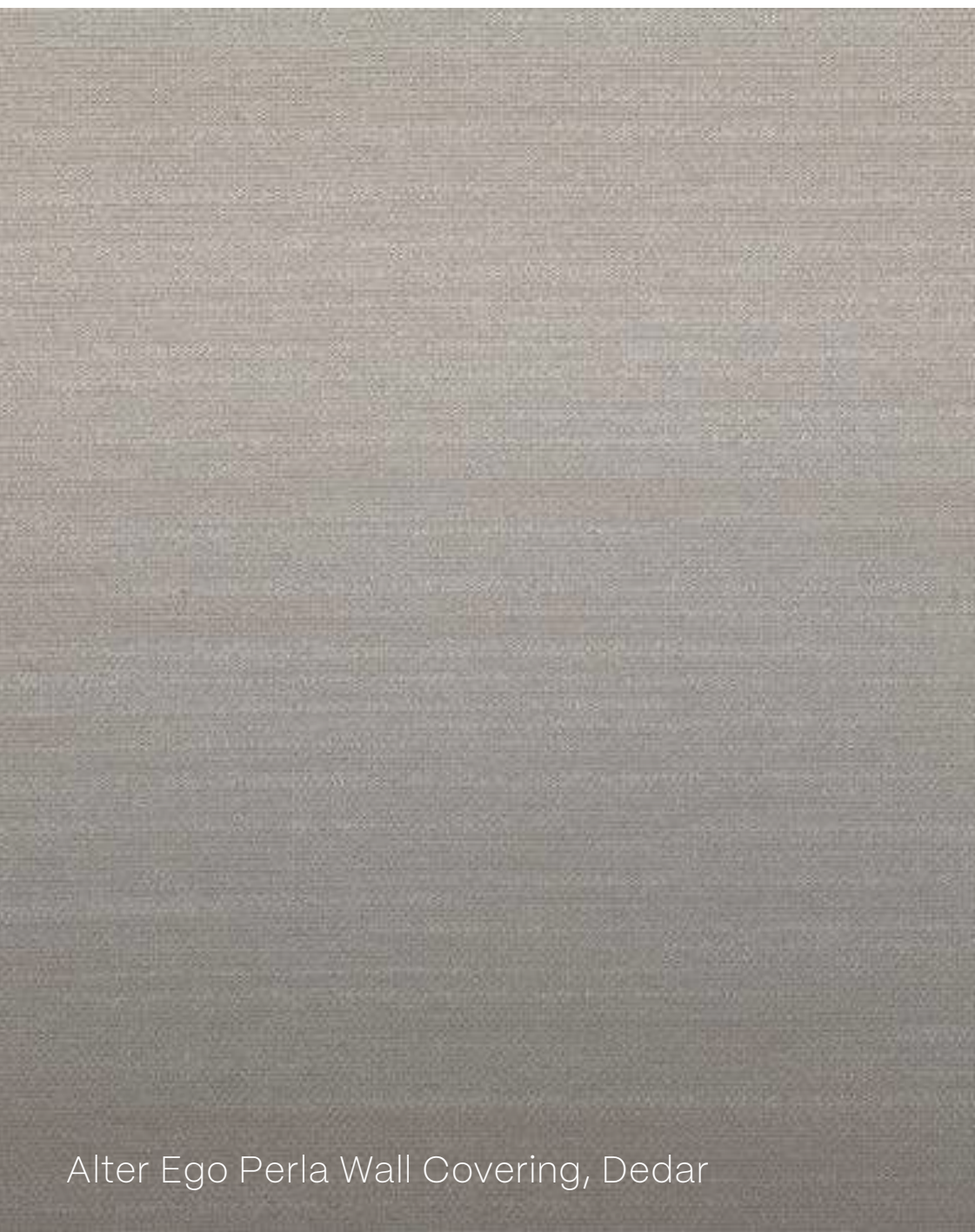
Alter Ego Perla Wall Covering, Dedar