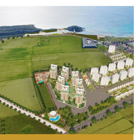
24/7 gated security