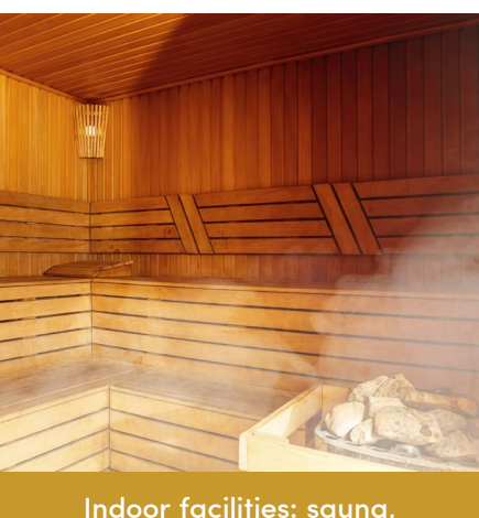
hammam, jacuzzi, heated pool