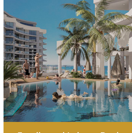
Family and Leisure Pool