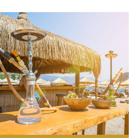
Shisha lounge & bar