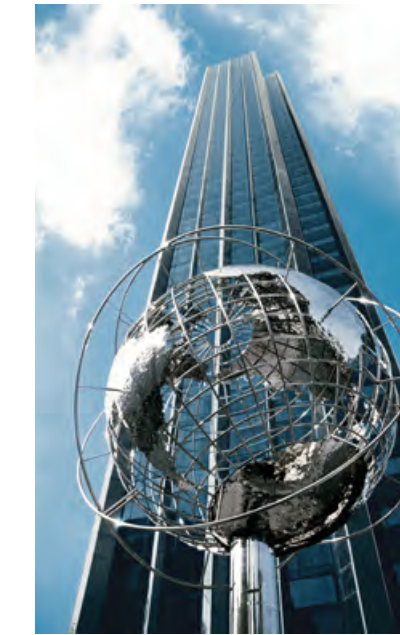
TRUMP INTERNATIONAL HOTEL & TOWER, NEW YORK