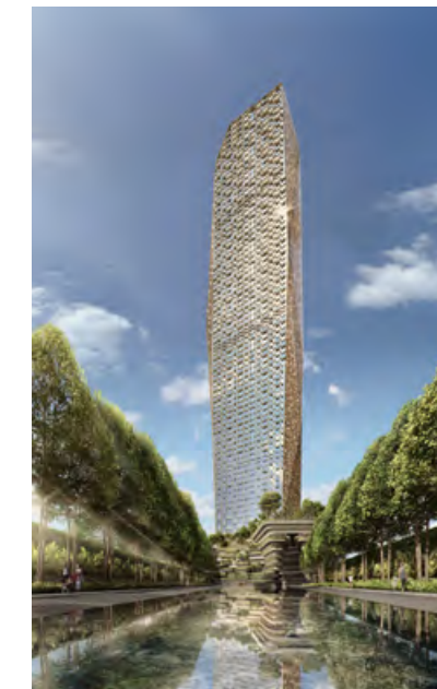
TRUMP TOWER MUMBAI, INDIA