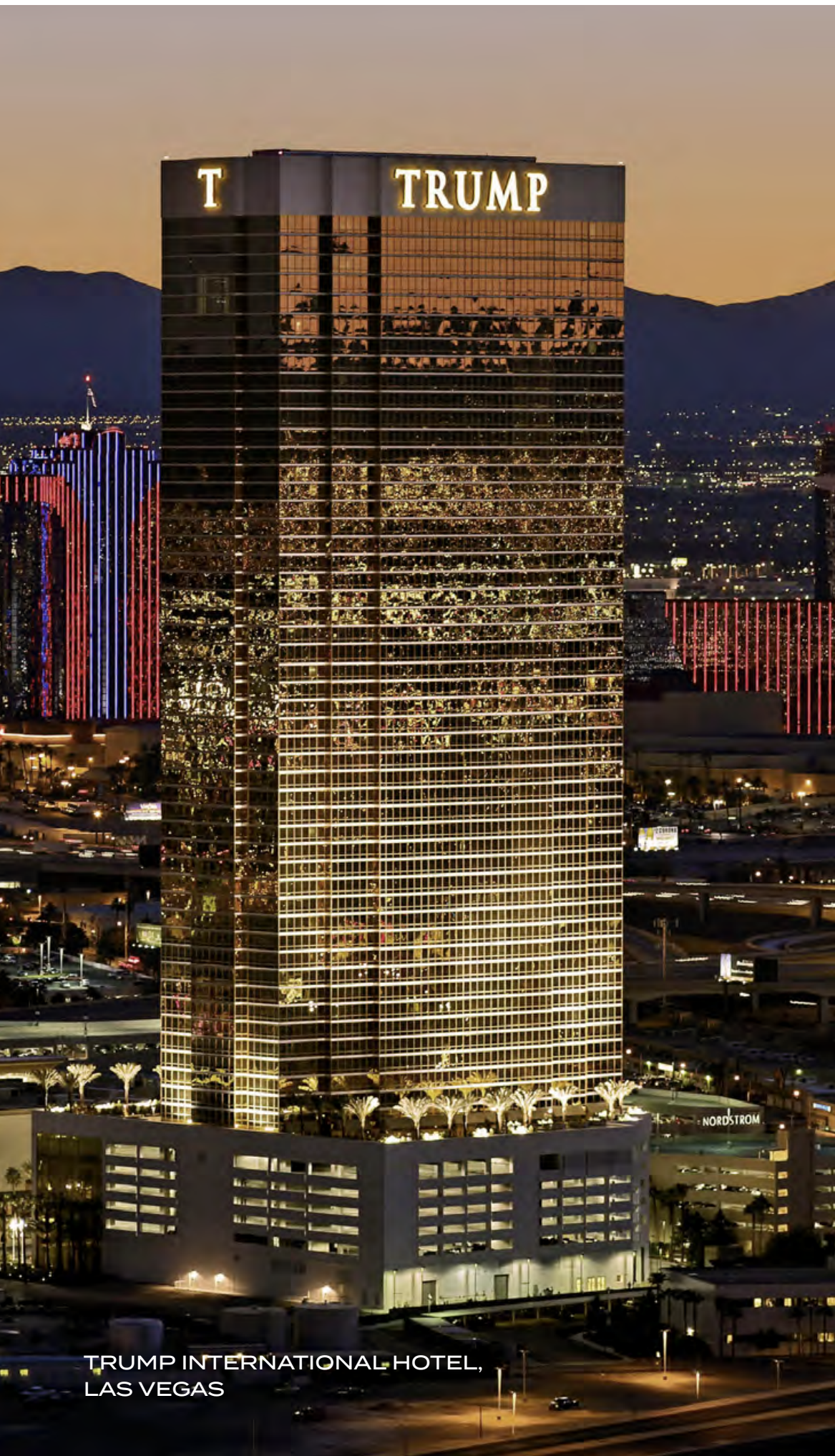
TRUMP INTERNATIONAL HOTEL, LAS VEGAS