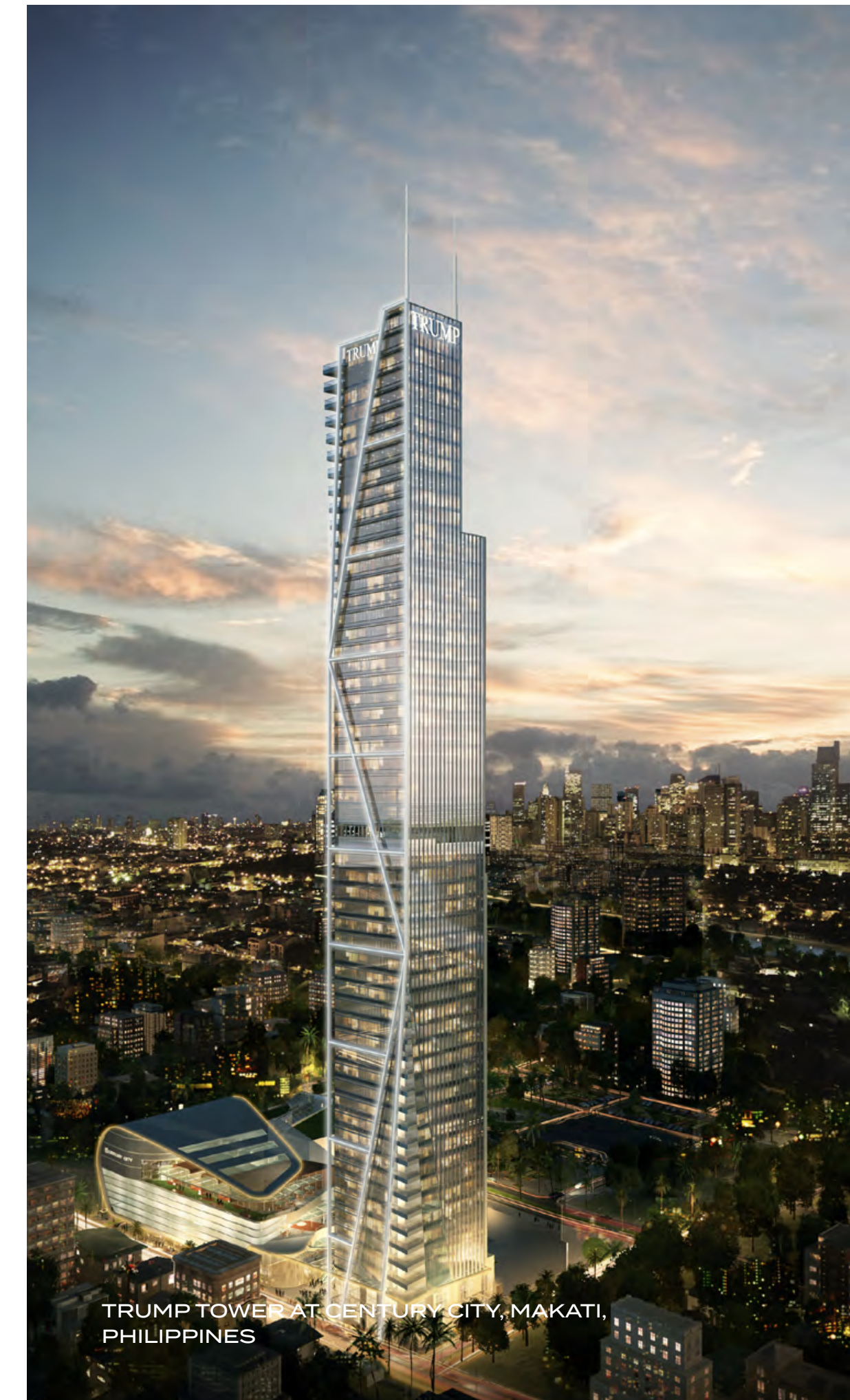
TRUMP TOWER AT CENTURY CITY, MAKATI, PHILIPPINES