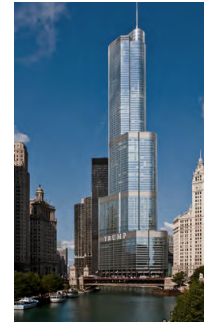
TRUMP INTERNATIONAL HOTEL & TOWER CHICAGO

Virtually no detail is overlooked. With each of its properties, Trump consistently continues to raise the bar for luxury living.