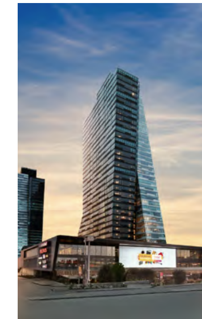
TRUMP TOWER ISTANBUL, TURKEY