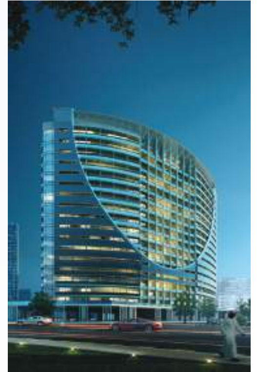
The V Tower