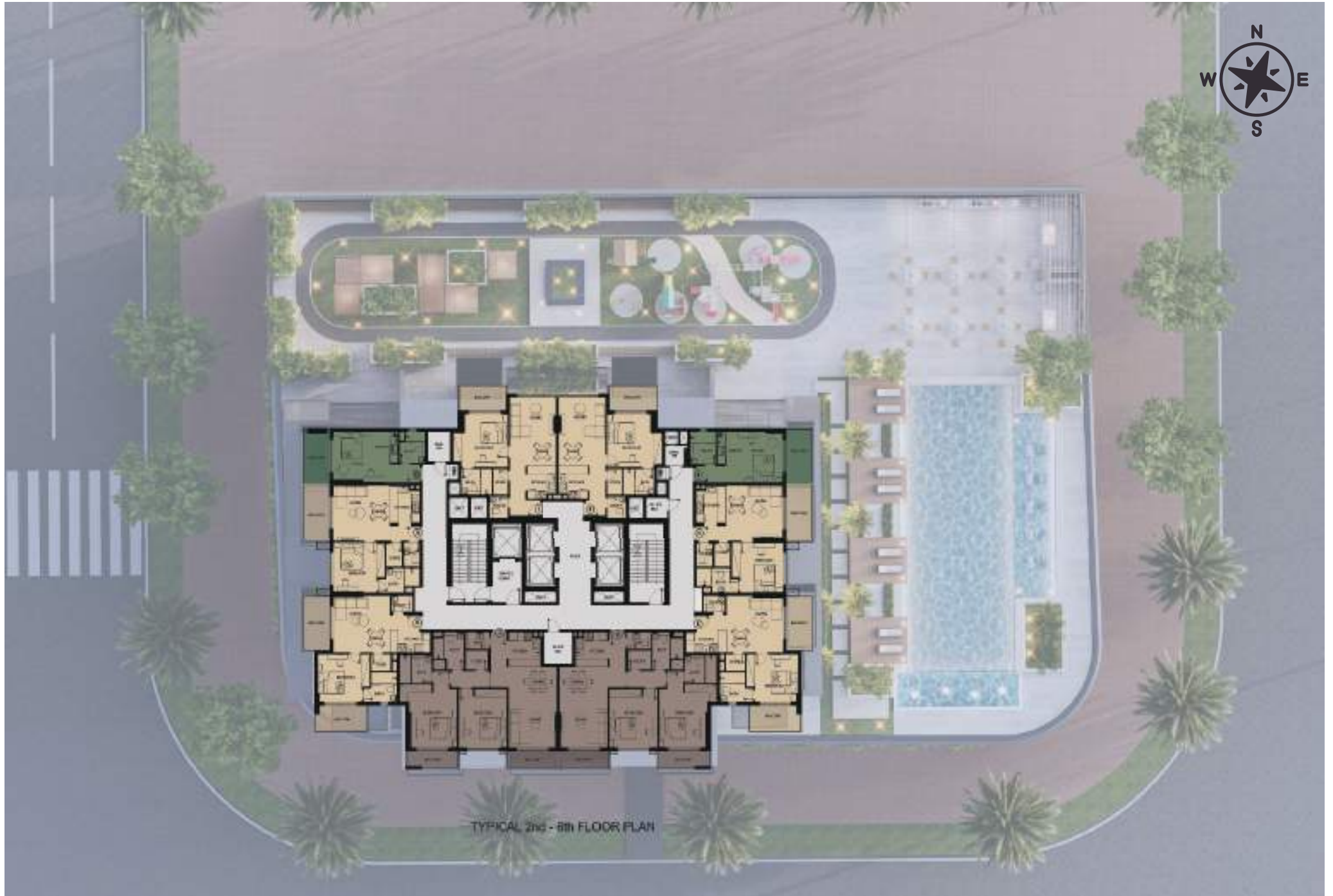
TYPICAL 2nd - 8th FLOOR PLAN