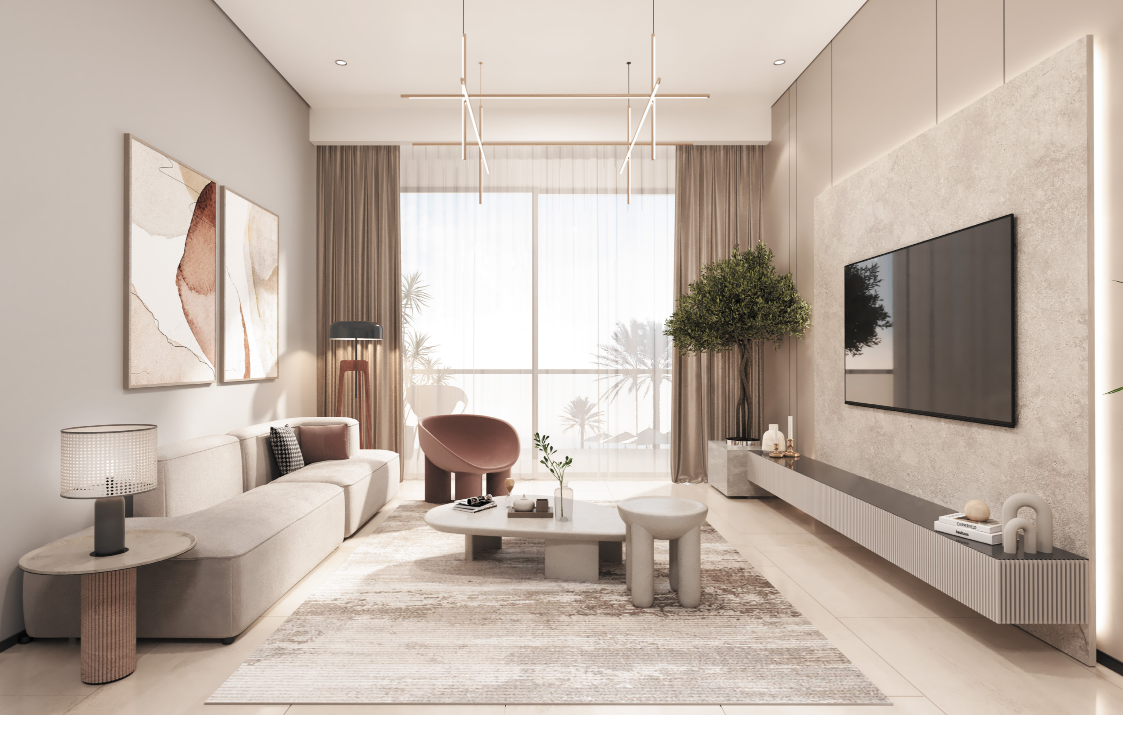
AN AURA OF OPULENCE