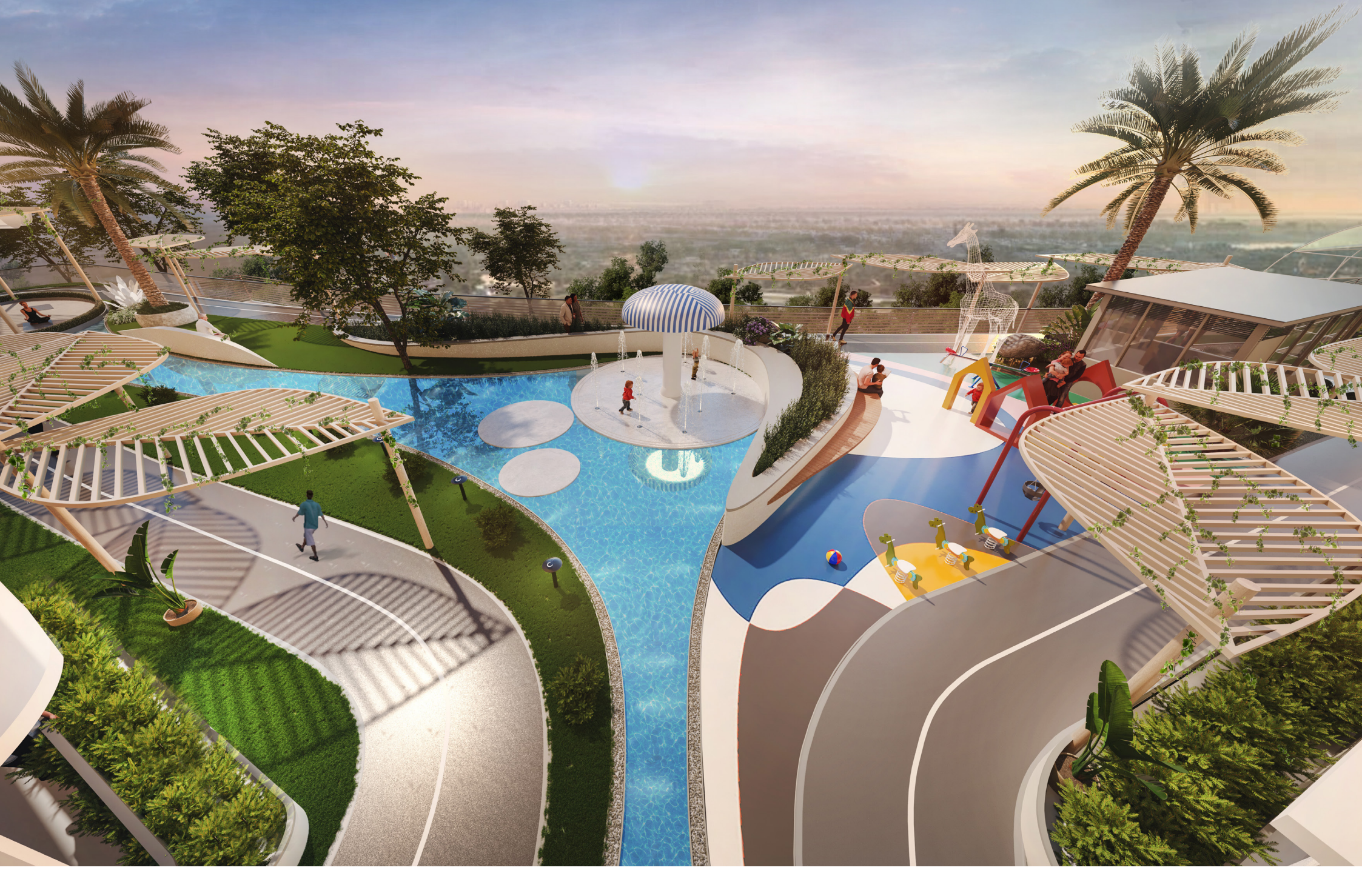
HUES OF BLUES