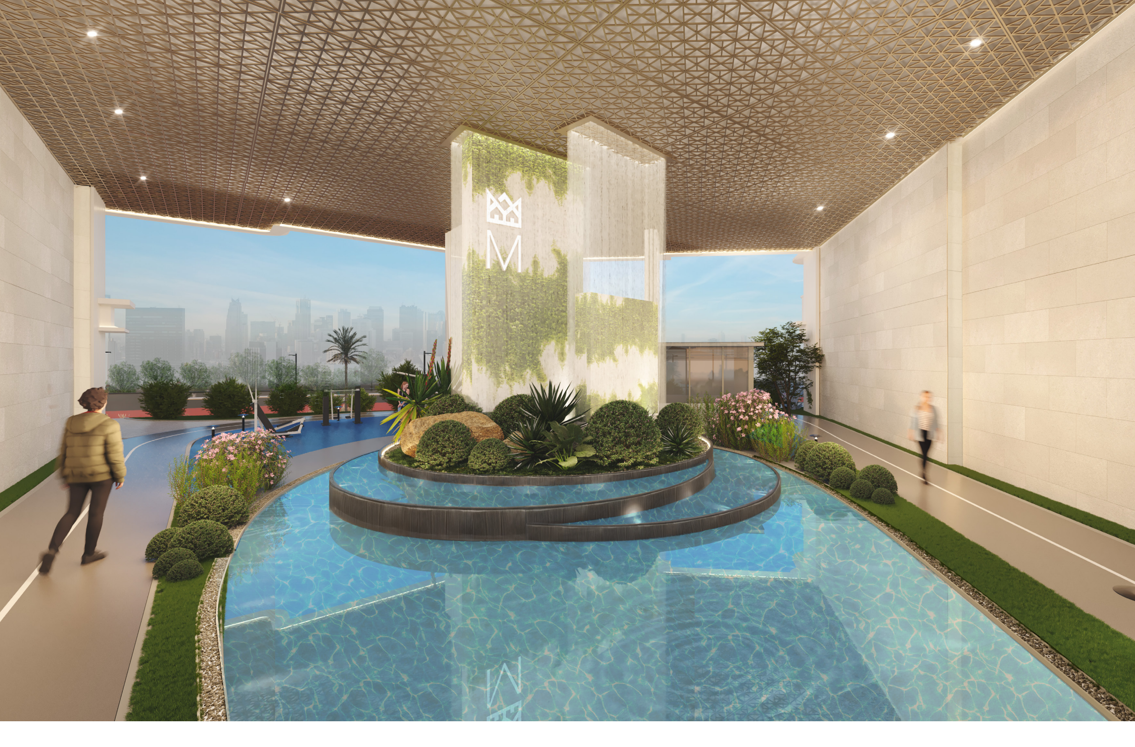
A SPIRITUAL FLOW