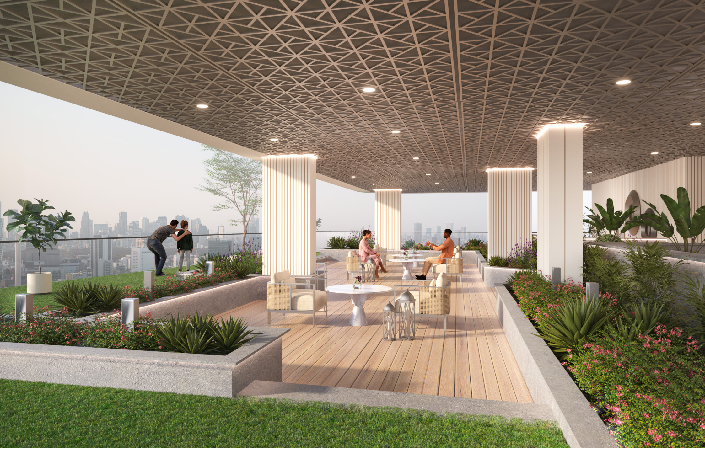
A TAPESTRY OF MEMORIES