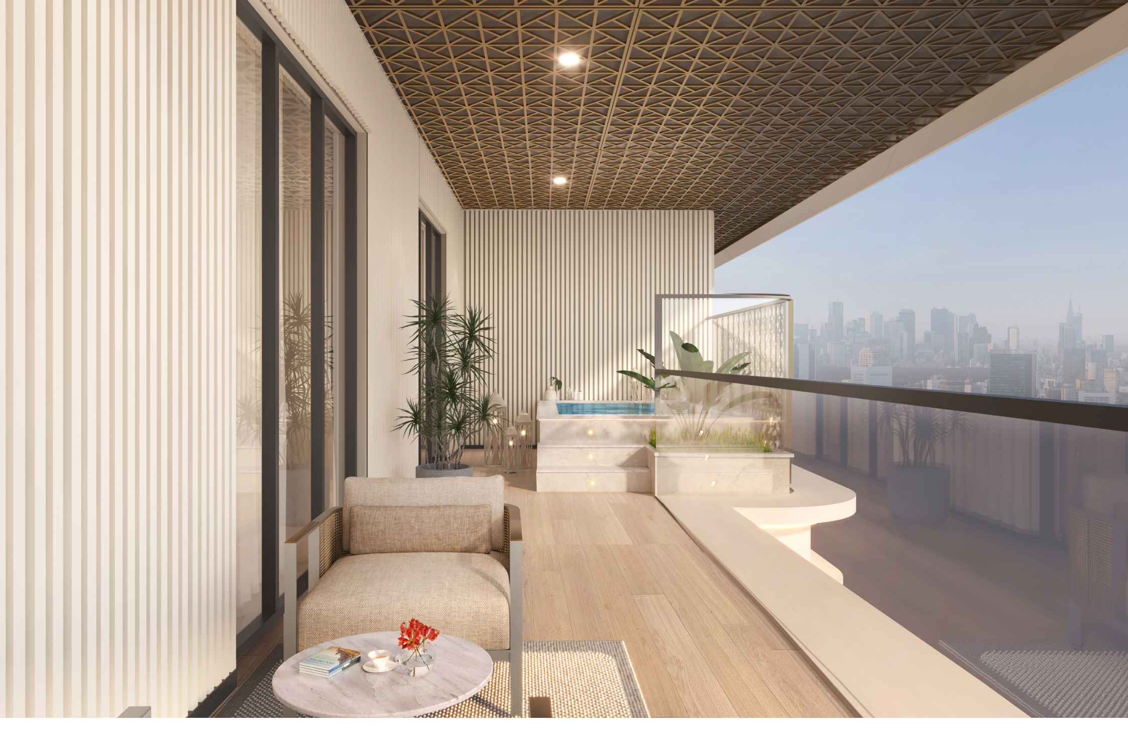
AN ESCAPE TO TRANQUILITY