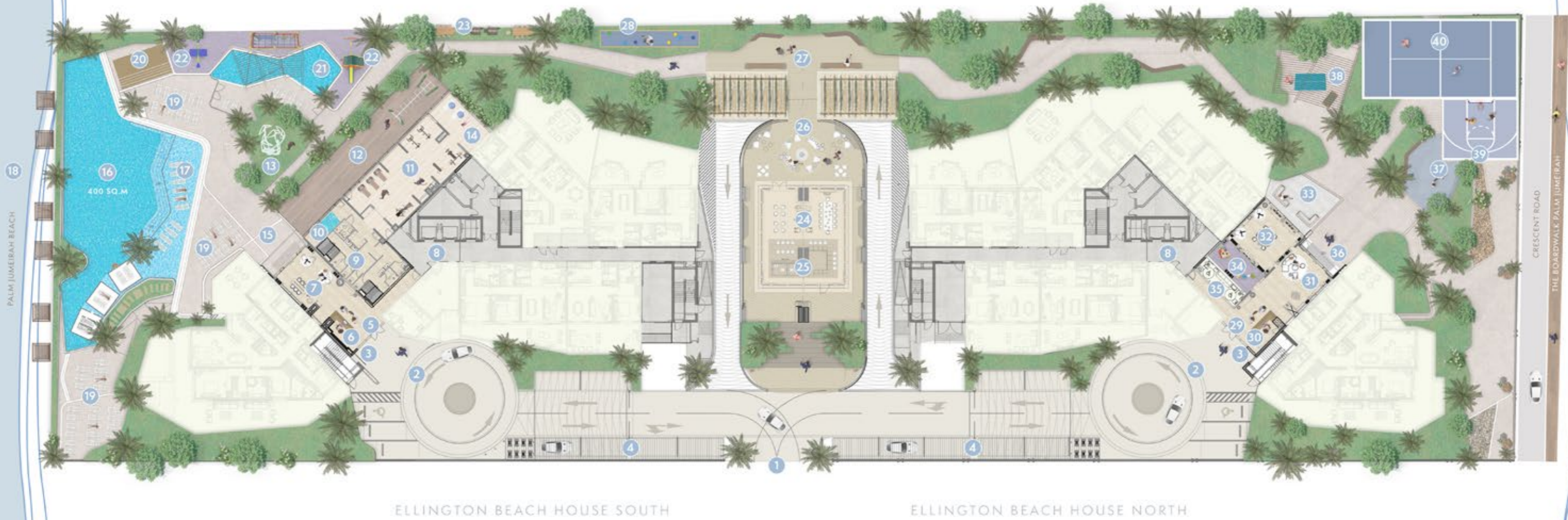
ELLINGTON BEACH HOUSE SOUTH