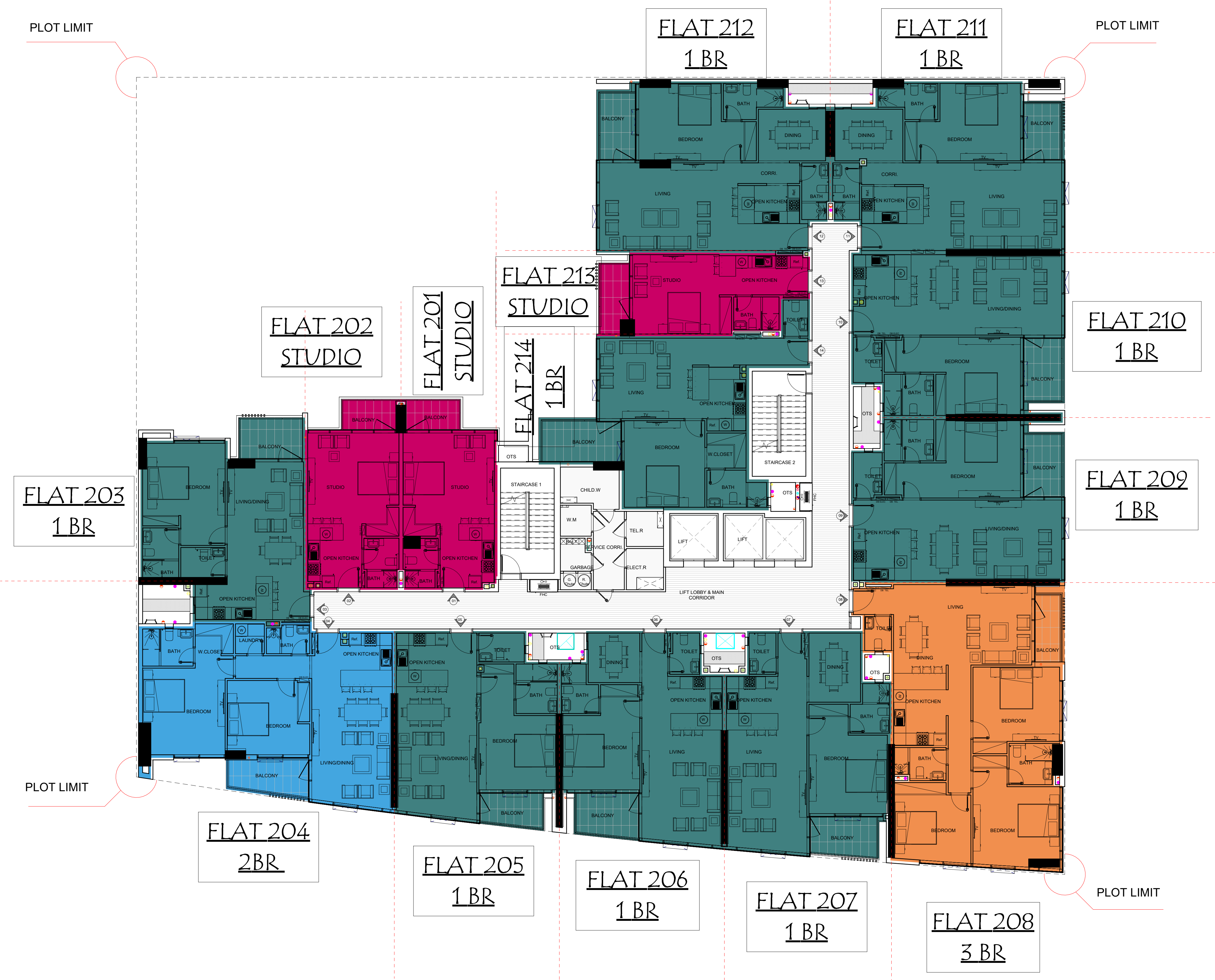
① Typical 2nd TO 10TH Floor PLAN