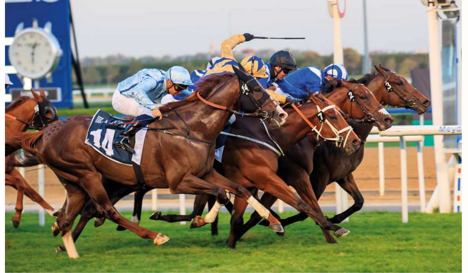
DUBAI RACING CLUB - MEYDAN RACECOURSE