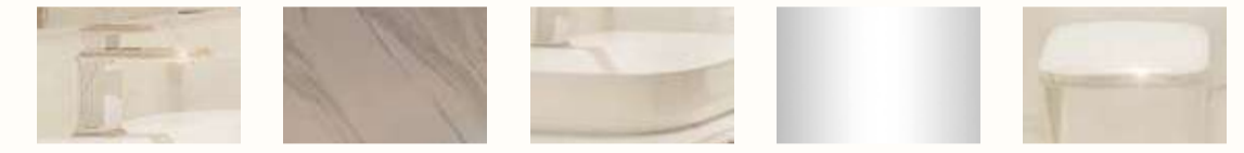
LUXURY SANITARYWARE RICH STONE FINISHES OVER COUNTER WASH BASIN MIRROR WALL MOUNTED WC