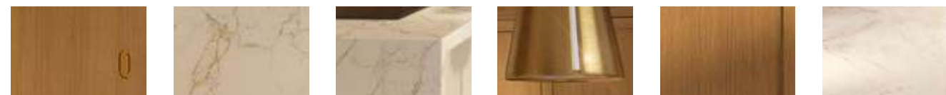
WOOD FINISH DOOR STONE FINISH FLOORING FREESTANDING KITCHEN ISLAND DECORATIVE ISLAND COOKER HOOD FROM FABER WOOD FINISH PANELLED CABINETS STONE FINISH COUNTERTOP

* GERMAN KITCHEN MECHANISM & ACCESSORIES TO BE CONSIDERED (SPICE RACK/CORNER UNIT.. ETC)