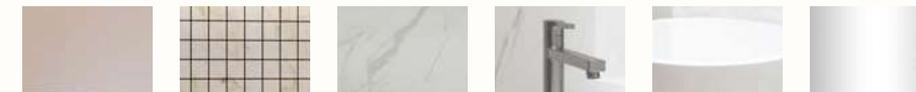
LACQUERED MATT CABINETS STATUARIO LINCOLN MARBLE MOSAIC TILE PIECES STONE FINISH WALLS FLOOR MOUNTED BASIN MIXER (GUN METAL FINISH) FREE-STANDING BASIN FULL-HEIGHT MIRROR WITH SHELF IN MARBLE

* ALL SANITARY FITTINGS FOR MASTER BATH TO BE IN CHAMPAGNE GOLD FINISH