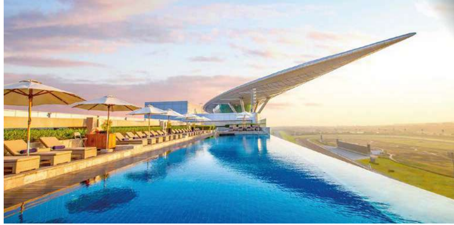
THE MEYDAN HOTEL