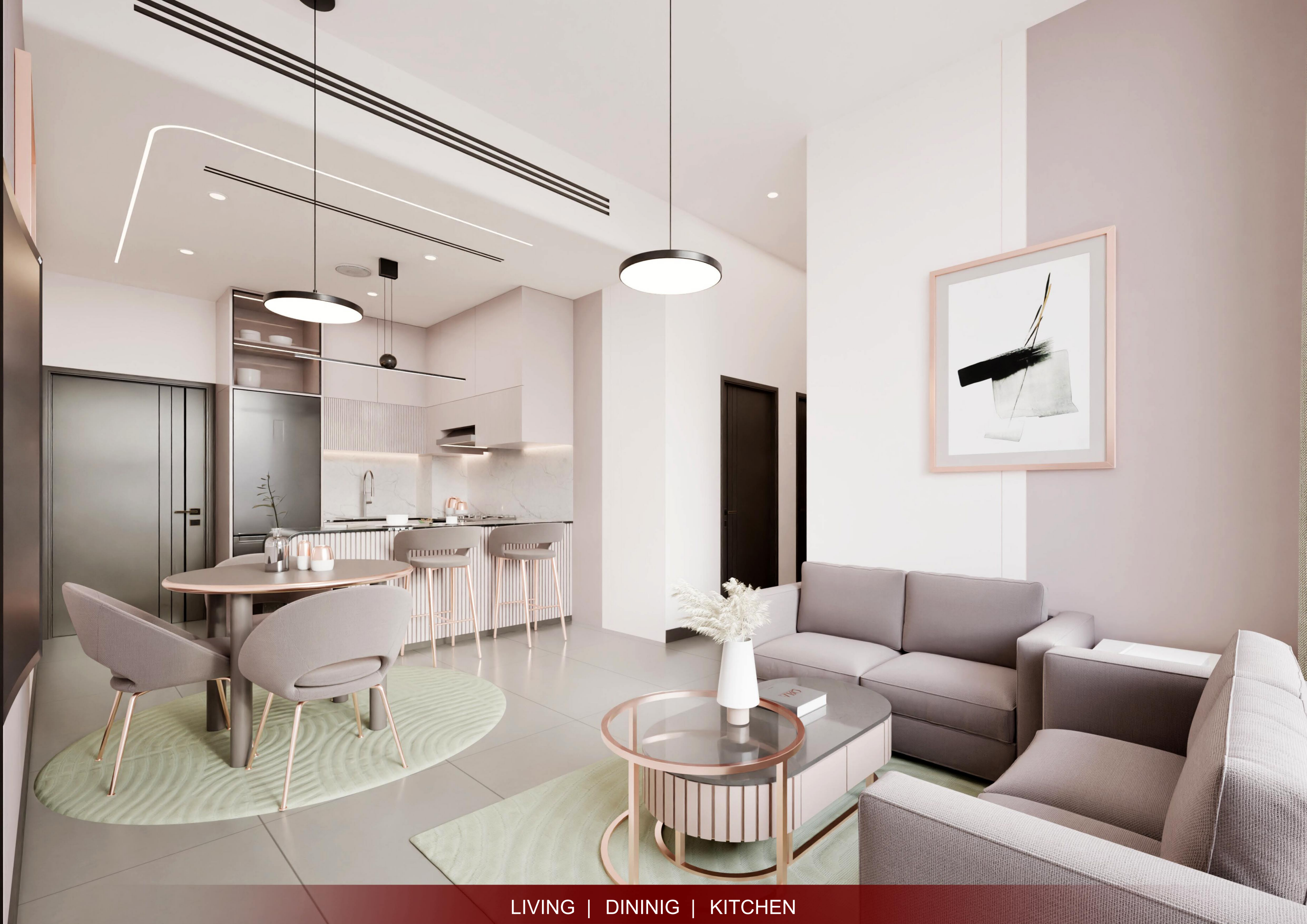
LIVING | DINING | KITCHEN