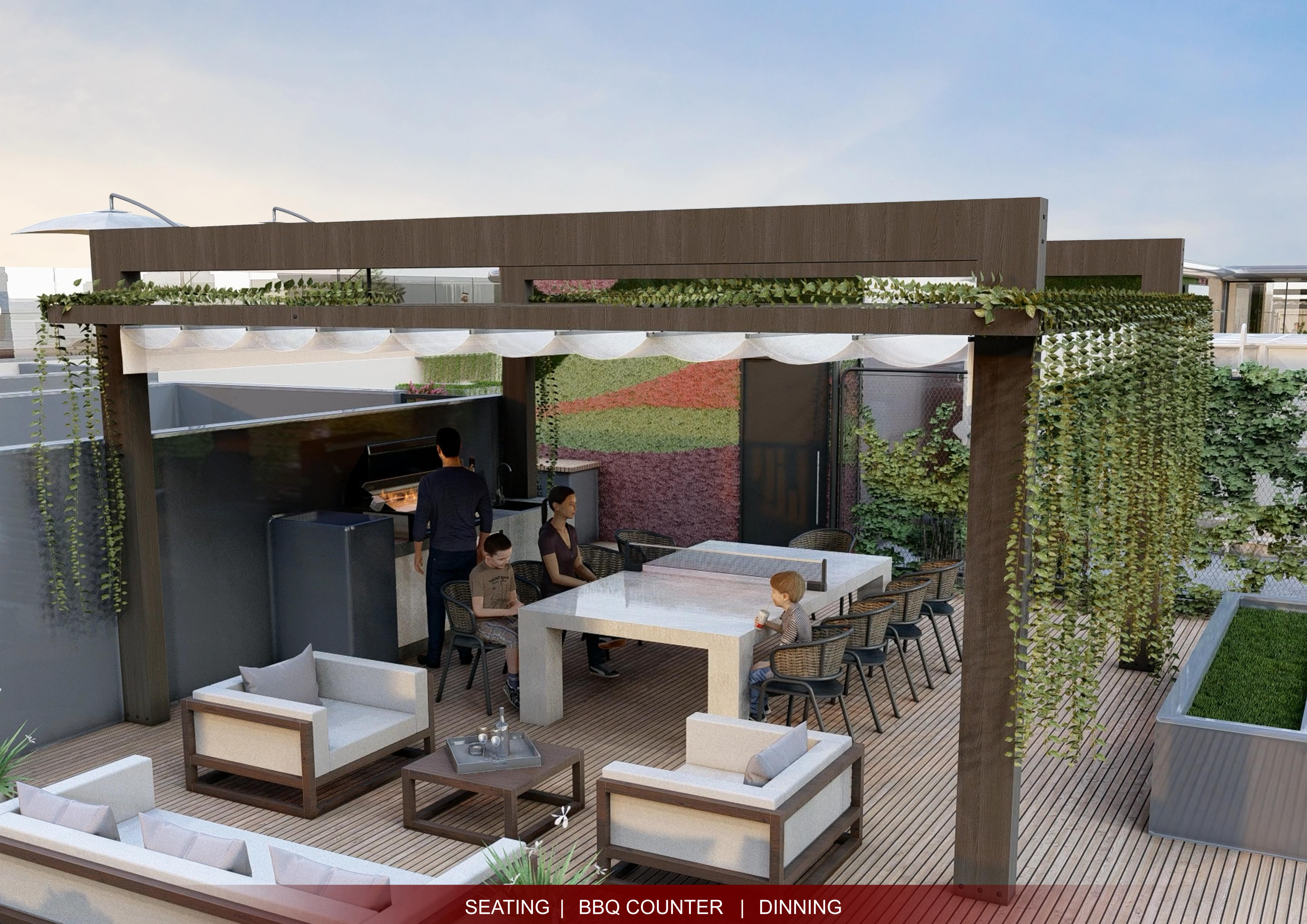
SEATING | BBQ COUNTER | DINNING