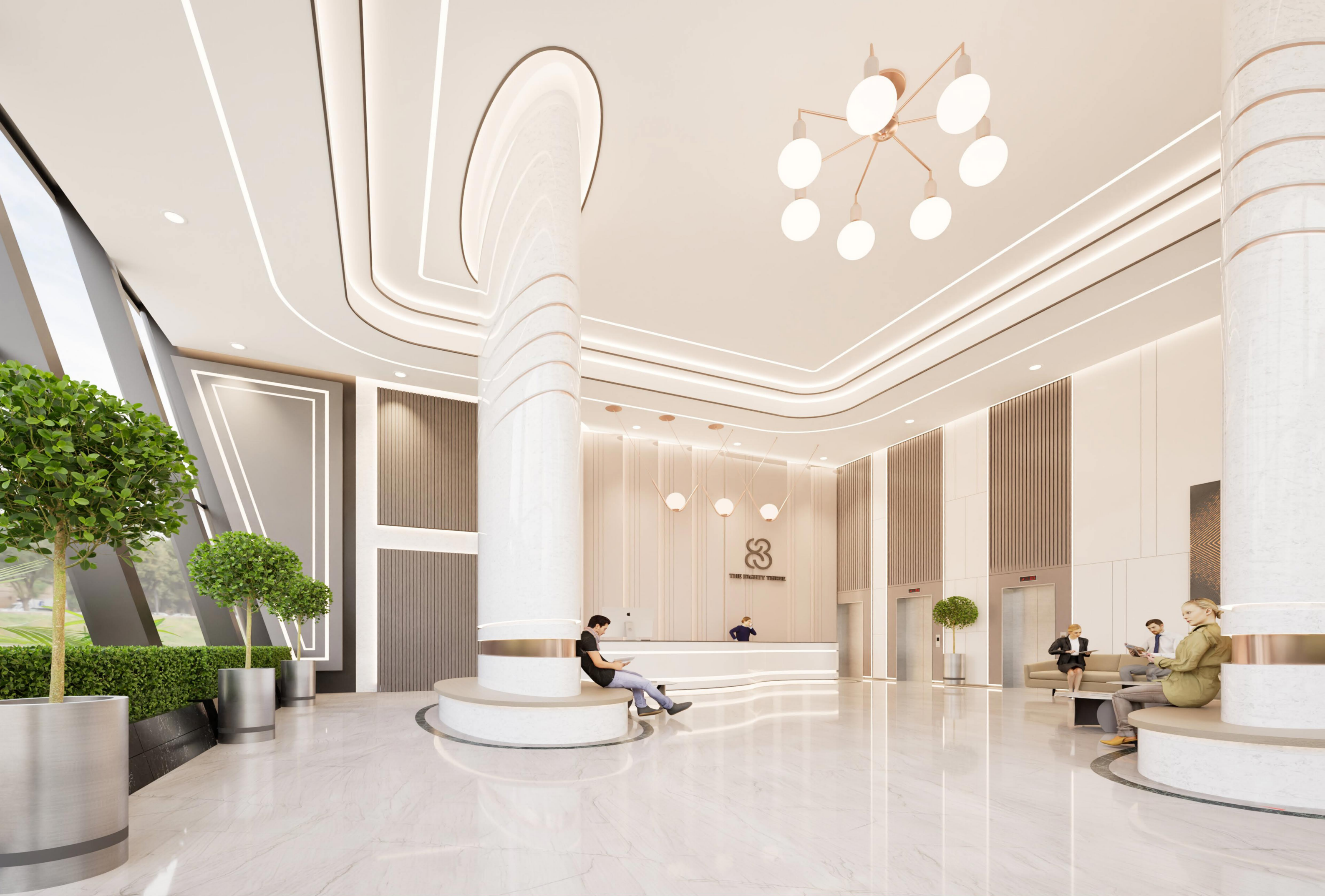
THE LUXURY LOBBY - DOUBLE HEIGHTED