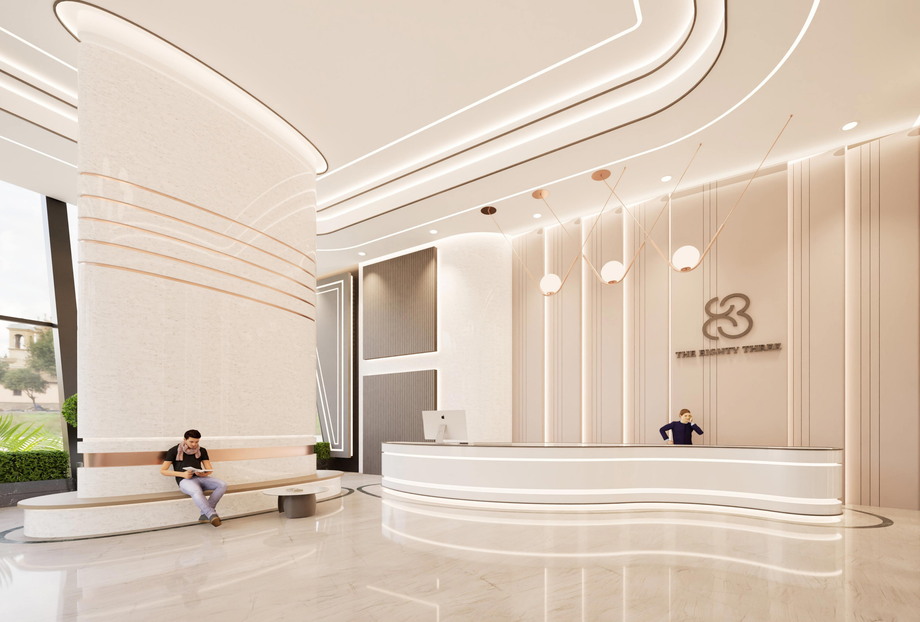
THE LUXURY LOBBY - DOUBLE HEIGHTED